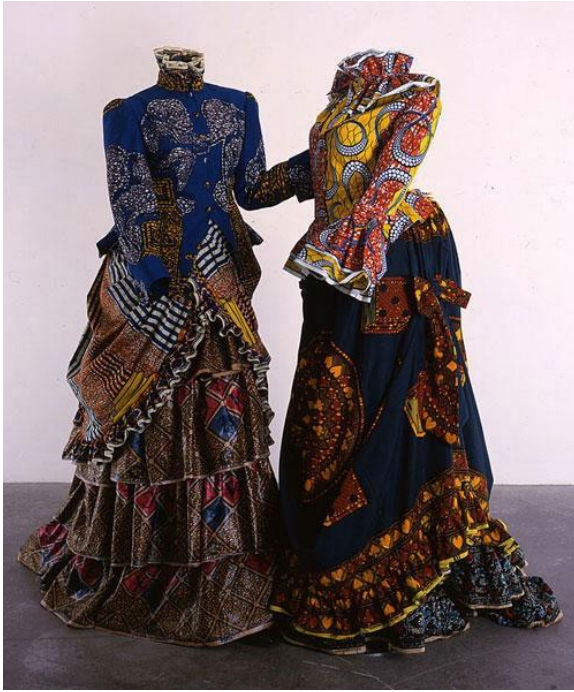
Figure 4 Gay Victorians , by Yinka Shonibare 146

The choice of fabric in Shonibare's work, also called Dutch wax prints, is significant: Dutch colonizers adopted the method of dyeing it from their Indonesian colonies, and developed designs they felt would appeal to their African colonies, thus creating a successful marketplace commodity. Shonibare creates these sculptures using this geographically-specific cultural artefact to demonstrate the global movement of artforms as a result of colonialism and challenge notions of cultural authenticity. While not recognizably steampunk as such, this approach develops an aesthetic that puts into conversation the past and the present that would create a steampunk from an African gaze, instead of overlaying Western conventions of civilizational and technological