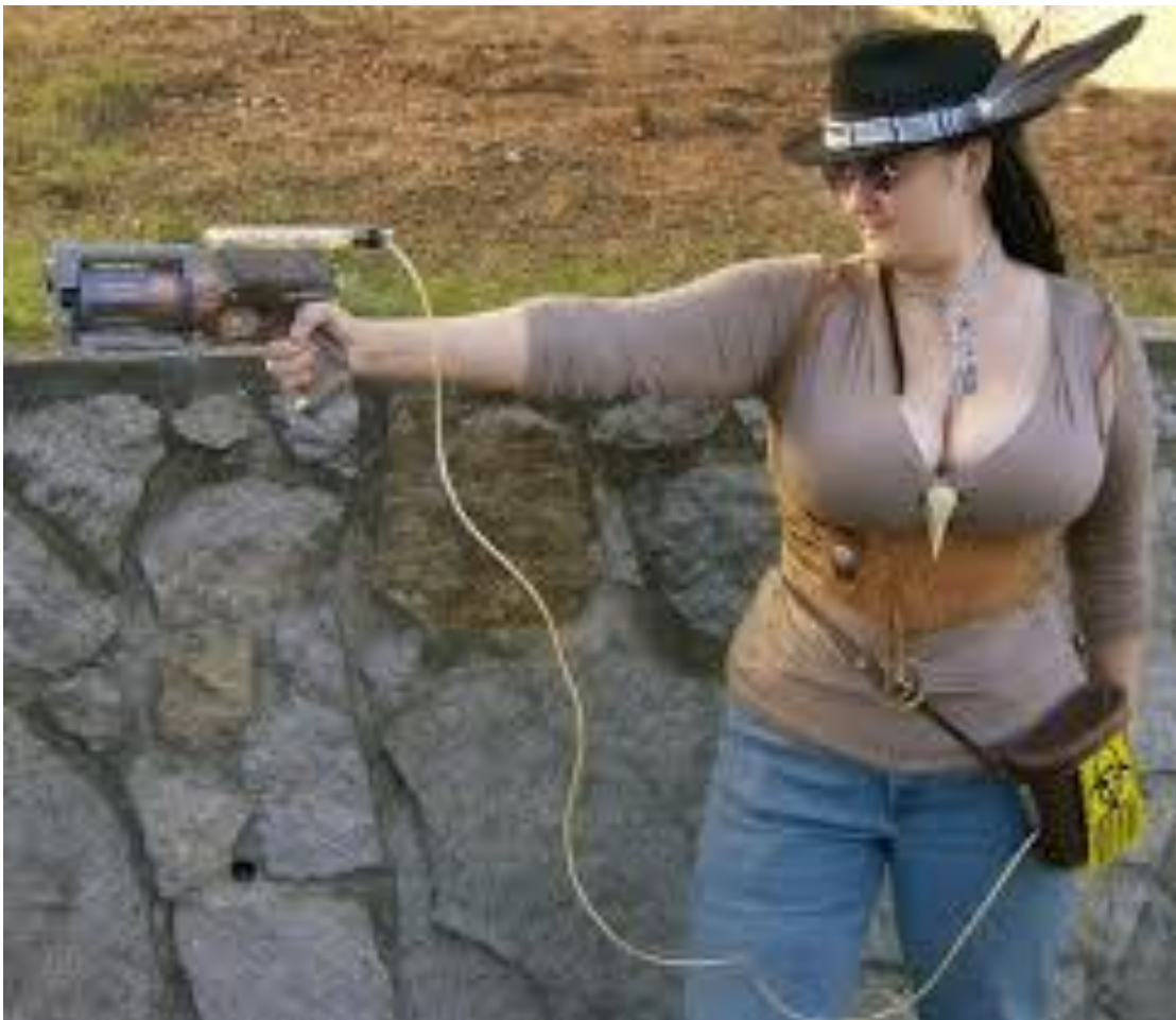
Figure 10 Native American Air Marshall

language found in conventional Victorian-based steampunk and materials commonly used by her community.