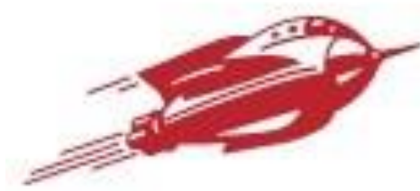
Figure 1 Stubby the Rocket, Tor.com Logo

Airships are common as a mode of transportation or even backdrop item to set the narrative in the 19 th century. Visually, they are easily adaptable; for its Steampunk Months, Tor.com’s logo, nicknamed Stubby the Rocket, becomes an airship. 89 The airship’s popularity capitalizes on the sense of marvel it evokes, because of its ability to fly. Unlike the airplane of today, the airship of the 19 th century is romantic for “their seemingly effortless progress among the cloud, and their stately arrivals and departures, matched the gentility of the environment they provided for those on board,” 90 while 21 st century airplane travel is a chore; 19 th century airship travel is an Adventure by comparison, if only because of the relative freedom, comfort, and excitement of the airship.