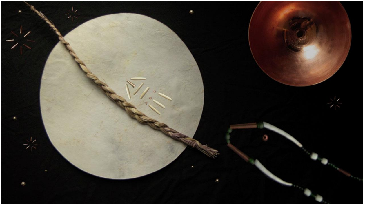
Figure 9 Still from "The Path Without End" by Elizabeth LaPensée

silhouette travel across interstellar space in canoes and starships made of beads, past moons and planets made of copper disks. Anishinabek and Moon People travel between these planets, and in between, Wetiko, a malevolent spirit depicted as a snake, chases them. In the deployment of the bricolage method in re-telling Anishinabek stories, LaPensée pushes back against the notion that steampunk must be tied to the Victorian as a point of reference.