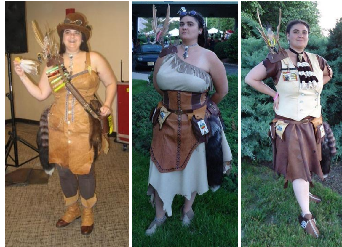
Figure 11 Native American Mad Scientist prototype 2011