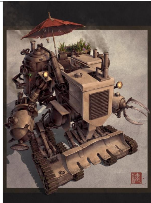
Figure 8 Harvester by James Ng