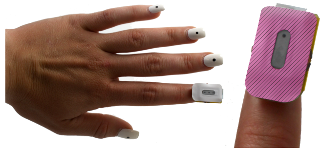
Figure 1. AlterNail being worn and closeup of an AlterNail design.

Over the past few years, wearable technologies from fitness trackers to networked smartwatches have seen massive growth, adoption, and platform diversification. Recent reports project that one-third of the US population will regularly use a wearable by 2019 [1]. By being on the body , wearables are well suited to a broad range of unique applications beyond those using other types of mobile devices. Wearables enable immediate access to body based sensing, provide personal and glanceable interfaces, and also play a role in personal fashion due to their public and semi-public visibility. As we move beyond the existing wearable platforms of fitness trackers and smartwatches, an entirely novel design ecosystem will emerge along with new interaction styles. Much of this evolution will come from research and development into new wearable