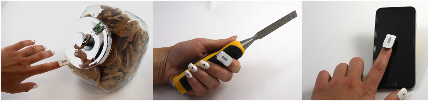
Figure 3. Left: Credits and Usage scenario demonstrated with an AlterNail enabled cookie jar. When the user opens the cookie jar, a new dot is added to their AlterNail display. Middle: Object Status scenario demonstrated with an AlterNail enabled chisel. As displayed by the AlterNail, this tool has been used three times today. Right: AlterNail updated through NFC from a smartphone. The user can discreetly check that they have one new email without unlocking and looking at their phone.

cause the team’s logo to appear across the AlterNail, rather than requiring the user to be in contact with a particular AlterNail enabled turnstile. The smartphone would detect the user’s location, determine the appropriate e-ink configuration, and power/communicate with the AlterNails via NFC.