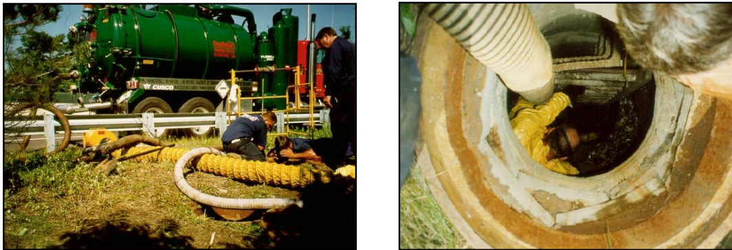
Figure 3. Vacuum truck employed during the cleaning operation of a water-quality inlet along the Southeast Expressway in Boston (left) and a maintenance worker pushing sediments to a vacuum hose while exercising “confined-space entry” protocol (right).

The assessment of any particular hydrodynamic separator should include an evaluation of the procedures, cleaning frequencies, and associated costs, as well as the treatment effectiveness, in order to determine if their use is warranted in a particular setting.