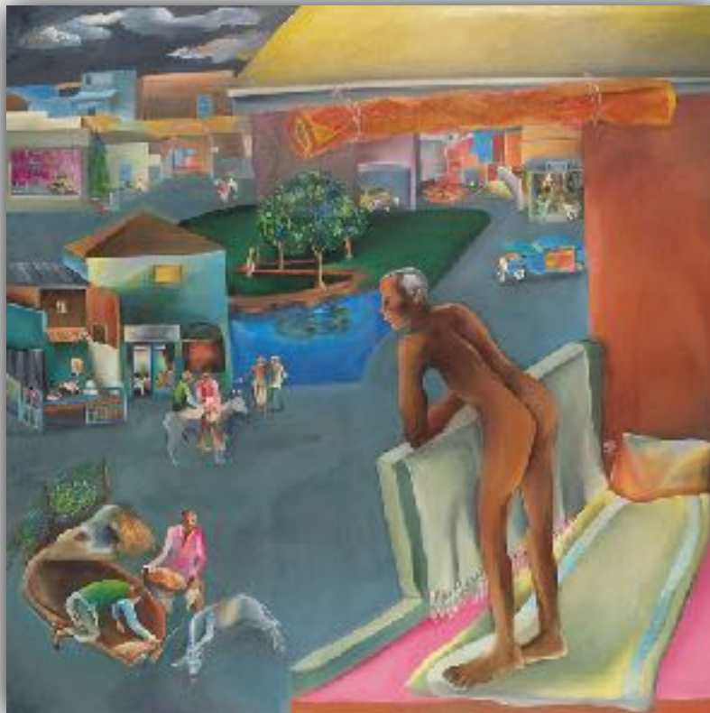
FIG. 3 BHUPEN KHAKHAR, YOU CAN'T PLEASE ALL , 1981, OIL ON CANVAS, 175.6 X 175.6 CM