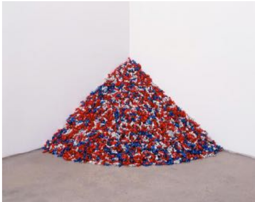
FIG. 9 FELIX GONZALEZ-TORRES, UNTITLED (PORTRAIT OF ROSS IN L.A.) , 1991, CANDIES INDIVIDUALLY WRAPPED IN MULTICOLORED CELLOPHANE, ENDLESS SUPPLY, SIZE VARIABLE