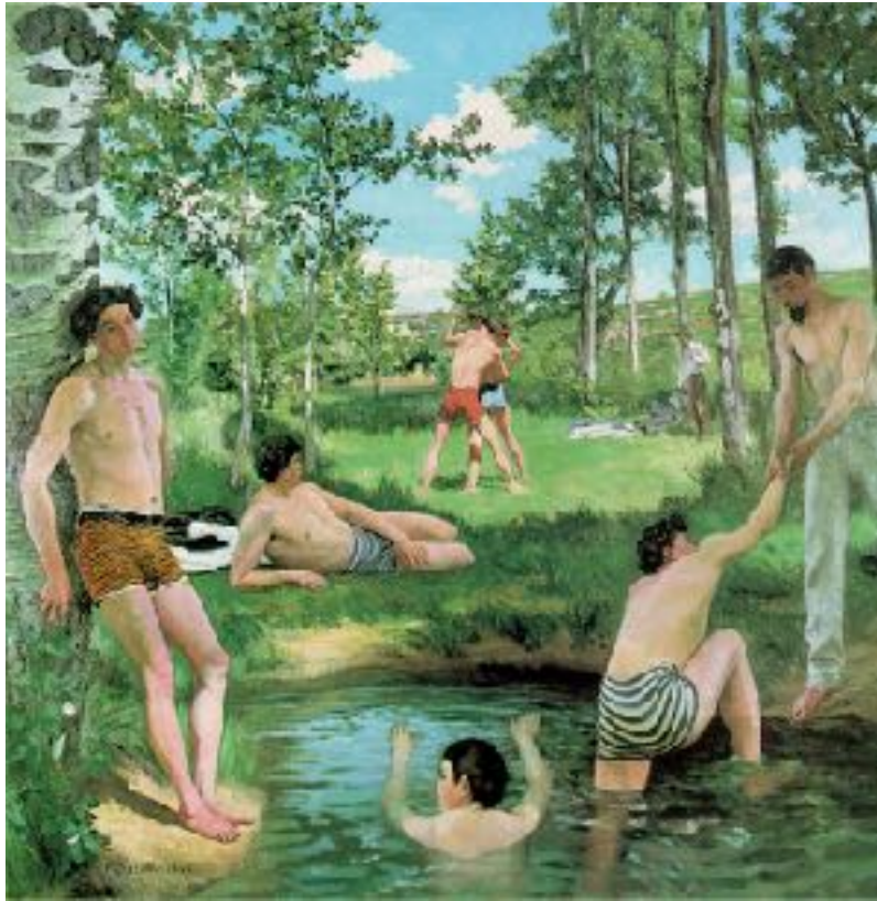
FIG. 1 FREDERIC BAZILLE, BATHERS (SUMMER SCENE), 1869, OIL ON CANVAS, 158 X 158 CM