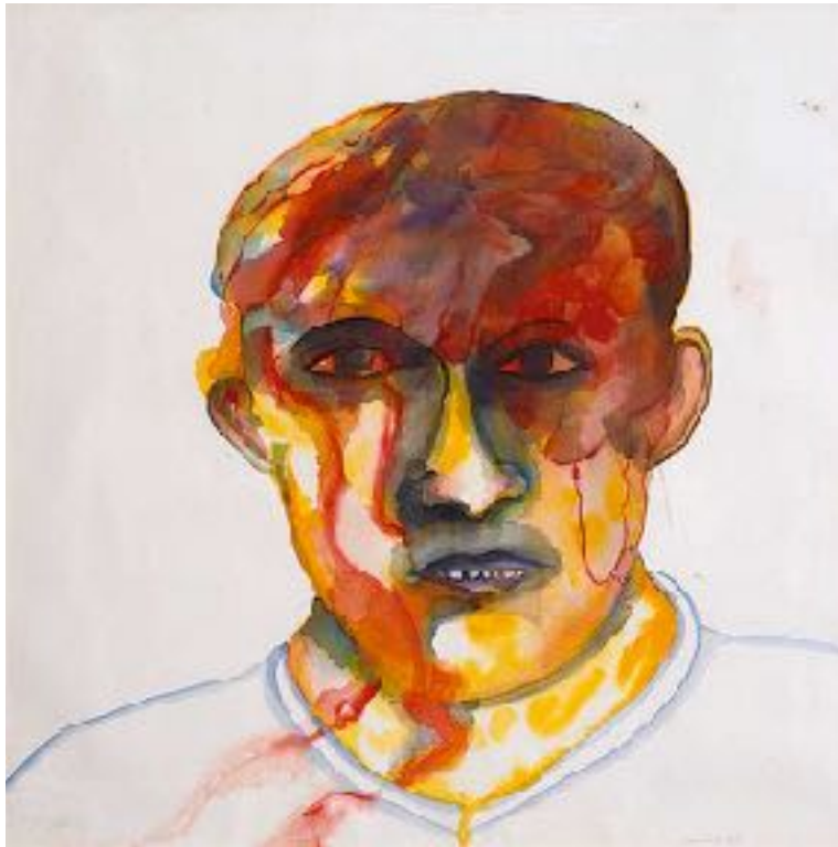
FIG. 6 BHUPEN KHAKHAR, INJURED HEAD OF RAJU , 2001, WATERCOLOR ON PAPER, 113 X 111 CM