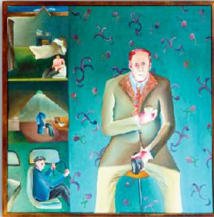
FIG. 2 BHUPEN KHAKHAR, MAN IN PUB , 1979, OIL ON CANVAS, 122 X 122 CM