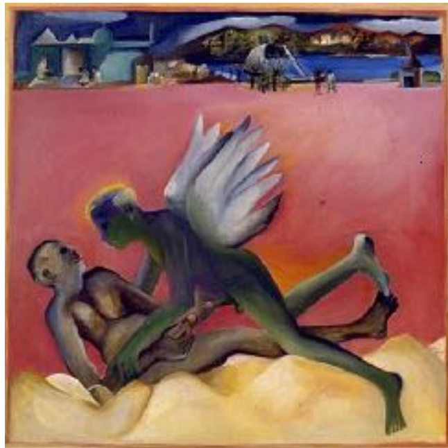
FIG. 7 BHUPEN KHAKHAR, YAYATI , 1987, OIL ON CANVAS, 170 X 170 CM