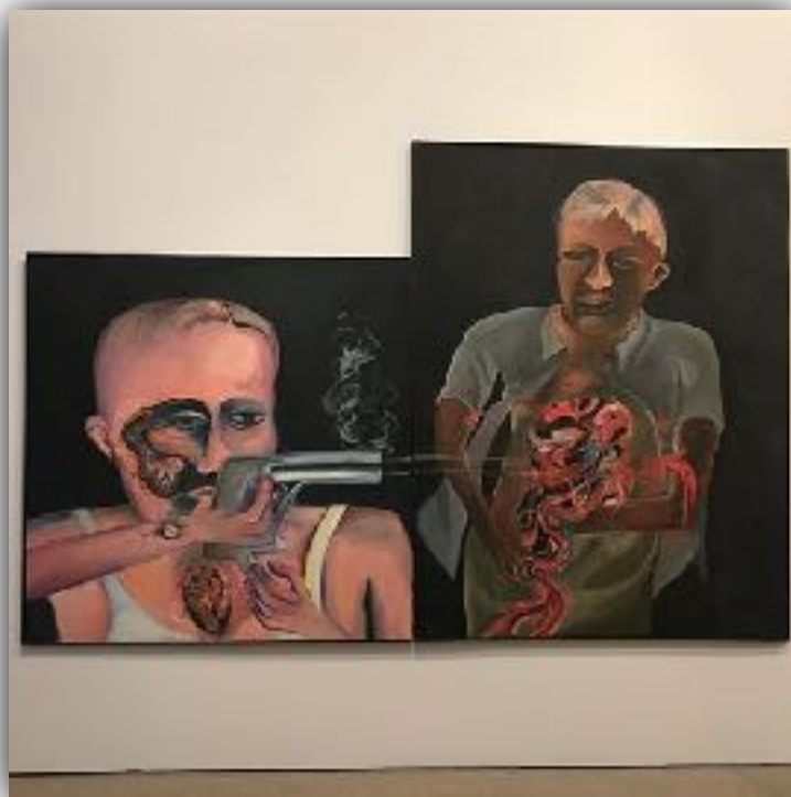
FIG. 5 BHUPEN KHAKHAR, BULLET SHOT IN THE STOMACH , 2001, OIL ON CANVAS, 228.6 X 353 CM