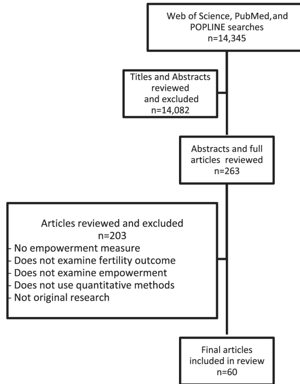
Fig. 1. Flow chart of literature search.