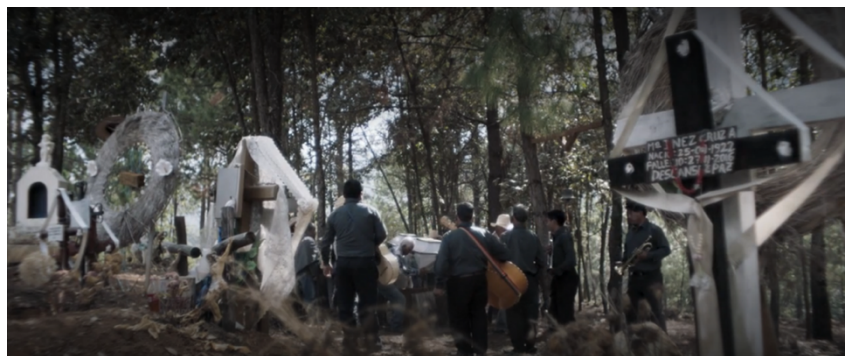
Figure 16. Burial at the cemetery. Screenshot of Nudo Mixteco (2021).

During the burial, community members hold baskets full of flowers and mezcal is passed