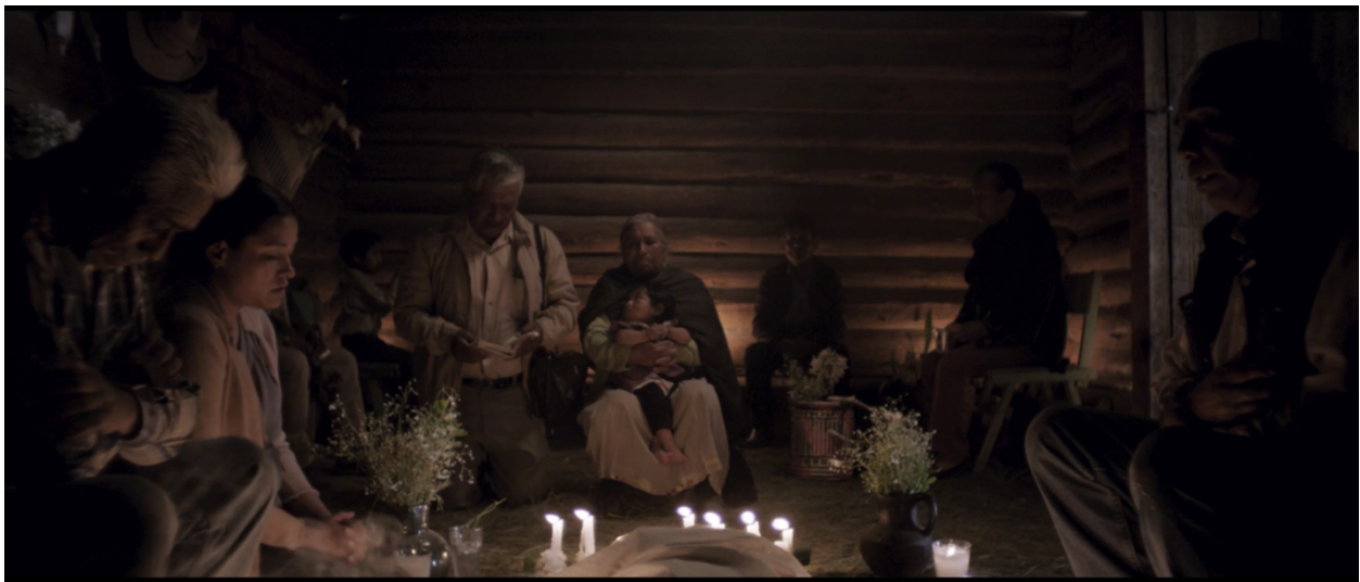
Figure 12. Gathering at a wake. Screenshot of Nudo Mixteco (2021).

The first scene after the title screen depicts the communal cooking tradition that occurs outdoors during a wake. It is a common practice for community members to form a chain when cooking together at such events. Each person is responsible for a part of the cooking such as making tortillas (figure 9) and filling the tortillas (figure 10). Communal cooking is a form of Indigenous carework for the grieving family and community members in the pueblo who wish to pay their respects, whether or not they knew the deceased. In addition to food, mezcal is also shared and an integral part of pueblo wakes, funerals, festivities, and medicinal care (figure 11).