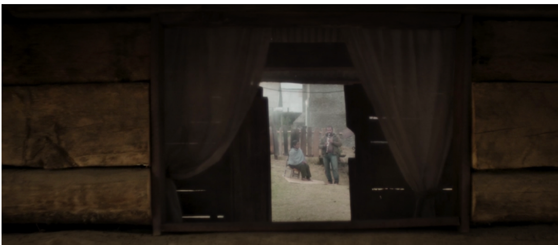
Figure 30. View from inside of burning house. Screenshot of Nudo Mixteco (2021).

Esteban's final act is reserved for the last scene in the film where he decides to light his house on fire after stating, "So much house. Such a fool" (Cruz, 2021, 53:09). Despite being awarded the house by the pueblo assembly in his case, he does not seem to value it or consider what it may mean to his elderly mother who now depends on him as they both watch it burn (figure 31).