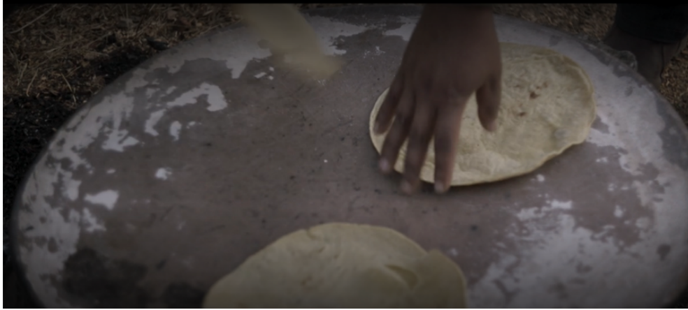
Figure 9. Tortilla turning at a wake. Screenshot of Nudo Mixteco (2021).