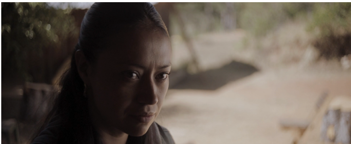
Figure 28. Maria stares at her father. Screenshot of Nudo Mixteco (2021).