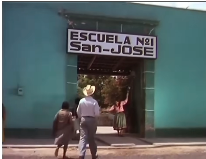
Figure 5. The first school in San Jose. Screenshot of Tonta, tonta, pero no tanto (1972).

their incredulousness at her outwitting their supposed intellectual superiority but is aligned with Indigenista cinema by highlighting their moral inferiority.