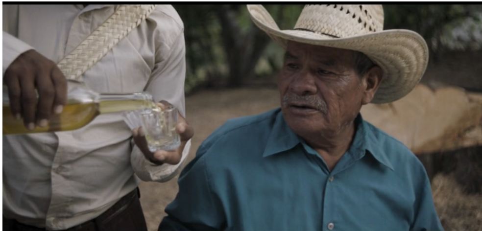
Figure 11. Mezcal drinking at a wake. Screenshot of Nudo Mixteco (2021).