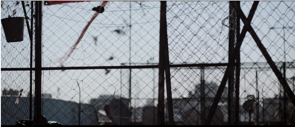
Figure 6. Fenced in looking at birds take flight. Screenshot of Nudo Mixteco (2021).

scene visually represents the sentiment of the opening quote.