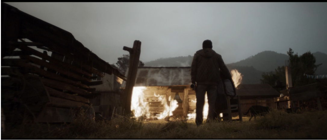
Figure 31. View from outside of burning house. Screenshot of Nudo Mixteco (2021).