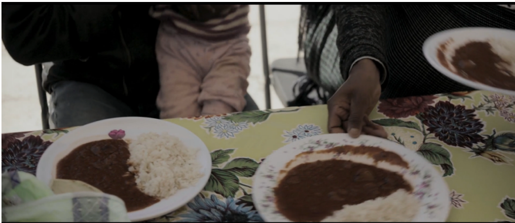
Figure 18. Sharing food at patron saint festivity. Screenshot of Nudo Mixteco (2021).

During the annual patron saint festivity, the community dances, shares food, plays music,