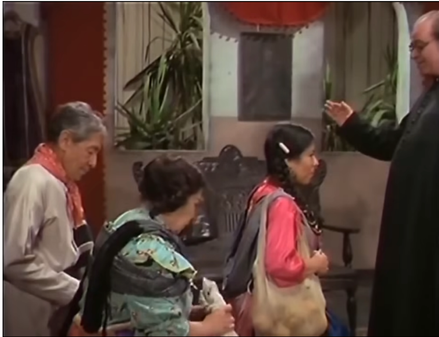
Figure 4. The priest's blessing. Screenshot of Tonta, tonta, pero no tanto (1972).

and Mestizo/Native. Therefore, I will also briefly examine those binaries in the context of Tonta, tonta, pero no tanto (1972).