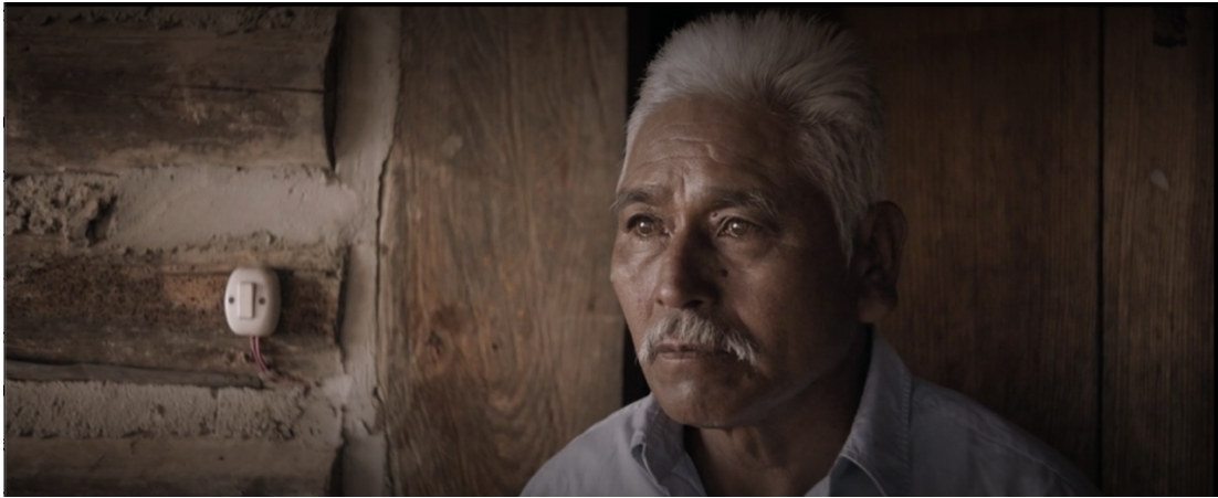
Figure 29. Don Julian watches Maria walk away. Screenshot of Nudo Mixteco (2021)..

towards the light. Lighting is used in this way to represent Maria walking toward new beginnings.