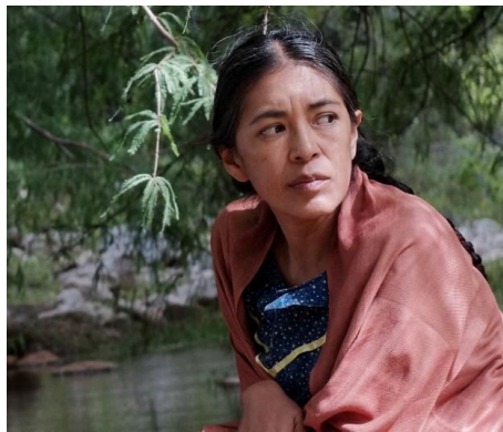
Figure 7. Doña Sole looks away at the river. Screenshot of Tiempo de lluvia (2018).

vendors by requesting a payment. It is unclear how safe Toña feels within the relationship, but she displays a desire for distance. For example, she does not let her boyfriend spend the night with her or accompany her to her pueblo. It is possible that her relationship is out of convenience and represents another relationship of unequal power dynamics. While Toña seems unhappy in a loveless relationship with an unlikeable partner in the city, she is given closure through the process of accountability she demands of her abuser and mother in the pueblo assembly.