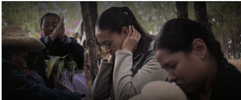
Figure 15. Mezcal at the burial. Screenshot of Nudo Mixteco (2021).

casket to the cemetery, and play live music (figures 13 and 14). Jansen and Pérez Jiménez (2017) convey a similar scene as recorded in the aforementioned funeral rites of Lord 12 Movement during which it included “processions of armed people to the sound of an orchestra playing drums, gourd trumpets, rattles and beating turtle shells with deer antlers” (p. 120). The filmic representation of the procession and orchestra demonstrate how this funeral rite has been maintained with modern instruments, but also as an integral part of Mixtec pueblo life and kinship. Hernández-Díaz and Robson (2019) assert that the usos y costumbres framework is a native Oaxacan governance system which is comprised of “the cargo, tequio, and assembly” (p. 32). The cargo, tequio, and assembly are collective institutions of labor and communal service. Musicians, such as the ones participating in the funeral procession, take on a cargo, often for life.