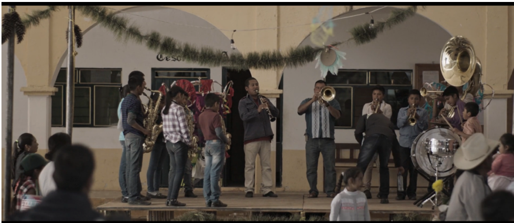
Figure 17. Patron saint festivity with band. Screenshot of Nudo Mixteco (2021).

around to cleanse and fortify the attendees (figure 15 and 16) while a prayer is sung. Jansen and Pérez Jiménez (2017) along with codices, examine Tomb 7, a sacred burial site located in Monte Alban and affirm that burial sites functioned as a space “for offerings with the corresponding invocations and prayers” (p. 547). The passing around of mezcal, aside from its medicinal and protective purposes, could also be seen as a present-day manifestation of historically sharing pulque, also fermented from the same maguey plant, present at funeral rites.