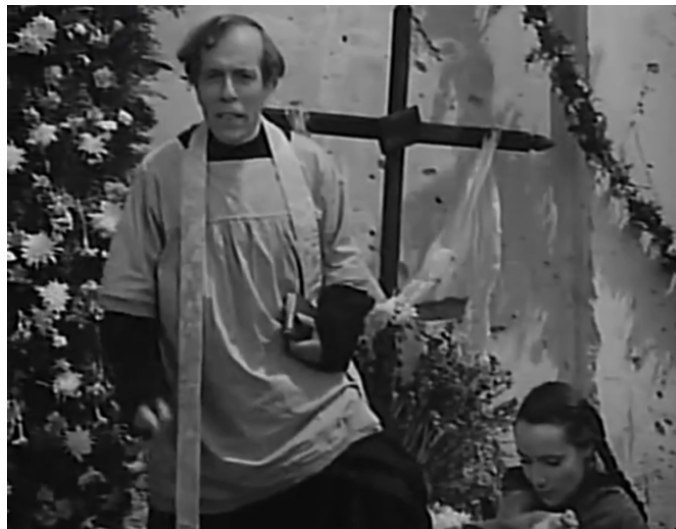
Figure 2. Priest hovers over Native characters. Screenshot of Maria Candelaria (1944).