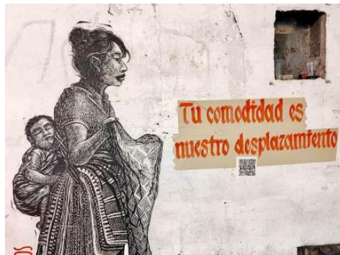
Figure 33. Tu comodidad es nuestro desplazamiento. (Editorial Ocho Trueno, 2022).

harvesting is rendering certain species of agave vulnerable and impacting ecosystems more broadly.