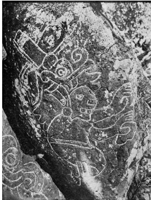
Figure 26. Oxomoco: Piedra de Coatlán. (Robelo, 1910).

carried into the 21 st century as an act of resistance and survival.