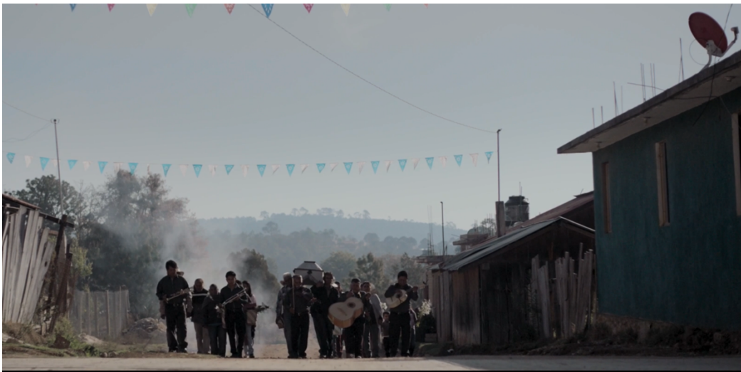
Figure 13. Distant funeral procession with band. Screenshot of Nudo Mixteco (2021).

many Zapotec and Mixtec pueblos, boxes and baskets (canastas) are utilized and contain items necessary and requested for various pueblo rituals. When Piedad arrives to the wake, she offers an elder a canasta containing flowers and other items, most likely, candles, mezcal, copal and food. Therefore, the wrapped deceased body and the basket offered are filmic representations of sacred bundles still in use as a 21 st century technology which demonstrates the importance of honoring the deceased, and thus, the divine, through kinship-based exchange.