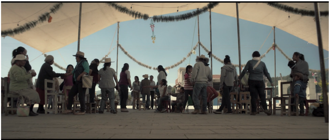
Figure 19. The pueblo assembly. Screenshot of Nudo Mixteco (2021).

and drinks alcohol together (figures 17 and 18). These scenes represent embodied kinship through the celebration and organization of the festivity. Hernández-Díaz and Robson (2019) contend that in addition to the cargo of being a musician at a community event, mayordomías comprise of a group of community members who are “given the responsibility to organize and oversee their villages’ patron saint celebrations” (p. 28). Although not explicitly discussed in the film, the roles of the musicians and mayordomos in pueblo ceremonies and festivities represent the ongoing importance of pueblo governance.