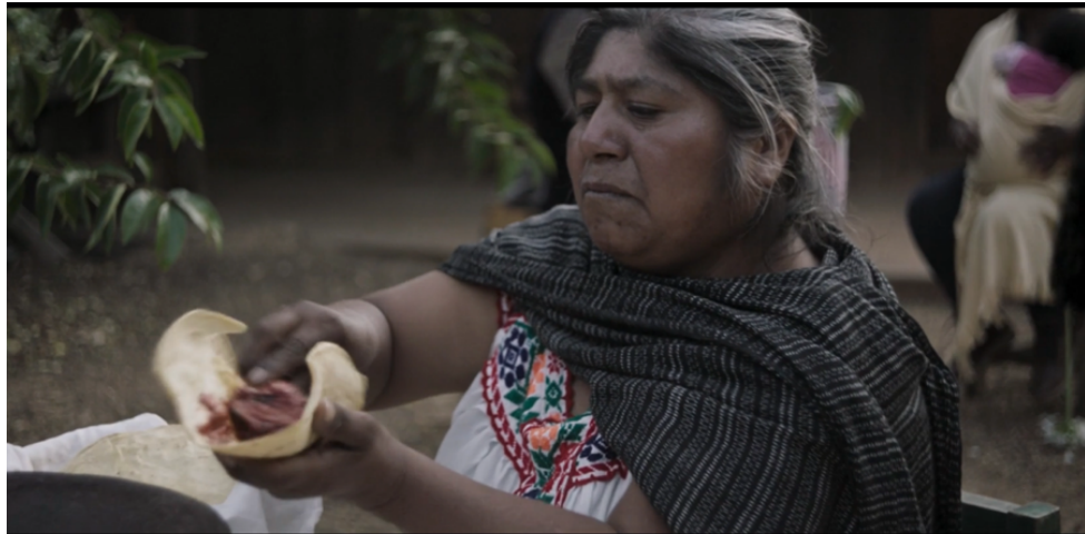
Figure 10. Taco filling at a wake. Screenshot of Nudo Mixteco (2021).