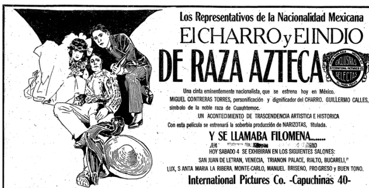
Figure 1. De Raza Azteca ad. ( El Universal , 1922, 5).

During the silent film period, nationalist fiction films about the Mexican Revolution emerged. The Mexican Revolution, which occurred from 1910 to 1920, was in essence an “agrarian revolution headed by Emiliano Zapata” (Boyer, 2015, p. 41) and did not necessarily originate as a “peasant uprising” (Boyer, 2015, p. 45). The Mexican Revolution had many factors including widespread commodification of the land and its resources which led to land dispossession under the dictatorship of Porfirio Diaz. As industrialization of Mexico increased, Native peoples and pueblos were dispossessed of land by foreigners and the wealthy elite sought to invest and profit off emerging industries such as railroads and mining. Thus, many Native and rural pueblos joined the revolution to fight against the hacienda regime and in doing so, redefined their social category as campesinos, universally understood today as a peasant class comprised of “poor rural people who either own their own small parcels or who work as rural laborers” (Boyer, 2015, p. 41). Many nationalist films of the 1920’s reflected the tensions between Natives and hacienda owners/ranchers.