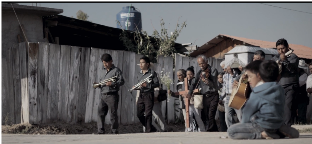
Figure 14. Nearby funeral procession with band. Screenshot of Nudo Mixteco (2021).

During the funeral procession, family and community members join, cry, sing, carry the