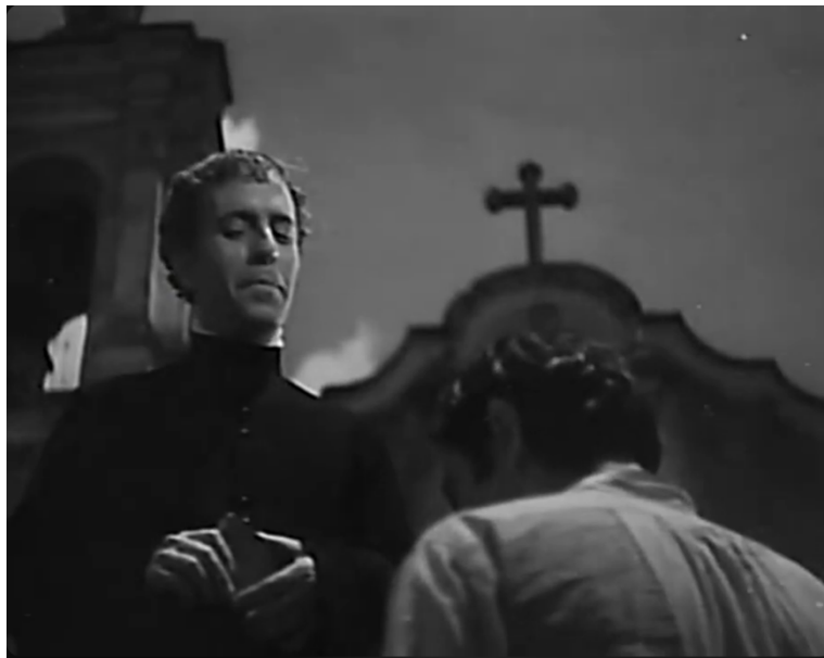
Figure 3. Priest looks down on Native character. Screenshot of Maria Candelaria (1944).

frame or in low angle shots (figure 3) which demonstrates the ways he possesses power over and is symbolically superior to Native subjects. This power imbalance represents the oppressive function of the Catholic Church in Native peoples' lives, but as part of a cinematic nationalist building project, conveys the state's need to assimilate Natives who are considered inferior, meek, and submitting by their own volition. In figure 2, the priest reproaches a hostile Native pueblo for threatening and bullying Maria. He stands above Maria and the crowd, depicted as fighting children, who seemingly need the priest to bring order and decorum into their lives. His supposed voice of reason is the only one capable of quelling the dispute and solicits regret over the cruel behavior from a Native woman character. The priest is also utilized as a judge of good and noble character through signs of his approval when Maria and Lorenzo behave in ways which demonstrate loyalty and faith to the Church (figure 3).