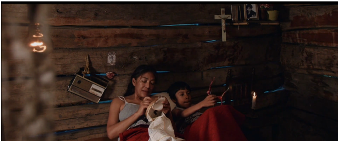
Figure 23. Intergenerational knowledge exchange. Screenshot of Nudo Mixteco (2021).

The particular aspects of these traditions are immediately recognizable to Mixtec and Zapotec viewers who have attended similar events. The capturing of these traditions on film not only memorializes the embodied practices between kin, but also connects the traditions to Mixtecs across Oaxaca and the diaspora. For those who have memories of their pueblo(s) of origin, this film also fosters a sensation of familiarity and kinship with other pueblos.