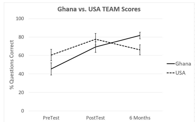
Figure 1 Pre-course, post-course and 6-month follow-up test scores, by country (mean±SD).

*Significant difference between countries ( p < 0.05 ).