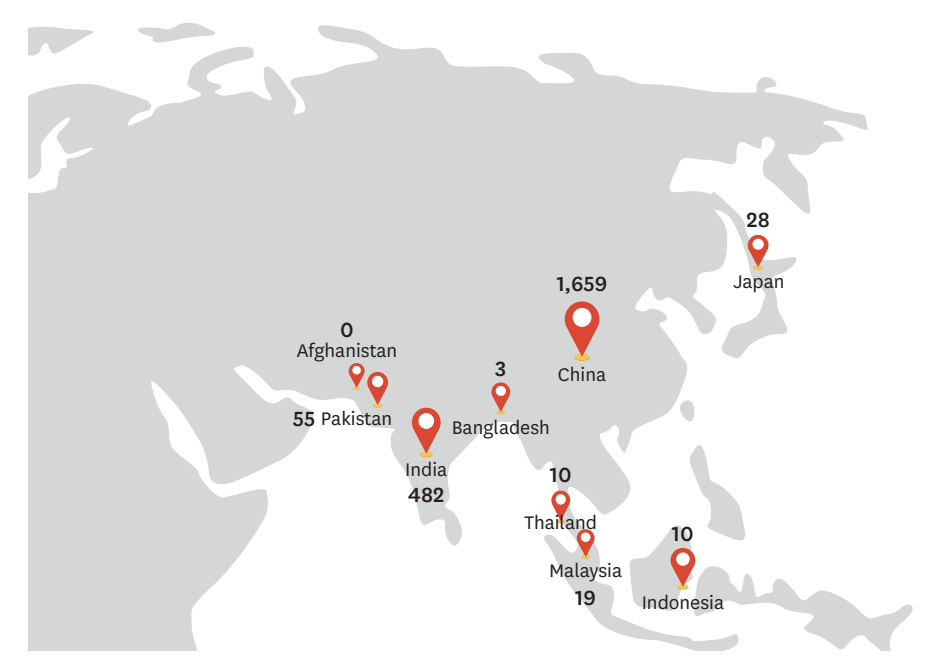
Fig. 2. Number of retracted articles in various South, East and Southeast Asian countries. Fig. 2 shows the number of retracted articles from countries in South, East and Southeast Asia between 2020–2022 according to the retraction watch database.