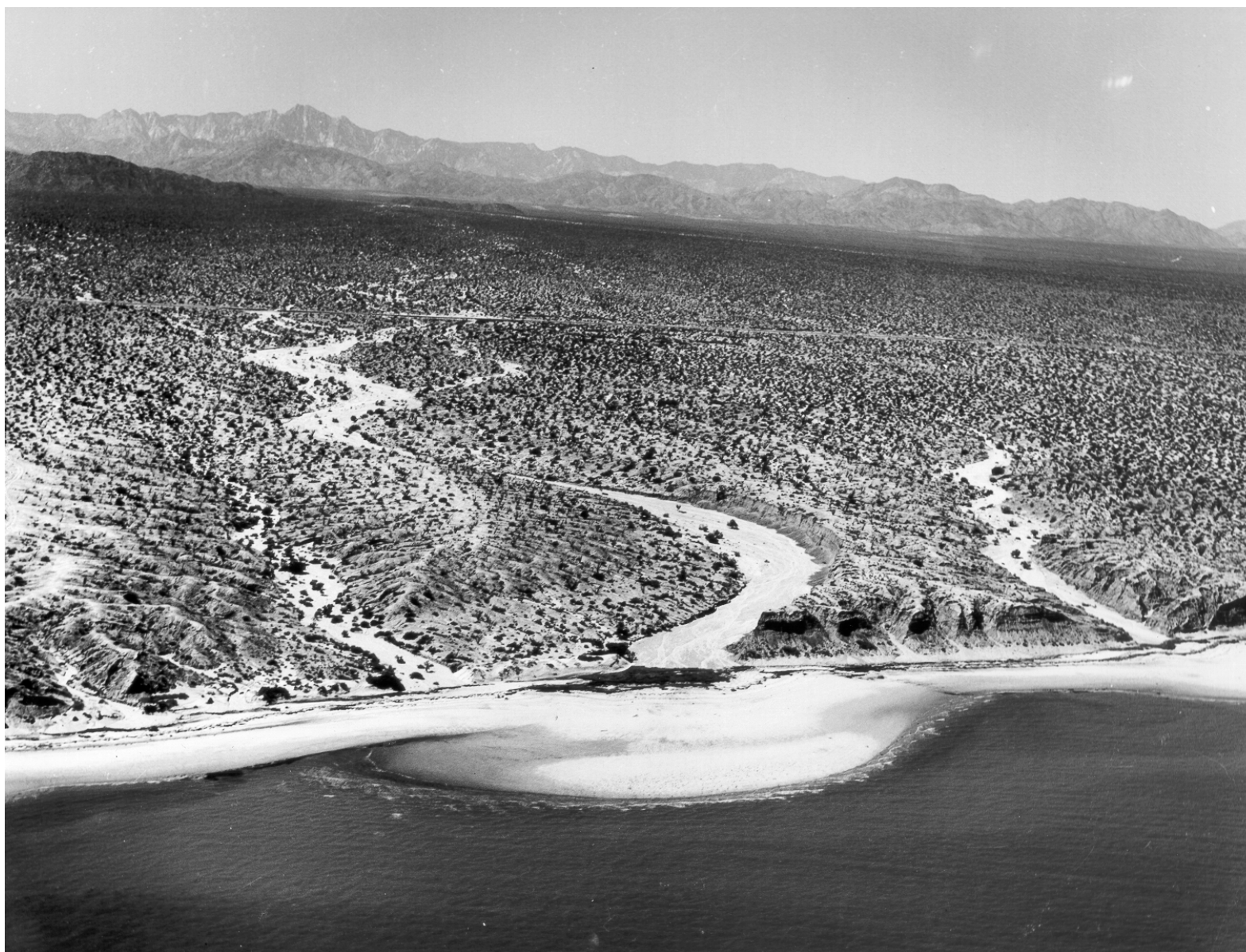
Figure 3. Streams carry erosion products from the land to the sea; El Moreno, Gulf of California, Mexico.