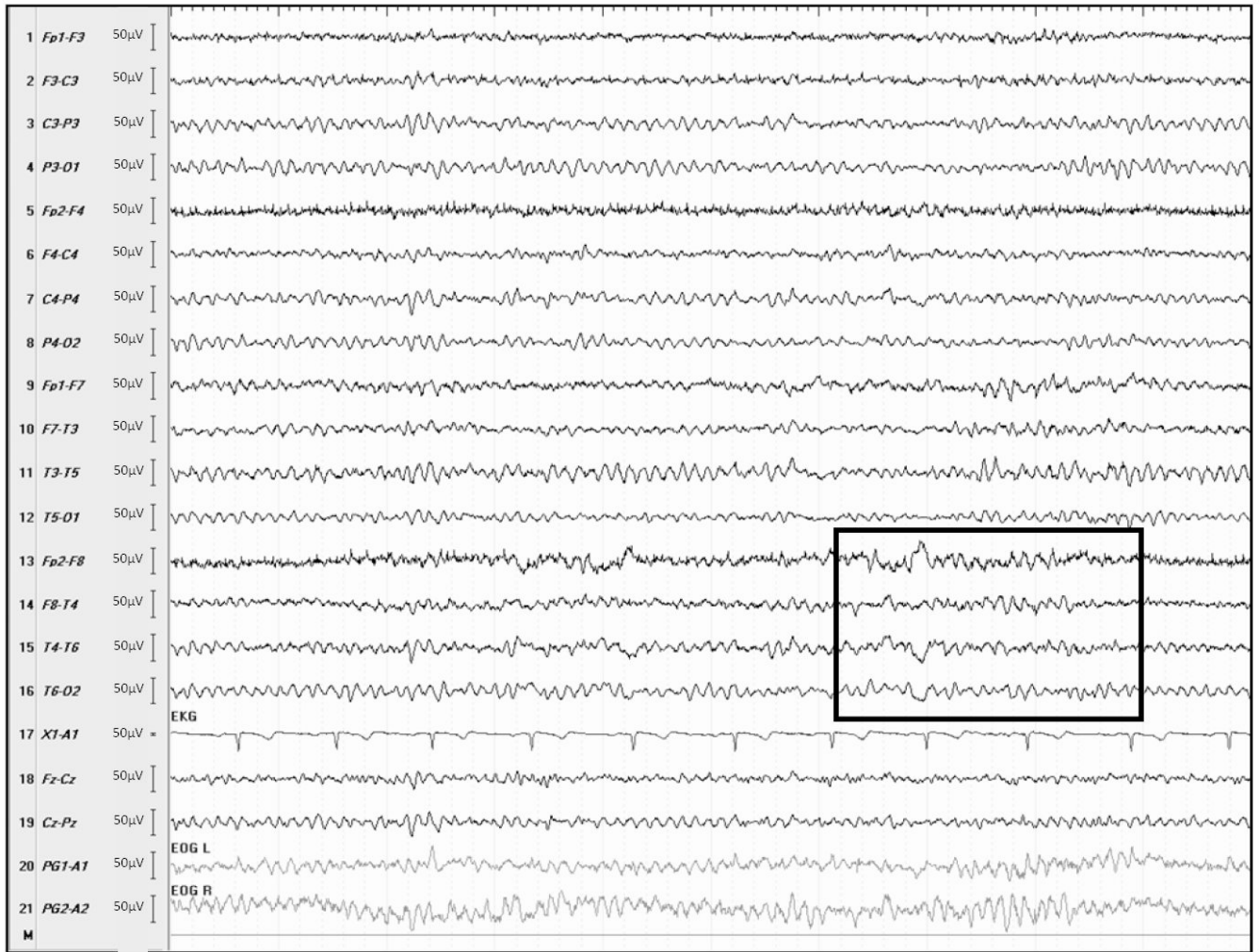
Figure 2. Displays intermittent polymorphic temporal delta (right > left); the clearest example in this tracing is highlighted with a black box.