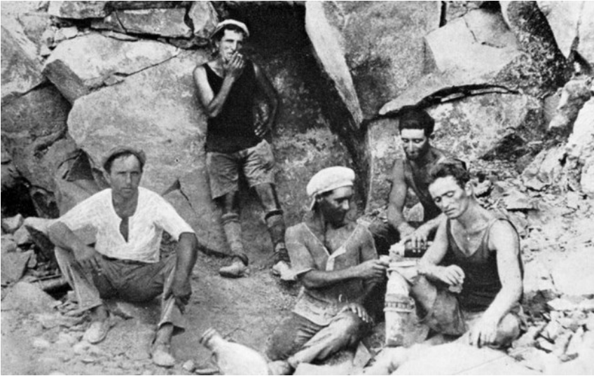
Work Battalion members in a quarry, 1928.

But in the dark, the shifty passions of the heart lurked for those founding fathers as well. Behind the zeal hatred was hidden—and at times downright misanthropy. Behind the self-denial, exhaustion and suppressed desires, and behind the devotion, a lust for power and rule [...] And at night, when no one could hear, they wept longingly for everything that was left and abandoned knowingly so as never to return. Father's house. Or career and honor. Or piano playing and other artistic gentilities. European landscapes, forests and rivers and snow. 30