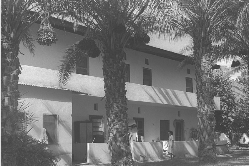
A typical kibbutz house in 1945 with four apartments on each floor and shared toilets.

some kibbutzim members even got a small radio. Each one of those changes was preceded by months and months of arguments and counterarguments. “This is the end of the kibbutz,” people said when electric kettles were provided. “This is the end of the kibbutz,” they said when hot water pipes were installed in the residential areas. “This is the end of the kibbutz,” they said when trash cans were provided for members’ kitchens.