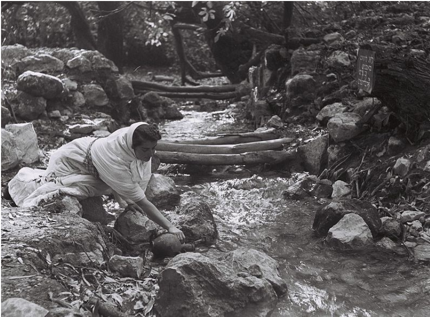
Woman drawing water from the Spring of Harod in the Jezreel Valley (picture taken in 1946 in a “reenactment” of Ein Harod’s first days).

The newly acquired territory of Nuris was just large enough to turn this vision into reality, Levkovitz thought, and he approached the leadership of the Work Battalion to suggest that they start a new permanent settlement by the Spring of Harod at the foot of Mount Gilboa. This massive type of settlement was to be called kibbutz , which means “collection” or “congregation,” to distinguish it from kvutzah , which means “group.” Both words derive from the same root ( kbtz ), meaning “to bring together,” but the size and scale were different. The first settlement that referred to itself as a kibbutz was established in September 1921 and received the name of the spring that marked its location: Ein Harod.