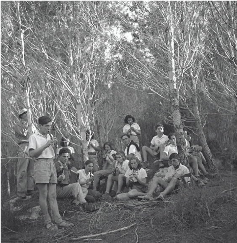
Children in Shomria in the early 1940s.

the different kibbutz organizations from one another—that brought together teenagers from several kibbutzim into one institution. In most kibbutzim, high school students continued to live in their own kibbutz and would walk (or later, be bussed) to the school, but in kibbutzim aligned with HaShomer HaTza'ir—ever the fundamentalists—the educational institution was effectively a boarding school where the students lived, worked, and conducted a fully independent social life as of the age of twelve. The first educational institution of HaShomer HaTza'ir, Shomria, was established in kibbutz Mishmar HaEmek in 1931 and brought together youth from multiple kibbutzim who all roomed together in one big house. The guiding notion of the institution was “a republic of youth.” The students were to take full charge of every aspect of their lives with the adults on the premise intervening only in matters of safety, health, and finances. This was set to be a full-on preparation for kibbutz life, including the administrative structures of committees, votes, self-surveillance, debates, work dispatchers, and rotating assignments.