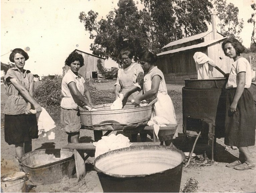
Women washing clothes in a kibbutz circa 1935.

Where a watchman does not sleep nor a farmer rest, And even a child knows how to plant. 55