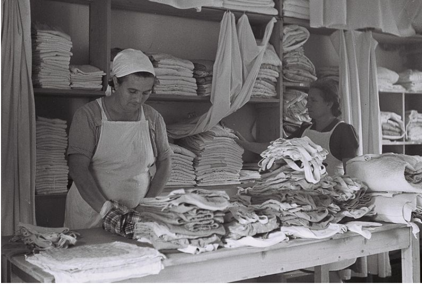
Preparing weekly clothing supplies in kibbutz Ginegar, 1947.

simply threw them around whenever they took them off—in the shower or elsewhere—and you could often see people wiping greasy hands or even shoes directly on their clothes.