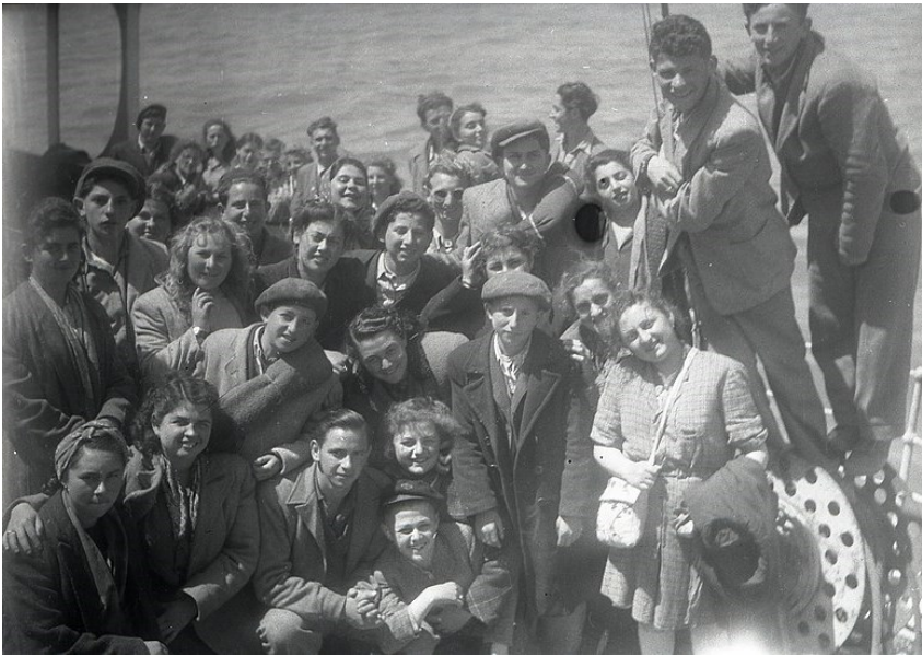
Teenagers of Aliyat HaNo'ar getting off the boat, 1948.

in Germany to help young adolescents (mostly thirteen to fifteen years old) immigrate to Palestine without their parents, back then exclusively on a voluntary basis and only after a period of preparation. In the course of World War II and in its aftermath, Aliyat HaNo'ar expanded its mission substantially and sought children of all ages who had no parents or whose parents could not care for them. These children often owned nothing but the clothes on their backs, received little to no education, and suffered devastating physical and mental injuries. Of about 15,000 children who came to Palestine through Aliyat HaNo'ar between 1946 and 1948, about two-thirds were placed in kibbutzim. For them, the kibbutz functioned in the deepest sense as what it was always supposed to be: a substitute for a family. For the kibbutz, these children provided an opportunity to facilitate and support what they believed in the most: rebirth, reinvention, and a restoration of youth.