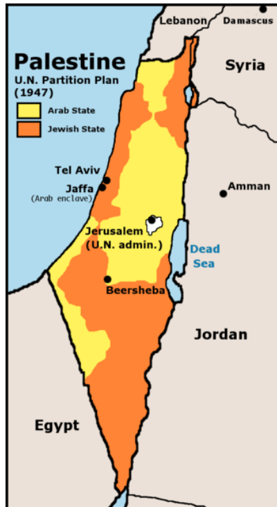
The UN Partition Plan for Palestine according to Resolution 181

contrast, thought that the territory allocated to the future Jewish state was too small, but on a more profound level he resisted the very notion that the borders of the Jewish state would be determined by committees and diplomats; wherever Jews settle, he maintained, there the Jewish state shall be. For him, a sovereign Jewish state was premature; first, the Jewish people had to be transformed and acquire a completely new way of being, which could take generations. Both Ya'ari and Tabenkin, who were visionaries rather than politicians, realized that the Jewish state would not be commensurate with their utopian dreams. Both also realized, perhaps, that once their kibbutz kingdoms were subordinate to a sovereign state, they might not be able to run them entirely as they saw fit.