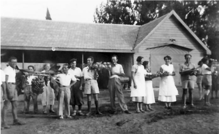
“First Harvest” procession in Gan Shmuel, circa 1935.

These were moments when your individual self was swallowed by a greater sense of a collective self, a collective self that is also better and more just and more beautiful than anything else [...] These were mere moments, but they were wonderful moments. Since then, I cannot sing or dance with other people because it is such a pale imitation of the ecstatic experience of those days. [...] It wasn’t only togetherness but a togetherness in which all promises of a life of substance suddenly came true. 67