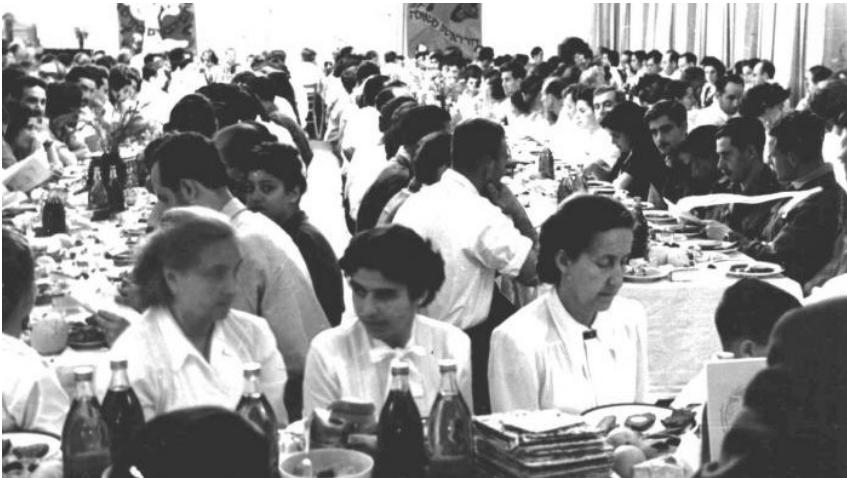
Passover seder in Gan Shmuel, 1947.

To that end, hundreds of new songs were written, classical Jewish texts were adapted, and elaborate choreographies were created. The festival of Shavuot, for example, which for a very long time was an unremarkable holiday marking the passage of seven weeks since Passover, and which was also loosely associated with the giving of the Torah, was revived in the kibbutzim by putting heavy emphasis on biblical facets of this holiday that were mostly ignored in the Jewish tradition: reaping and gathering the first fruits. This festival culminated in the kibbutzim in a procession of all the year's first fruits, carried by the members who cultivated each crop, and with a dance of the kibbutz's young maidens wearing white dresses and carrying sheaves of wheat. The first fruits would be given to a representative of the Jewish National Foundation who would exchange the kibbutz's produce for a sum of money—replicating the delivery of first fruits to the Jerusalem Temple in ancient times.