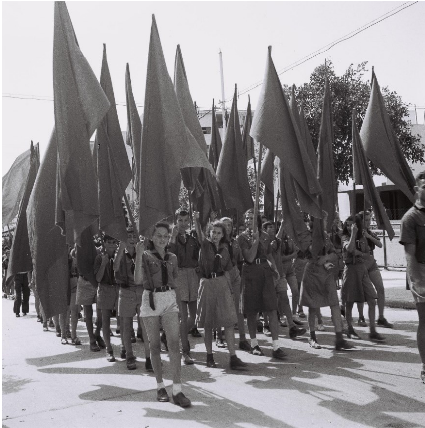
HaShomer HaTza'ir youth movement with red flags on the May 1 parade, 1946.

In the late 1940s and early 1950s, there was unprecedented infatuation with the Soviet Union in many of the kibbutzim. Lenin's and Stalin's portraits, hanging side by side, decorated dining rooms and classrooms and quotes from both of them punctuated speeches, lectures, pamphlets, and school lesson plans. As one kibbutz member put it, "If they'd wake me at 2 a.m., the first words to come out of my mouth would be, 'An-inseparable-part-of-the-world-of-revolution-with-the-Soviet-Union-at-the-head.'" 96 Some teachers in the kibbutzim of HaShomer HaTza'ir even modified the educational curriculum in keeping with Soviet scientific doctrines, such as Pyotr Kropotkin's counter-Darwinian theory of "spontaneous solidarity" of all living creatures and Trofim Lysenko's theory that traits acquired during an organism's lifetime can be genetically passed on to the next generations.