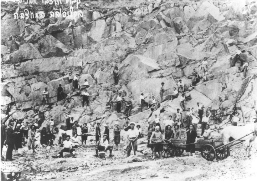
The Quarrymen Kibbutz at Klosova, 1930.

Keinemland , that is, “nothingland.” A coordinator of HeHalutz HaTza’ir who came to visit Klosova recorded his impressions with a mixture of horror and admiration; the trainees appeared to him as “torn rags covered in mud [...] slowly they morph into human beings, entangled like a coil; out of this coil emanates, as it were, a muffled growl. Day and night this coil whirls endlessly.” 59 Leaders of the kibbutz movements from Palestine who visited Klosova and the likes of it were often quite appalled, saying that this was a gross misinterpretation of the kibbutz idea; the kibbutz is a framework intended to benefit and uplift humans, they said, whereas some of the training farms in Poland seemed to be engaging in cruelty for cruelty’s sake. Nevertheless, those who survived the ordeal and eventually immigrated to Palestine cherished their time in Klosova as a brutal but exhilarating experience that prepared them to withstand any difficulty they ever encountered in their later lives as kibbutz members.