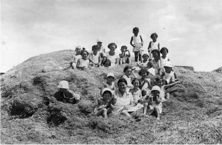
Children in Tel Yosef, circa 1930.