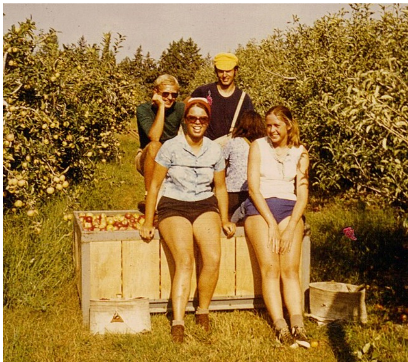
Austrian volunteers in kibbutz Ein HaShofet, 1973.

actively encourage volunteer work. After 1967, however, the interest on both sides grew tremendously. The kibbutzim felt a dire shortage of working hands, especially since the Six-Day War, the War of Attrition that followed it, and the Yom Kippur War in 1973 engaged the younger men of the kibbutzim in active military service much of the time. The prospect of bolstering the workforce without dirtying the kibbutz's hands with exploitative hired labor was compelling. The hype around Israel following the 1967 war, combined with the sixties' spirit of seeking love and justice and freedom, made the kibbutz seem like a utopia on earth to idealistic young people abroad. Richard Mühlrad, who founded the organization SVEKIV (short for Svenska kibbutzvänner —"Swedish friends of the kibbutz"), mentioned that in the 1970s, the number of volunteers was so high that it was a real challenge to place them all in kibbutzim: "The supply was greater than the demand. I remember times, especially in January when the number of volunteers was at its height, when we had to drive around from kibbutz to kibbutz asking, 'Take one, two, three, four, please.'" 14