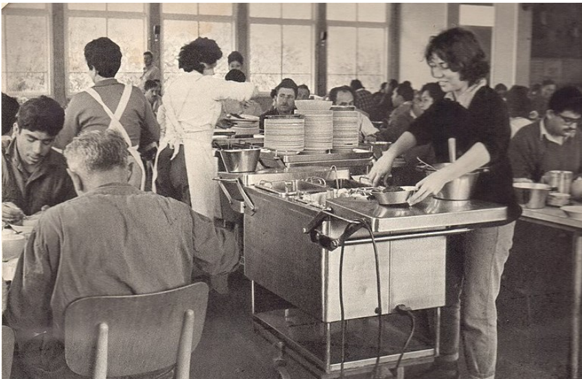
Communal dining hall in kibbutz Sha'ar HaAmakim, early 1960s.

The rules pertained not only to the allocation of goods but also to the orchestration and function of all the services in the kibbutz. How many times a month can members have their sheets washed? How many times can they have their clothes washed? On which day of the week should one bring dirty laundry to be washed, and on which day of the week should one collect clean laundry? How many people should be working in the dining hall at a time? What food items should members be allowed to take for themselves and what food items should be dispensed by the dining hall workers? Should members be allowed to take food into their rooms, and if so, what food? Should members fill a table or should they be able to sit wherever they want? What newspapers and magazines should be made available to the members? How long should each member be allowed to spend with a magazine before handing it over to the next member?