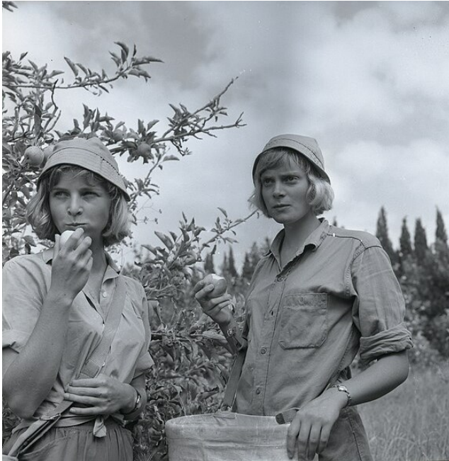
Volunteers from Denmark in kibbutz Dafna, 1964.

proud and victorious little state, a David to the world's Goliath, and came to spend a few months in the coolest thing that state had invented, the kibbutz. Room and board were included, and work was not all that hard; volunteers were mostly given simple and monotonous factory or farming jobs for four or five hours a day at most, after which they were free to do as they wished. There were swimming pools and vast, green lawns, it was almost always sunny, and the stringent rules of communality and austerity were not imposed on the volunteers who came as admiring guests rather than as aspiring members. Almost half a million volunteers worked in various kibbutzim between 1967 and 1990, among them household names such as Senator Bernie Sanders, photographer Annie Leibovitz, comedian Jerry Seinfeld, actress Helen Mirren, British Prime Minister Boris Johnson, and actor Sacha Baron Cohen.