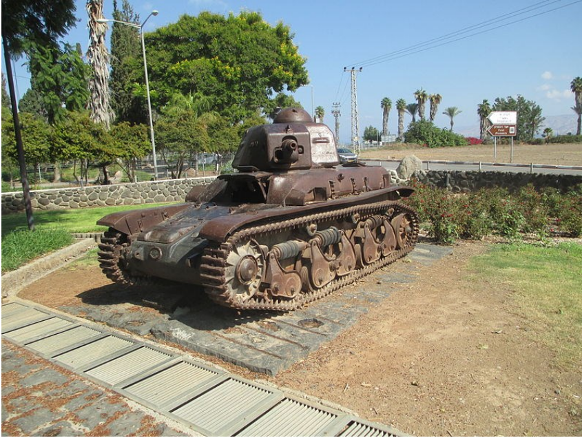
The Syrian tank at the entrance to Degania.