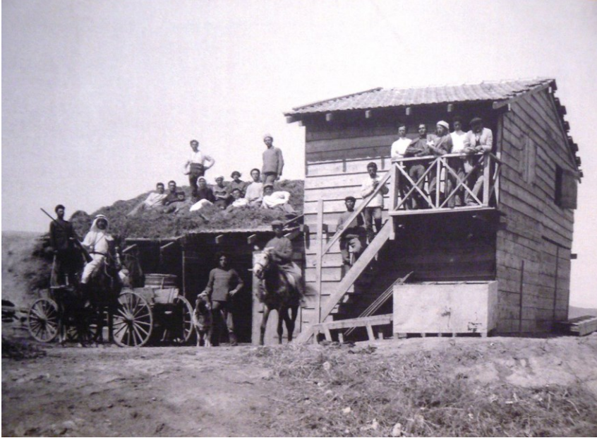
Degania's founders in Umm Juni, 1910.

The firm, warm, solid today; To imbibe this day, the short, the one, Upon our earth right here. 15