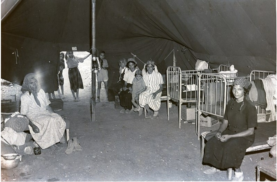
A transition camp ( ma'abarah ) in 1950.

well as someone to help them acculturate to their new country. Wasn't this a perfect match?