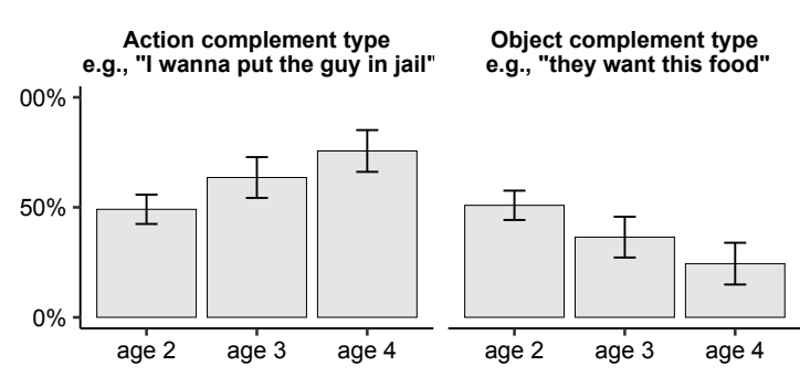
Figure 2 . Percentages of children's want utterances where the semantic type of the complement is either an action or an object, i.e., is a non-clausal, nominal complement.