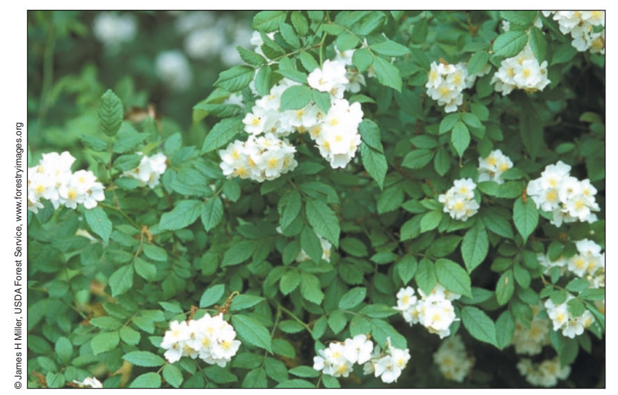
Figure 1. Rambler rose (Rosa multiflora) was introduced into eastern North America in the 19th century for horticultural reasons and subsequently used in highway plantings and for erosion control. More recently, it has been recognized as a serious and widespread invasive species. Given its origins and a preference for the disturbed habitats that result from human activity, is it really an "enemy"?

by attending to these we are better able to understand how particular metaphors engender certain ways of conceptualizing a situation, often by blinding us to alternative ways of relating to them and acting (Schön 1993). Militaristic metaphors harbor inaccuracies that contribute to public misunderstanding of invasive species and even to misperception by conservationists themselves. These metaphors also invoke militaristic ways of thinking that are inconsis-