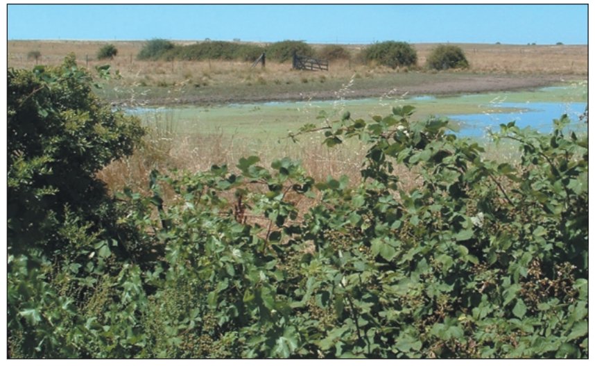
Figure 4. Himalayan blackberry (Rubus discolor) patches, in the foreground and background here, provide important nesting habitat for the tricolored blackbird, a rapidly declining species endemic to the Central Valley of California (Cook and Toft 2005).

lic" – individuals who are actively involved in resource management decisions – preferred that ecologists help to integrate their knowledge into management rather than to advocate for particular decisions (Lach et al. 2003). Even though the benefits of conservation advocacy are heavily disputed, the language of war, even if implicit, reveals a