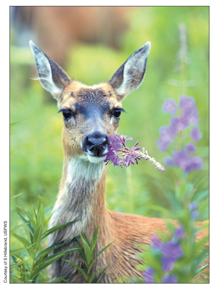
Figure 5. Sitka black-tailed deer (Odocoileus hemionus sitkensis) were introduced to Haida Gwaii (also known as the Queen Charlotte Islands, located off of the coast of central British Columbia) early in the 20th century, with subsequent devastating impact on native vegetation. Given such dramatic evidence of the effect of this invasive species, many people wish to eradicate them from the islands. Others oppose such action on ethical and pragmatic grounds, especially since the deer have become an important food source for many of the Haida people.

zealous commitment to a particular plan of action. It may cause those most committed to conservation to have doubts about the invasion biologists' intentions.