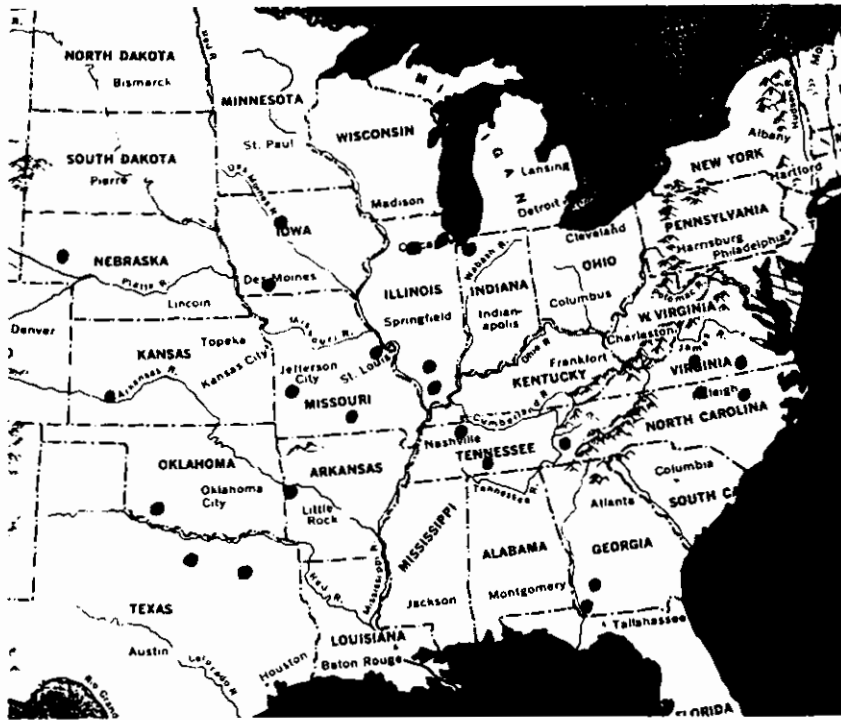
Fig. 1. Twenty-nine cities responding to the 1981 Urban Blackbird Roost Survey.