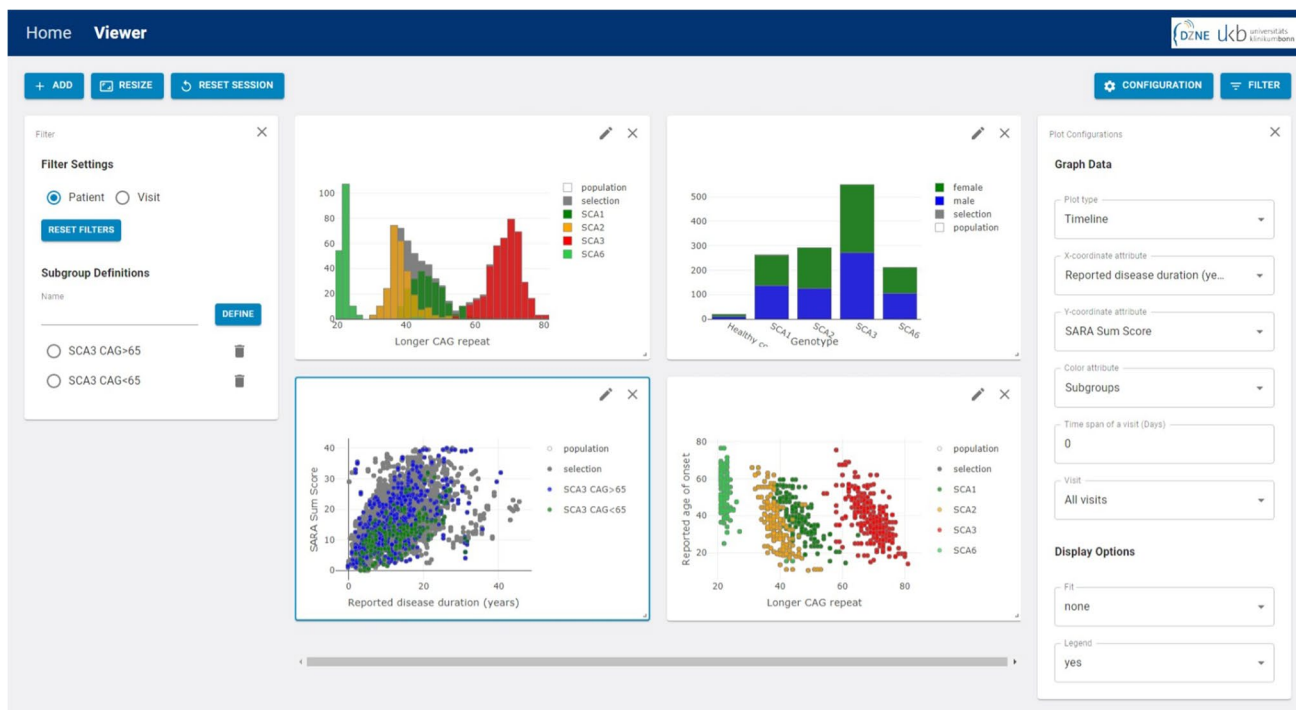
Fig. 1 Example Screenshot of SCAview. On the left side one can see the filter-setting window, in the middle section, four examples for the different plot types available are depicted and on the right side the configuration window for the actual plot is displayed (here left bottom scatter plot, marked with a blue outline). The plot in the upper left corner shows a histogram of the CAG length of the longer allele with the genotype as additional color-coded attribute. The right upper corner shows a bar plot of each genotype with sex as color-coded addi-

In the beginning, the complete data set is depicted. According to the graphical handling of data processing, subgroups can be defined via a selection tool in any graph. For example, if a clinical scientist is only interested in SCA3 mutation carriers with more than 65 CAGs in the longer allele,