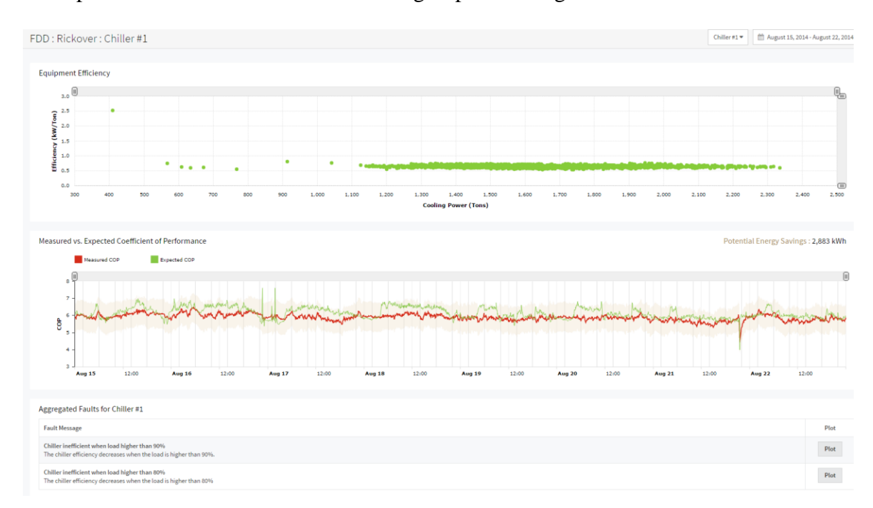
Figure 4. Screen shot of the fault detection and diagnostic features in the PlantInsight tool.

Figure 4 shows the fault detection and diagnostic features in the tool. In the upper plot, the chiller efficiency curve is plotted with kW/ton on the y-axis, and cooling tons on the x-axis. In the bottom plot, a time series of detected efficiency faults is provided. A time series of the measured coefficient of performance (COP) is overlaid with the model-predicted COP; when the two values diverge beyond a threshold size and probability, a fault is detected. Diagnostic fault aggregation to group faults instances based similarity of conditions is summarized in the lower right hand portion of the plot. Please refer to the section FDD and Optimization Algorithms for further description on how faults are detected and grouped for diagnosis.