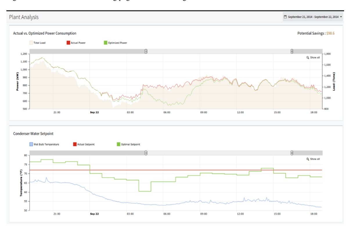
Figure 3. Screen shot of the condenser water temperature setpoint optimization features in the PlantInsight tool.