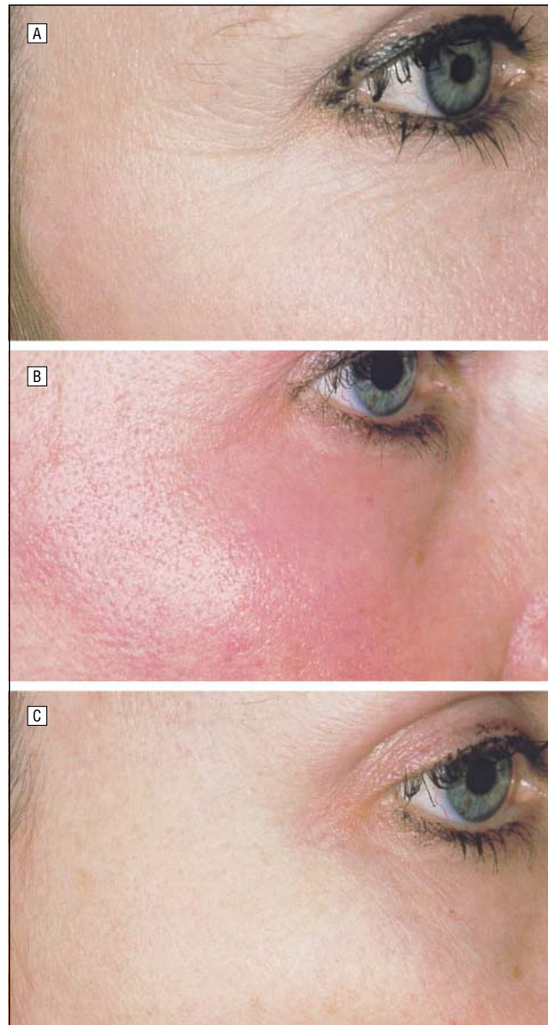
Figure 2. A 42-year-old woman with periorbital rhytides before treatment (A), immediately after nonablative skin rejuvenation using a 1.32- \mu m Nd:YAG laser in conjunction with cryogen spray cooling (B), and 6 weeks after nonablative laser skin resurfacing (C).

Laser Aesthetics (Auburn, Calif) developed a 1.32- \mu m Nd:YAG laser used in combination with CSC for nonablative skin rejuvenation. A multicenter study 21 evaluated periorbital rhytid improvement in 35 adults after 3 treat-