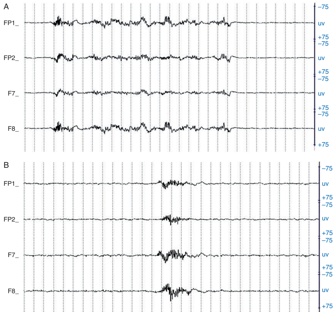
Fig 1 (A) Intraoperative EEG tracing for Stage E, which indicates >10 but <20 s of EEG suppression per 30 s epoch. The FP1 and F7 electrodes overlay the left, while FP2 and F8 overlay the right frontal head region. Sensitivity is measured in microvolts (uv). The space between two dotted lines equals 1 s, and one page represents a 30 s epoch. (B) Intraoperative EEG tracing for Stage F, which indicates >20 s of EEG suppression per 30 s epoch. Details as for (A).