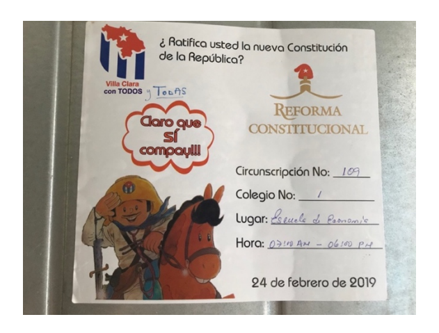
Figure 2. 2: Constitutional Reform: banner on a house's door