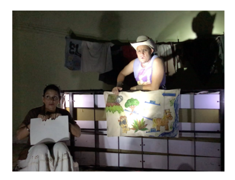
Figure 4. 7: El guajiro

Fifth story: The guajiro (peasant) tells the story of when he met an elder guajiro who taught him everything about the proper technique to seduce a mare. He proceeds to give a detailed and exhilarating account of how he got to succeed in his first amorous encounter with a mare following the guidance of the elder guajiro.