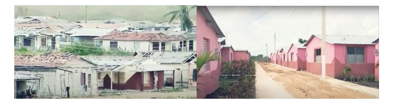
Figure 4. 11: The houses of Emilio Cordoba before and after the hurricane

The houses of Emilio Cordoba in the aftermath of the hurricane and after the reconstruction.