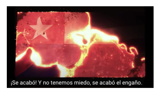
Figure 6. 6: Cuba's flag burning (music video Patria y Vida)

Stop the bloodshed For wanting to think differently Who told you that Cuba is yours? If my Cuba belongs to all my people