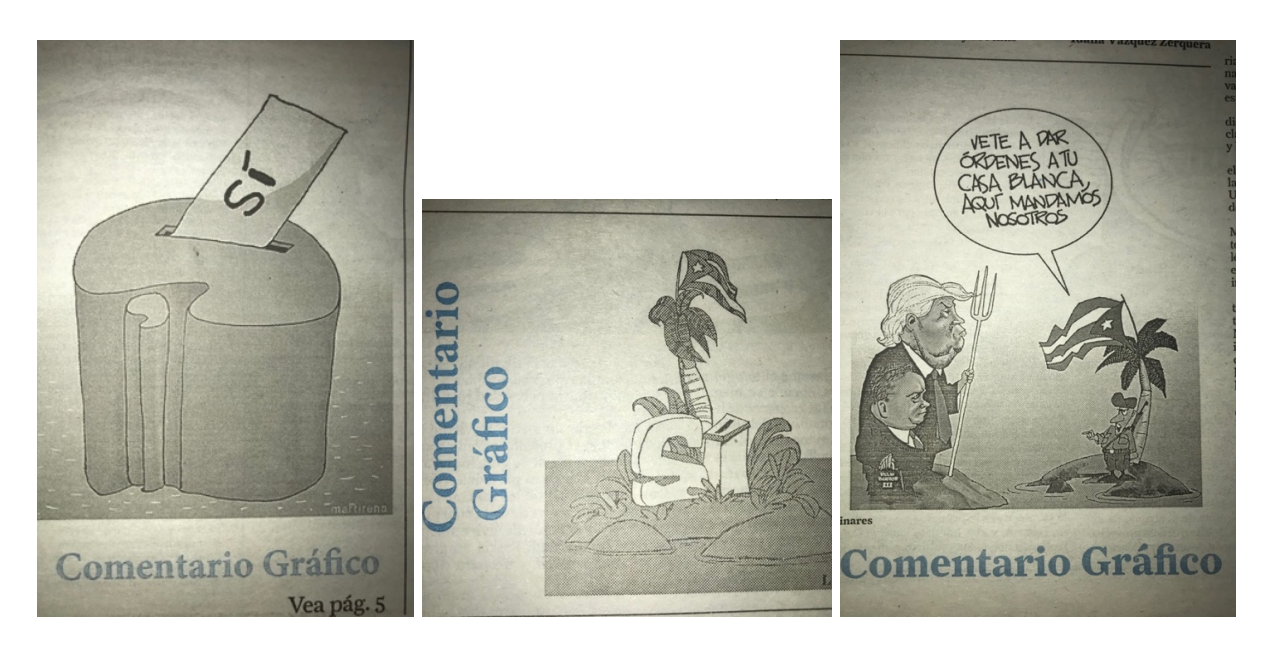
Figure 2. 3: Vanguardia's visual commentaries

These visual commentaries were published on Vanguardia, the newspaper of the Provincial Committee of the Communist Party in Villa Clara. The image on the left, published in early February 2019, is representative of the government campaign to promoting the approval of the New Constitution during the National Referendum on the 24th of February 2019. The image in the middle portrays the referendum's result. The constitution was approved by an 80% of the population, with 10% of NO and a 10% of abstentions. The last image on the right, was published during April 2019, while the new socialist constitution was entering into validity while Donald Trump reactivated the Helms-Burton Act, Title III. The latter allows for Cuban Americans and US citizens claiming to have lost their assets on Cuba after Fidel Castro's Revolution to bring before federal courts the foreign companies that operate on the properties confiscated from them on the island. The reactivation of the Helms-Burton Act, Title III was one among many of Trump's foreign policies tailored at increasing the economic embargo place on the Island, as part of his punitive measures against it for allegedly providing military aid to President Maduro in Venezuela (its socialist allay).