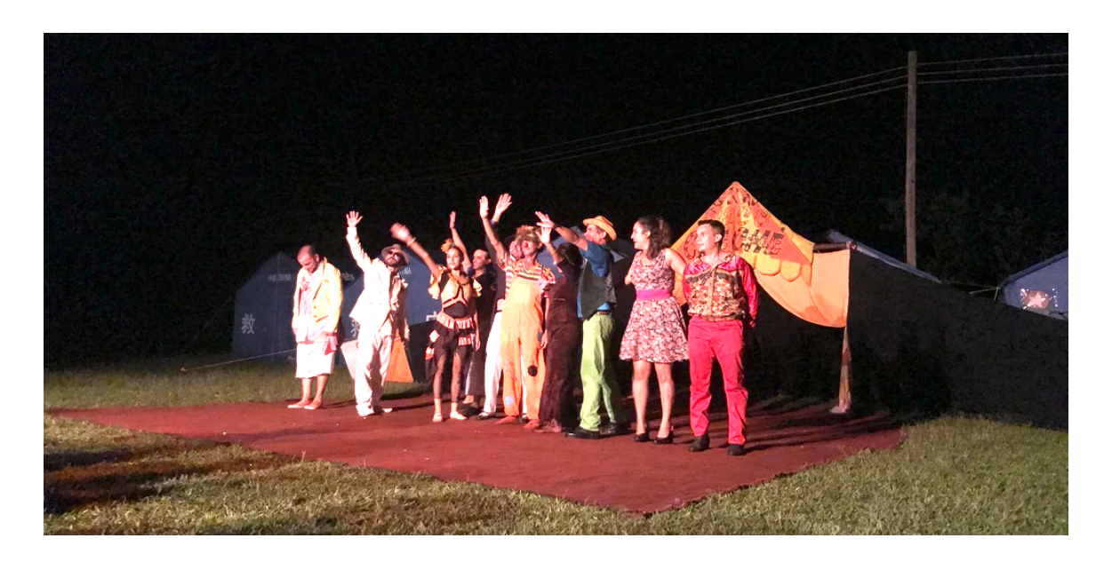
Figure 3. 1: Silverio's tents

Play Juan Quínquín, Taguayabon, August 2019.