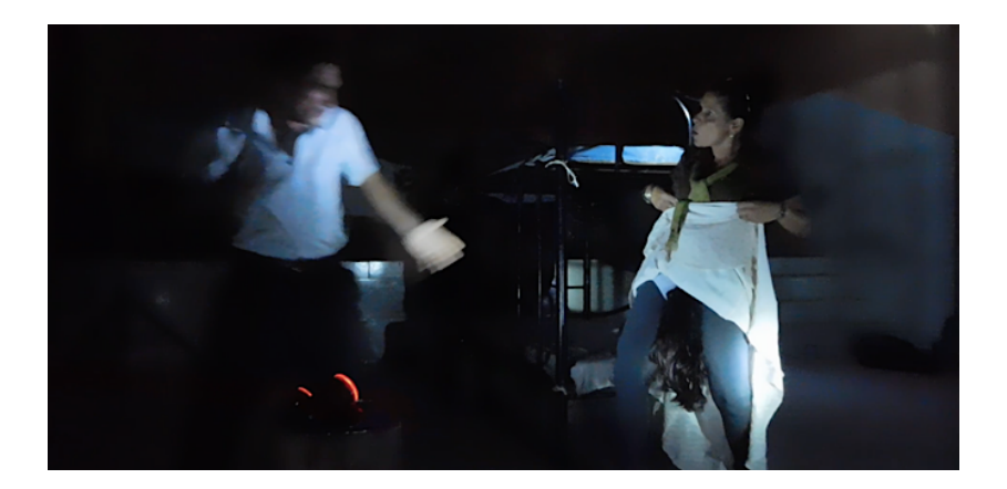
Figure 4. 3: The old widow and the banker

First Story: A reputable and respectable old widow, who sits every day at the window of her house, tries to seduce a compañero who works in the bank and passes every day in front of her house. She convinces him to enter her home with the excuse to help her in searching for a hidden frog. While the man is searching for the imaginary frog, she displays an array of seductive moves. The story reaches its climax when the lady raises her gown showing an extremely hairy pussy. The story closes with the lady confessing to a priest justifying her 'indecency' with the shortages and lack of money to buy underwear. The priest gives her the money to buy underwear... and he adds "a razor! (...) if you can find it!"