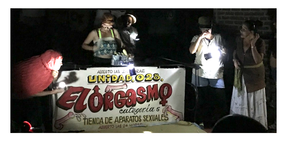
Figure 4. 4: The vendor

bought an infinitude of things: cars, furniture, sweaters and every type of cloths. Finally, she saw a hidden shop. She got closer to discover that the shop sold pingas (dicks), thousands of pingas! She thought to herself: "How is it that in Russia they sell phalluses and in my shop I do not?" She entered that Russian shop and asked for 50 boxes of pingas. She returned back home and changed the name of her own shop into: "Orgasm, Category-5!" She was even able to pass the harsh controls at the Cuban customs by bribing the customer officer with a gift in pingas. She returned back with phalluses of all types and colors and her shop was invaded by a variety of interested buyers: widows, singles, married couples, and a lot of pajaritas.