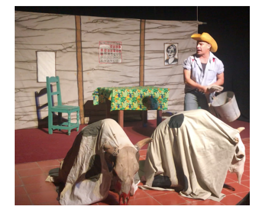
Figure 3. 5: Las cabañuelas

The Theatre Company of El Mejunje performing Las Cabañuelas in la Sala Margarita Casallas.