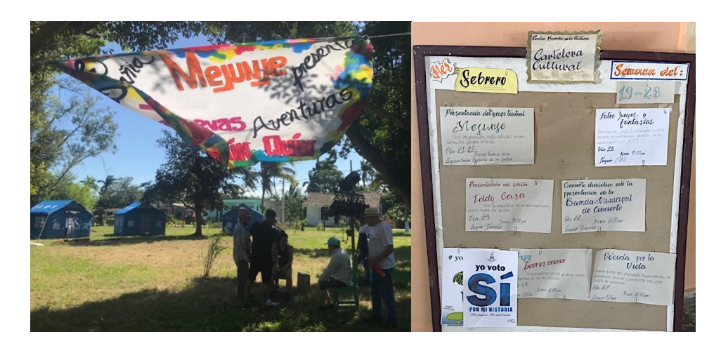
Figure 4. 14: Silverio's tents in Emilio Cordoba

The Concoction bringing two days of performances to Emilio Cordoba in February 2018 as part of the project Silverio's tents