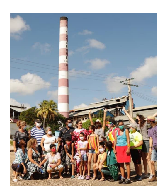
Figure 6. 3: Concierto OnLand and Art in the village

On the left, members of La Trovuntivitis helping in the labor of cultivation. On the right, the youngest group of Santa Clara's artists after their performance in one of the villages of the Province of Santa Clara. Photos published on Facebook.