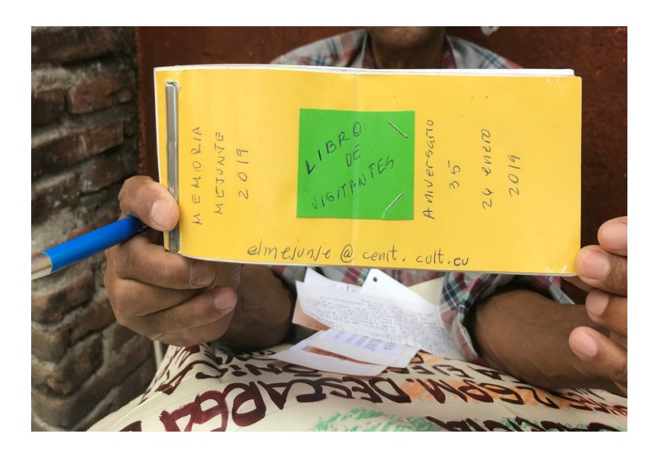
Figure 1. 5: The book of Concoction's visitors