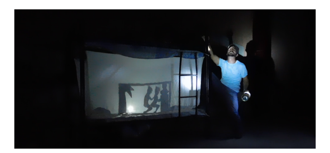
Figure 4. 6: El macho

Fourth story: Macho tells the story of how, during the Special Period, to face the economic difficulties of the times he became a renowned jinetero :<sup>71</sup> El macho morrongón<sup>72</sup>. He recounts that he became famous for his big morronga (penis) among females, males, and a lot of pajaritas. One night he sold his sexual favors even to a blond American tourist. He gave him such a huge orgasm that is still remembered as the second greatest defeat of Imperialist powers in Cuba after the Revolution.