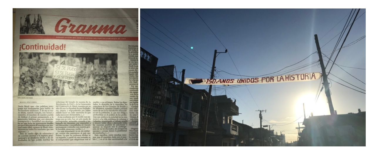
Figure 2. 1: Continuidad! 150 years united for history

As Cubans voted for a New Constitution reasserting the socialist orientation of the country, they also experienced an intensification of "arrhythmic endless waiting" (Verdery 1996, 47) for many goods and services exposing the contradictions of the State's project of national sovereignty and egalitarian distribution. The beginning of 2019 was marked by an acute balance of payments crises, which affected the link with Cuba's main trading partners resulting in recurrent shortages of all kinds (from flour, to oil and chicken, to toothpaste, to antibiotics, to fuel). Cuba moved from one energetic dependency to another: form reliance on the USSR to reliance on Hugo Chavez's Bolivarian Socialist Venezuela. With the crises in Venezuela, oil shipments to Cuba began diminishing consistently and then dramatically dropped in 2019. Two of Cuba's main export industries (sugar and nickel) were negatively affected by setbacks in productivity and a decline in the world market prices. Moreover, the Island was severely affected by the aggressive policies of Donald Trump, who strengthened the embargo, severely limited remittances, forbid touristic travel from the USA to Cuba, and reactivated the Helms-Burton Act preventing foreign investments on the Island. Finally, the election of Bolsonaro in Brazil led to the end of Cuba-Brazilian cooperation (Torres Perez and Brundenius 2020, 178-179).