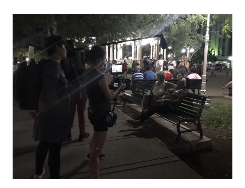
Figure 5. 3: Shooting the documentary at Parque Vidal

We walked together towards Parque Vidal at sunset. Birds were flying into the central square, marking with their songs the refrain of the end of the day. The dark cloud enveloping Esperanza started dissipating as we became immersed in that new soundscape. Esperanza and Maga sit on one of the benches of Parque Vidal, eating an ice cream. It had been difficult for Esperanza and Maga during that year to enjoy moments like this, sitting freely in the central square listening to the music of birds followed by Santa Clara's band. When the band started playing, after sunset, Sol felt the moment had come to start shooting again.