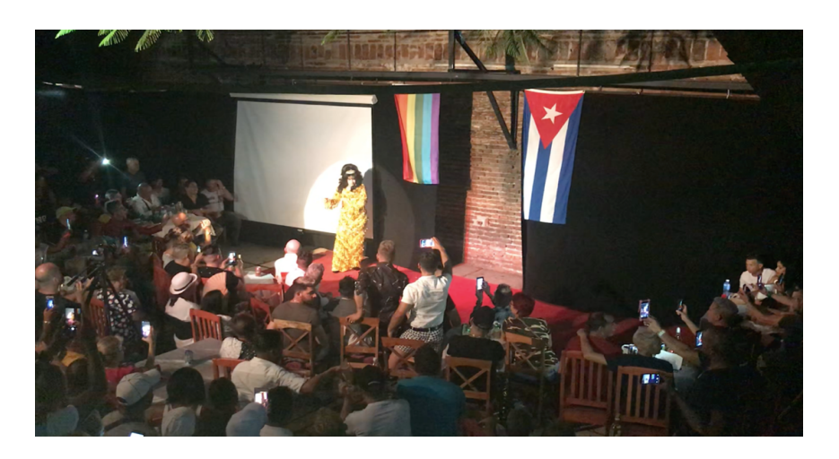
Figure 3. 4: Transformistas' show in the patio of the Concoction