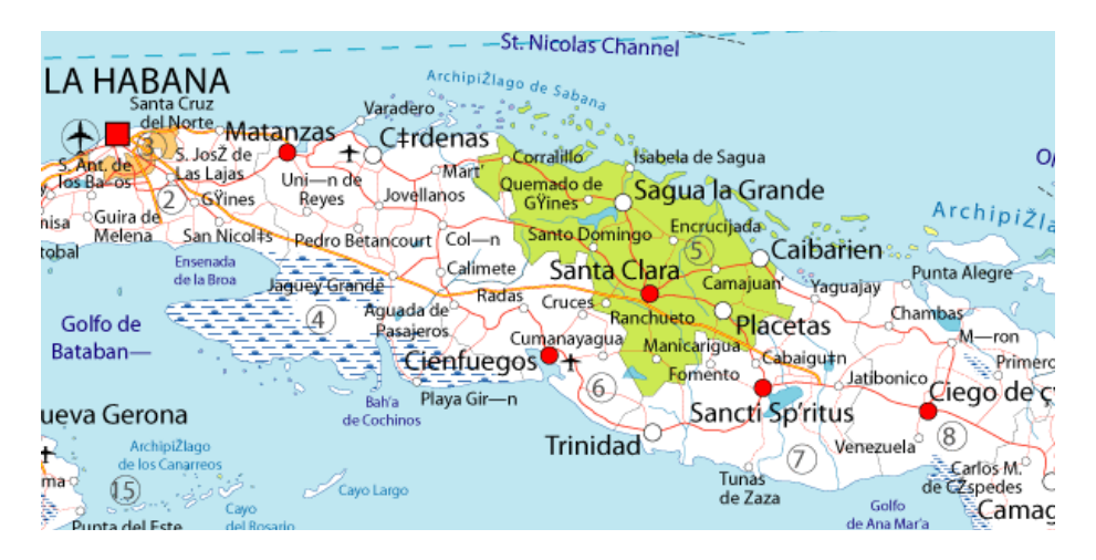
Figure 1. 1: Map of Santa Clara in Cuba

Parque Vidal, the central square of the city, is the site for the daily encounter of elders, youth, and children. The square hosts frequent concerts at night and other cultural activities for kids during the day. Trovadores and rappers often gather in the square to improvise performances. The square also hosts hundreds of birds that sleep on the trees of Parque Vidal. They leave at dawn for the countryside and return at sunset while delivering the most incredible polyphonic refrains. The Concoction is a few blocks away from Parque Vidal. With time, it has come to be recognized as the second main attraction of the city after the Mausoleum of Ernesto Che Guevara.