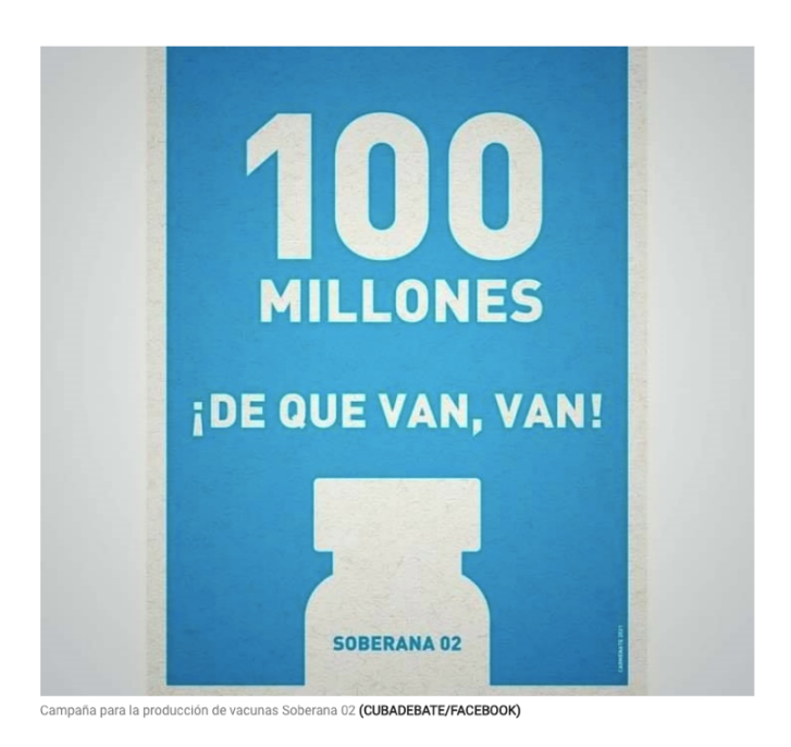
Figure 6. 4: Covid-19 vaccine campaign

in the population's sense of citizenship by solidifying or undermining their feelings of national identity. Rather than being mere 'scientifical' tools, vaccines hold high political value condensing a series of powerful imaginaries bound to modern governmentality, such as a state that cares for the health of its population. Cuba is the only country in Latin American and the Caribbean, and the smallest country worldwide, that produced two successful national vaccine candidates for Covid-19: la Soberana 02 and Abdala. Miguel Diaz Canel emphasized since the beginning of the pandemic the importance of asserting "sovereignty" at this historical conjuncture through a State-run project of national vaccine production (Granma, October 21 2020<sup>104</sup>). This is reflected in the names given to the vaccines, Soberana , the Sovereign, and Abdala , which is a patriotic poem by Jose Marti dedicated to the homeland.