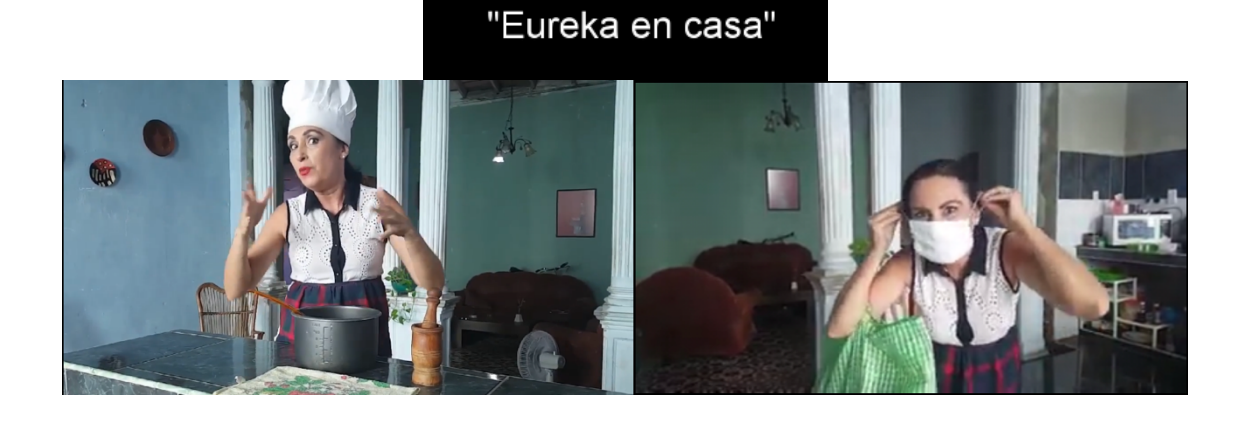
Figure 6. 2: Eureka at home

Pay attention, things done promptly and timely might still have a remedy!