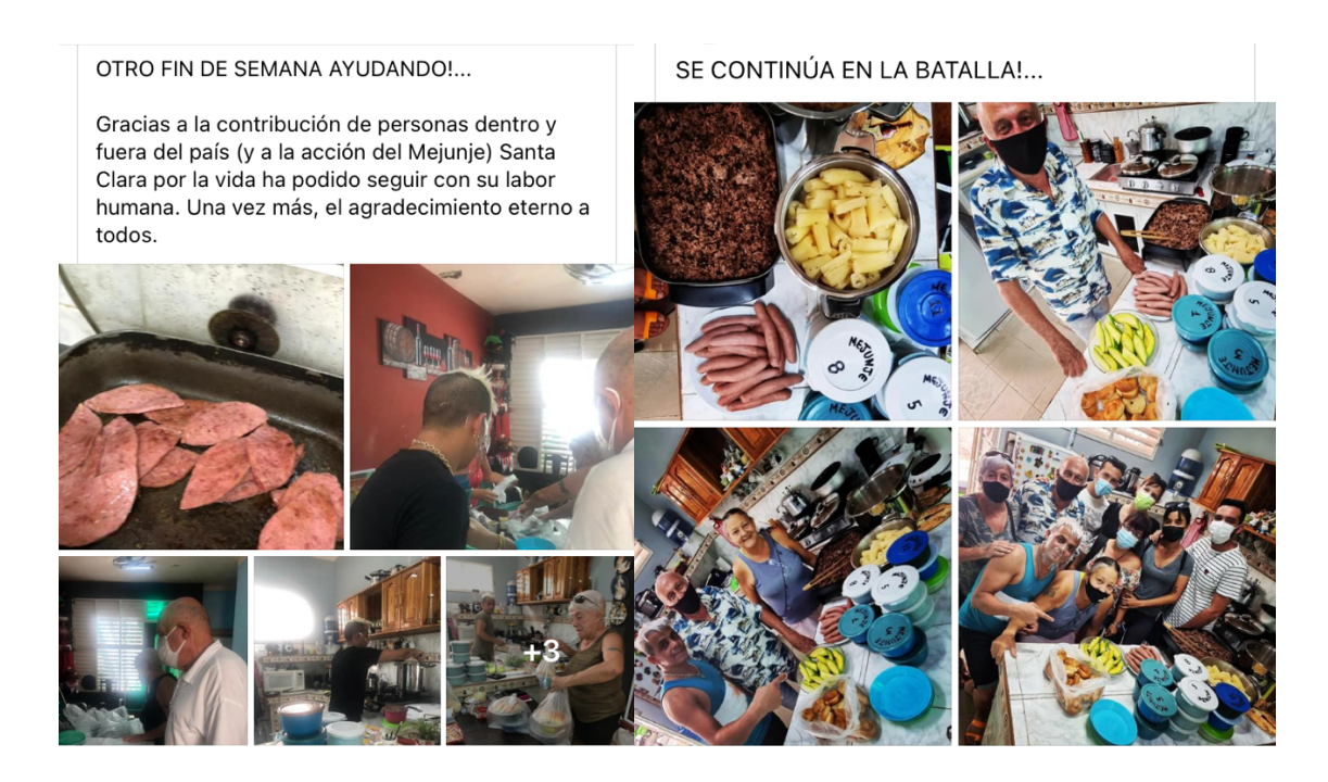
Figure 6. 10: Facebook's post on the activities of Santa Clara por la Vida

On the left, the group of Santa Clara's inhabitants, mainly youth, who participated in the initiative Adopta un abuelito . On the right, the banner promoting donations of medicines and toiletry products to be collected at the Concoction and distributed among those who needed it. (images circulated on Facebook)