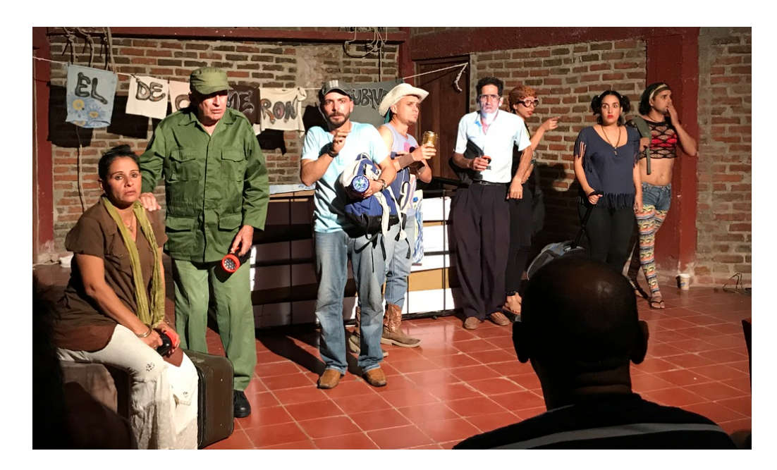
Figure 4. 8: The Finale