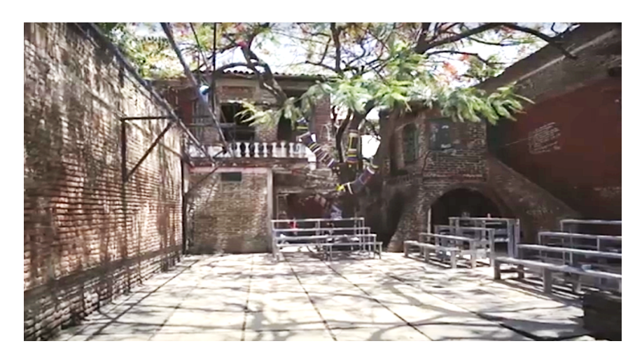
Figure 3. 3: The Concoction's patio

Silverio's Concoction was designed since its foundation as a cultural space to provide a home for all the marginals, promoting diversity and inclusions through the arts, particularly for those individuals and communities that had been previously excluded by the Revolutionary government. Transformistas and the LGBT community, rockers, critical intellectuals and writers found a home at The Concoction, together with groups of Cuban traditional music and trovadores (musicians of trova). At first, only a big open patio surrounded by the Oriental Hotel's ruins was transformed into a stage for the artistic performances and gatherings of the heterogenous group of artists.