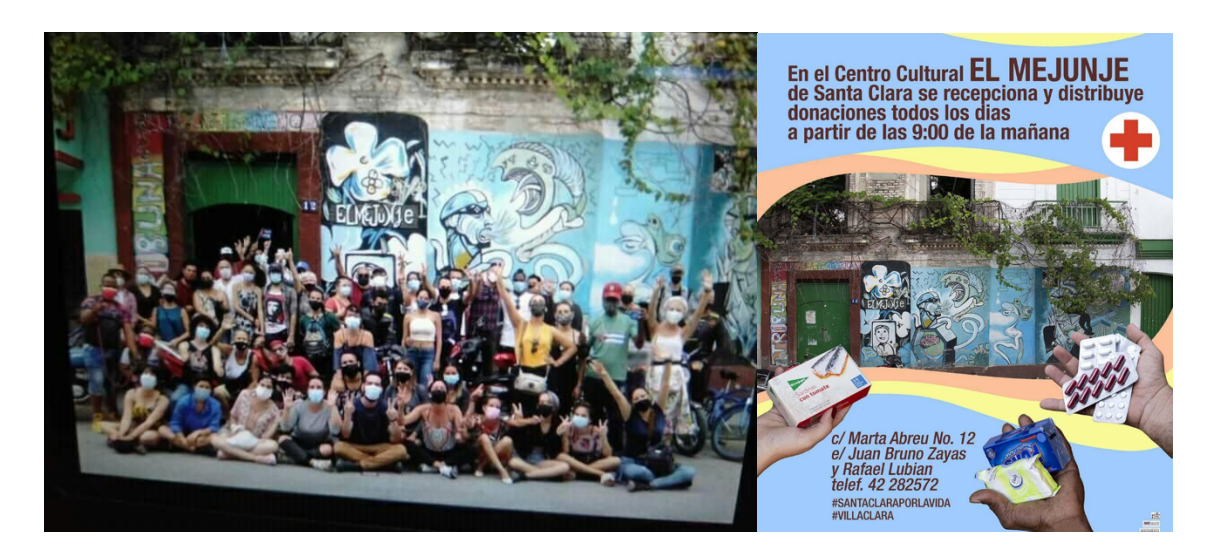
Figure 6. 9: Santa Clara por la vida

On the left, the group of Santa Clara's inhabitants, mainly youth, who participated in the initiative Adopta un abuelito . On the right, the banner promoting donations of medicines and toiletry products to be collected at the Concoction and distributed among those who needed it. (images circulated on Facebook)