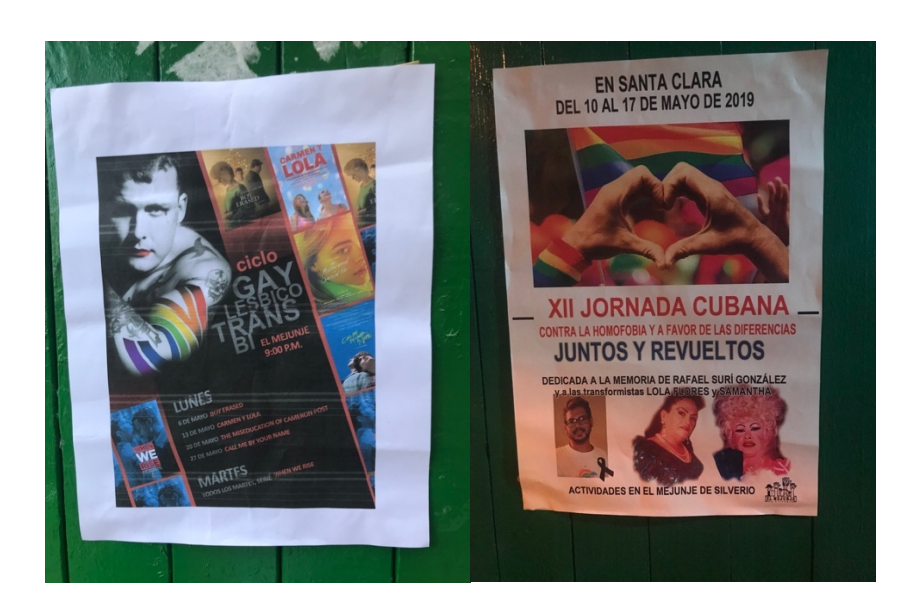
Figure 1. 4: Ciclo contra la homofobia

On the right the poster promoting the cycle against homophobia on the door of the Concoction. On the left the poster promoting the activities for the XII International day against homophobia on the 17th of May 2019. The latter is also the national day of el campesino (farmer).