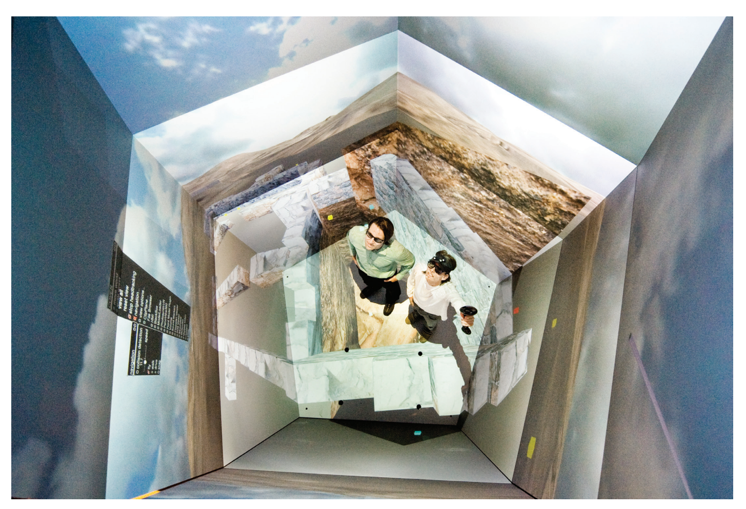
Figure 1. The StarCAVE at UC San Diego's Qualcomm Institute, showing the 360 degree, five-walled, fully immersive virtual reality system. This image shows the 3D model of the Iron Age copper smelting site Khirbat en-Nahas.

The StarCAVE is a 5-wall and floor-projected virtual reality system (Defanti et al. 2009). The 360-degree room has a diameter of about 3 m and a height of about 3.5 m. It uses 34 high defini-