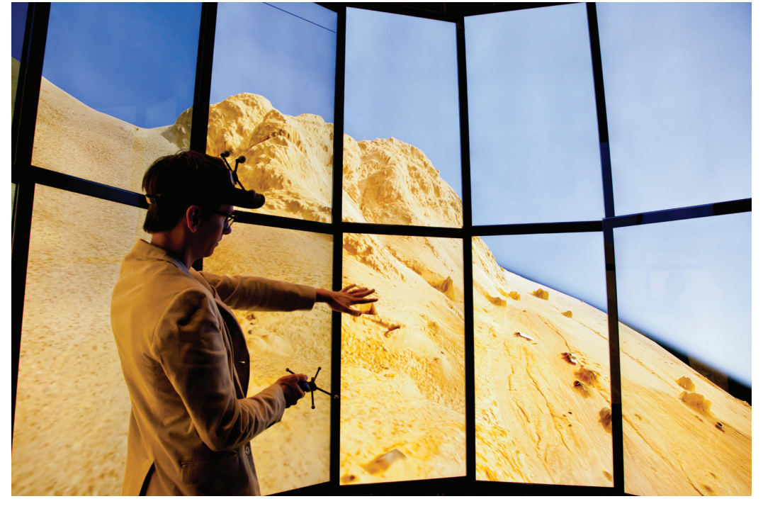
Figure 4. A model of the site Wadi Fidan 61 is demonstrated in this image of the TourCAVE. This model was created using Structure from Motion.

Among the many data types we display in the Tour-CAVE are point clouds, derived from LiDAR scans, Structure from Motion, and others. During the 2012 season of the Edom Lowlands Archaeology Project, LiDAR scans were carried out at the Byzantine church in Petra (fig. 3) and visualized in the TourCAVE. Unfortunately, with LiDAR scans there are