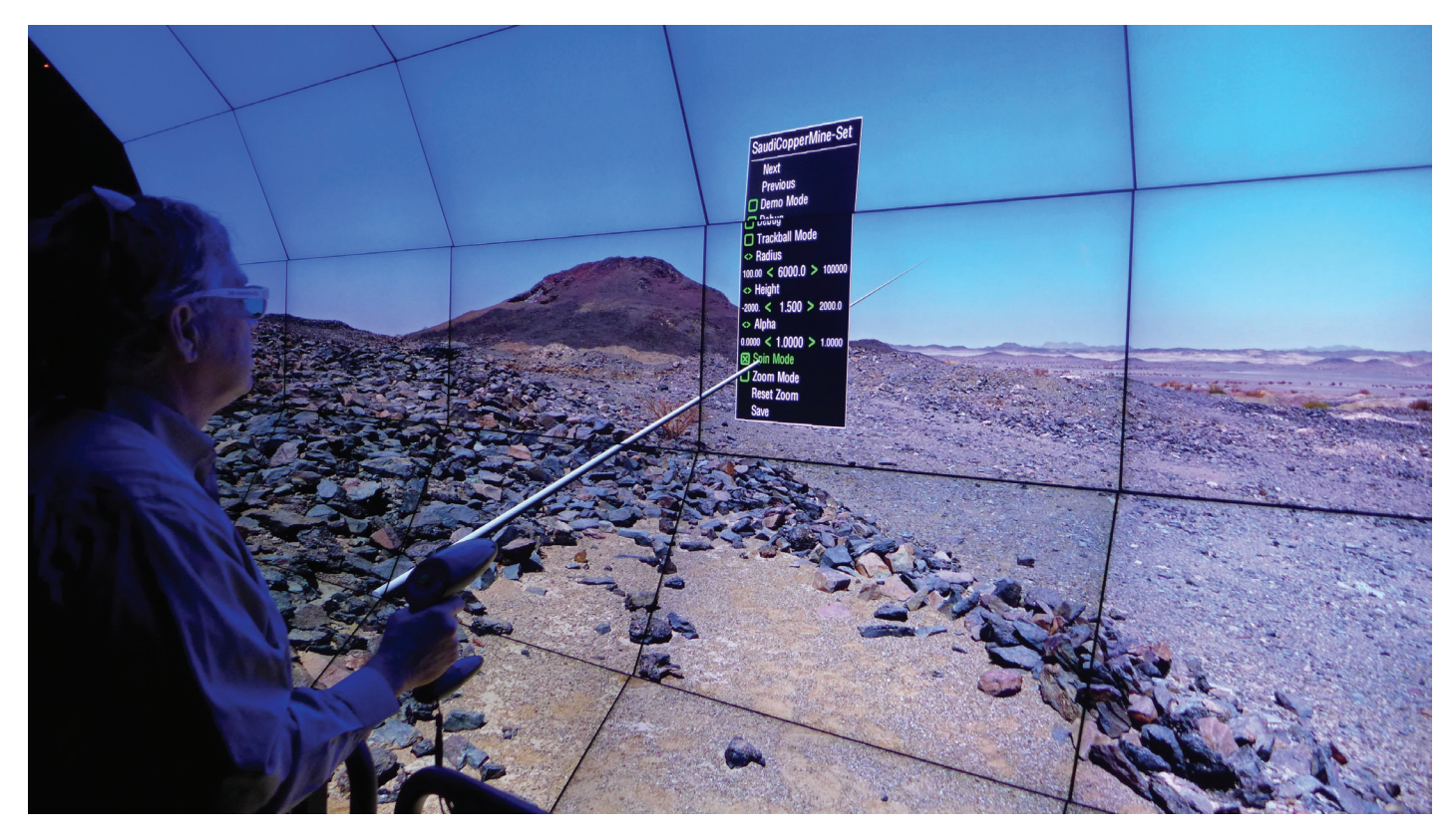
Figure 5. A copper mine in northwest Saudi Arabia viewed in the WAVE. This imagery was obtained with the CaveCam system.

cial facet of this type of research: interdisciplinary collaboration. We can only be successful in pushing the boundaries of cyber-archaeological research by sharing our ideas and resources through partnerships like the one we have established here in San Diego. Furthermore, the costs have consistently been going down to the point of soon becoming a commodity. The Oculus Rift, a headmounted VR device, is expected to enter the consumer market within less than a year's time, only slightly above the price of a computer monitor. VR input devices have already entered the consumer market, with the Razer Hydra, the Microsoft Kinect, and Leap Motion finger tracker and others, all well within the price range of other computer peripherals for the consumer market. We believe that the upcoming few years are going to make VR accessible to every computer user, including archaeologists, whether at home or in the field. This will open up an enormous realm of opportunities in the new discipline of cyber-archaeology.