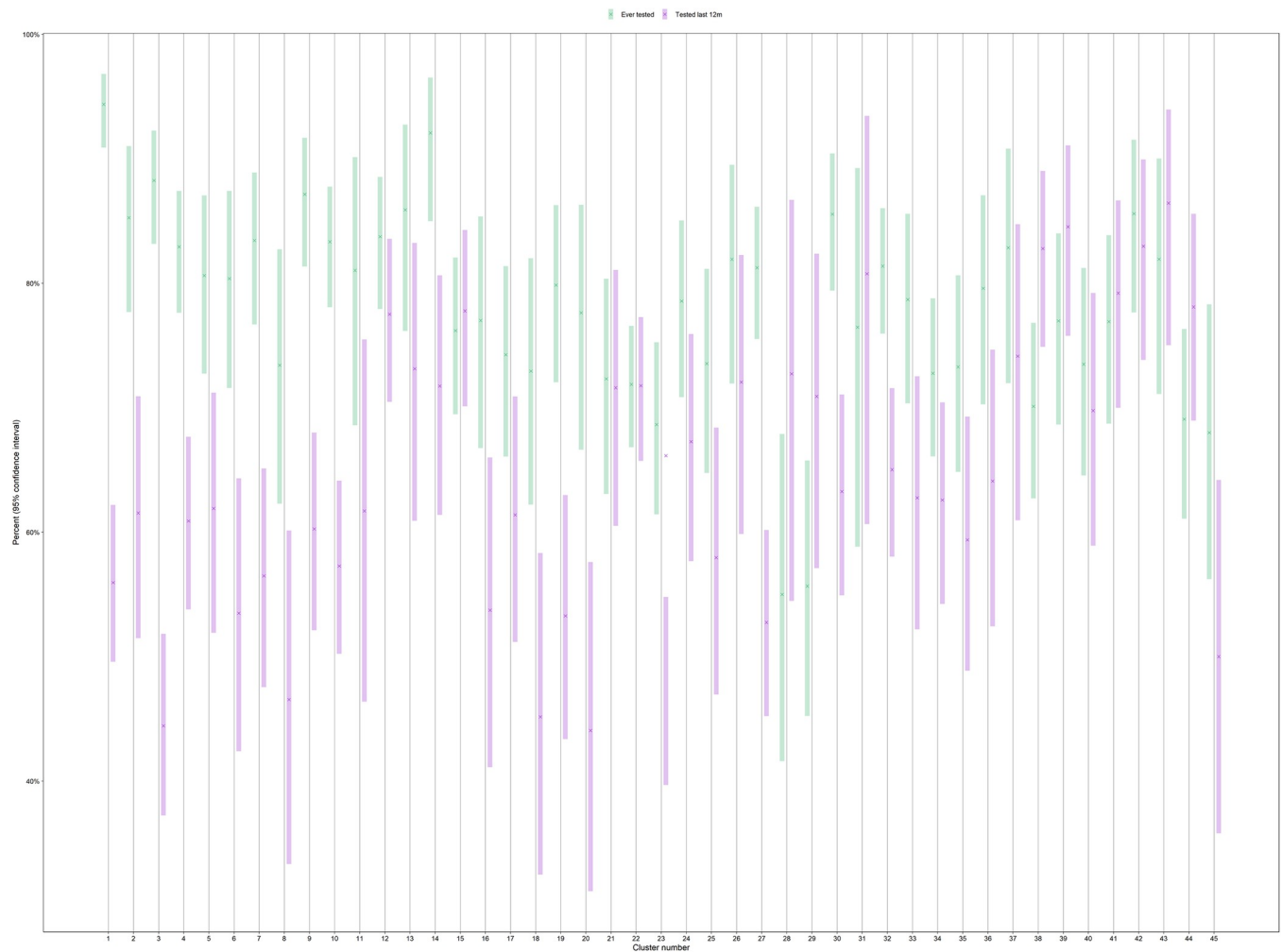
Fig 1. Variation in lifetime and recent HIV testing history.

https://doi.org/10.1371/journal.pntd.0010654.g001