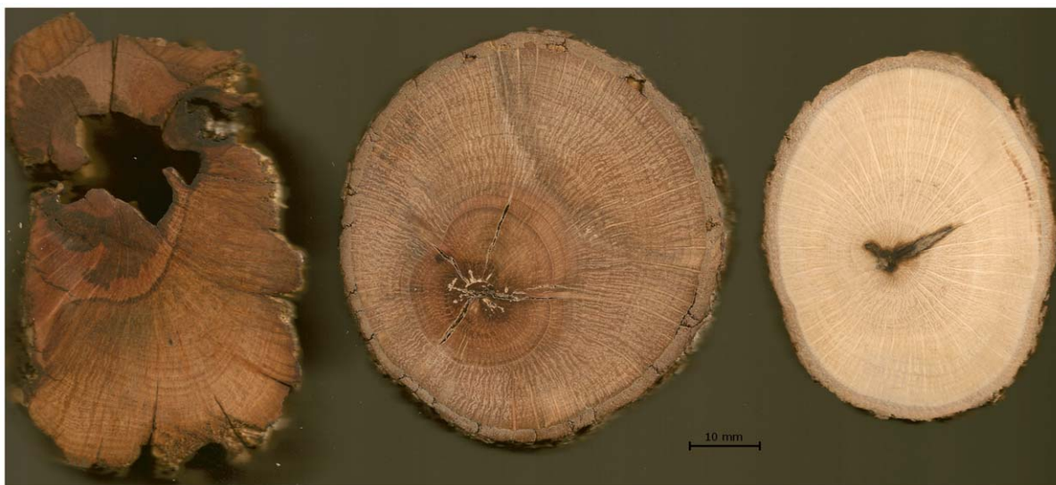
Figure 2. Cross-sections of Q. palmeri stems. Ring counts were made from high-resolution images of cross sections of each stem. Scale is in millimeters. Example stem sections, from left to right: Jurupa Mountains, Aguanga, Garner Valley. doi:10.1371/journal.pone.0008346.g002

If Q. palmeri at the Jurupa site represents a single asexually reproducing clone expanding only by secondary growth in stem thickness due to crown resprouting after fire, comparison of the diameter of the clone to measurements of annual growth provides a means of estimating the age of the clone. Making the conservative assumption that the progenitor individual originated at the center of the current Jurupa site, the clone must have grown at least 12.5 m (half the longest axis) in a single direction. We estimated the age of the clone under two different growth rate