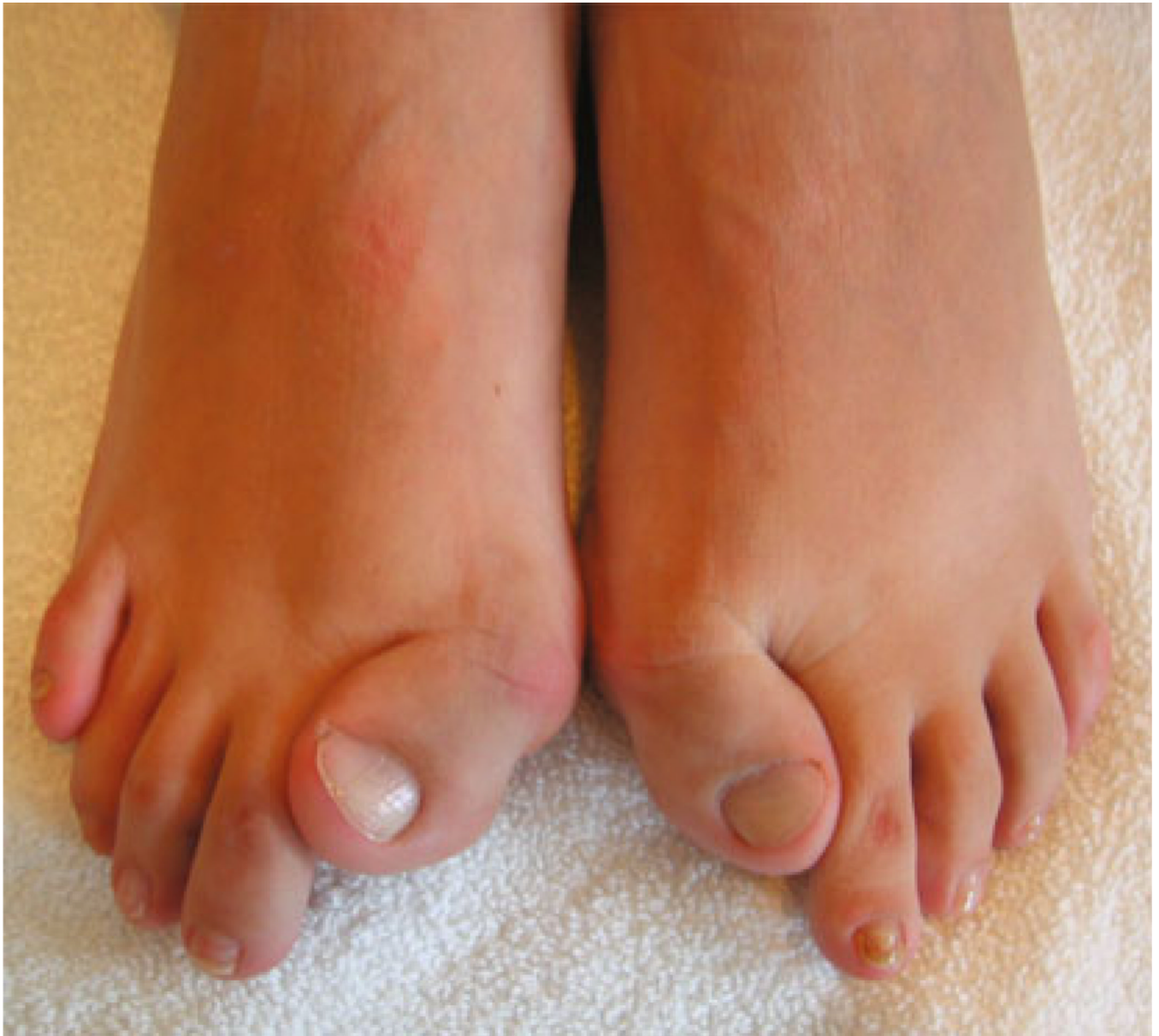
Fig. 1. Malformation of the great toes in an individual with fibrodysplasia ossificans progressiva (FOP). The great toes are short with hallux valgus