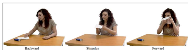
Figure 1: The images extracted from the video “Blow the nose” and presented to participants at encoding (Stimulus) and at test (Backward, Forward, Stimulus).

The material consisted of 10 videos from a previous study (Iani et al., 2021). Each video shows a single action performed by an actress with the upper limbs, either with one or two arms (e.g., eating a hamburger, drinking water from a glass). Each video was cut into three same-length parts; the middle frame of the second part was presented to the participants at encoding (stimulus photo). Two additional photos were extracted for each action video: the central frame of the first part (Backward photo) and the central frame of the third part (Forward photo). These photos were presented to the participants at test together with the photos presented at encoding. Figure 1 shows examples of the stimuli for the “Blow the nose” video.