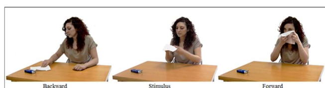
Figure 1: The images extracted from the video “Blow the nose” and presented to participants at encoding (Stimulus) and at test (Backward, Forward, Stimulus).

The material consisted of 10 videos from a previous study (Iani et al., 2021). Each video shows a single action performed by an actress with the upper limbs, either with one or two arms (e.g., eating a hamburger, drinking water from a glass). Each video was cut into three same-length parts; the middle frame of the second part was presented to the participants at encoding (stimulus photo). Two additional photos were extracted for each action video: the central frame of the first part (Backward photo) and the central frame of the third part (Forward photo). These photos were presented to the participants at test together with the photos presented at encoding. Figure 1 shows examples of the stimuli for the “Blow the nose” video.