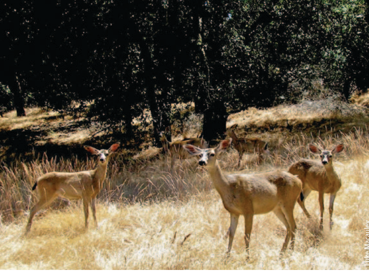
Deer graze in oak woodlands in Mendocino County. Nearly 40% of the private landowners surveyed hunted on their land. Hunting is believed to be an important component of private amenity income, although this study was not designed to subdivide such income into components.

We developed the contingent valuation question based on the assumption that oak woodland owners give up, or are willing to give up, potentially higher earnings from alternative investments in order to enjoy amenities from their land. The difference in commercial earnings from the landowners’ investments in their land and the best potential alternative investments they could hypothetically make — and would be willing to give up to keep their land — is the maximum price that they were willing to pay for amenities from their land. We posit that this willingness to pay represents the income value of the landowner amenities. In the questionnaire, respondents were asked: