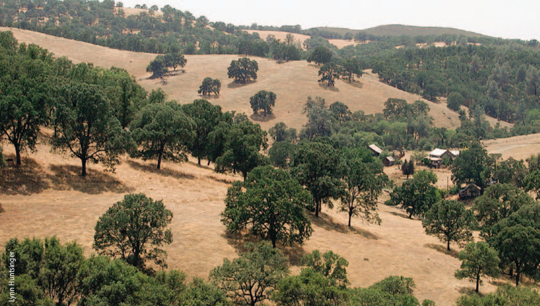
Owners appreciated amenities such as their land's beauty and rural location, but a significant number were unable to place a monetary value on them. Above, a ranch house in the Gold Rush country of Calaveras County.

When developing outreach or policy, it is important to consider landowner goals, motives and needs. The amenity values California ranchers have reported as important include having the freedom to make land management decisions and relative autonomy on their lands, as well as enjoying natural beauty, feeling close to the earth and passing property on to heirs (Huntsinger et al. 2010; Liffmann et al. 2000). At the same time, having adequate forage to maintain a commercial herd and the availability of infrastructure for marketing livestock products were also crucial to those owning most of the larger properties (Sulak and Huntsinger 2007).