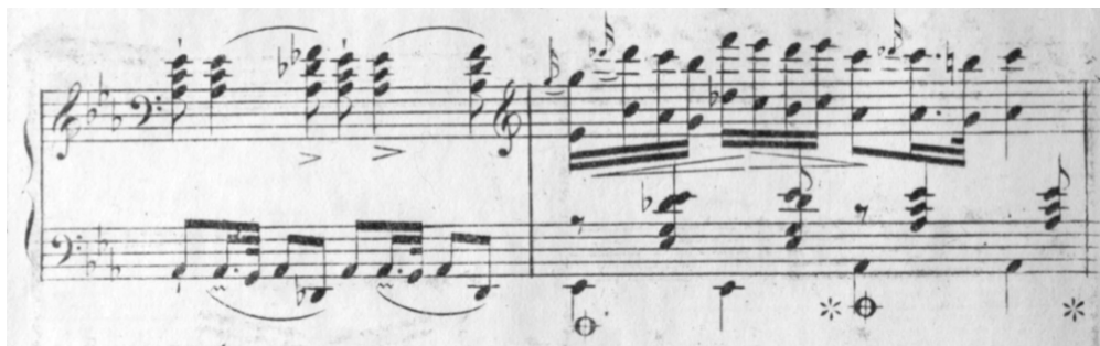
Figure 1.3: Diabelli 1840 first edition: Piece 1, measures 29-30

In this instance, however, Liszt had a special motivation in his composition of Mélodies hongroises . In his choosing of Schubert's version, Liszt was looking for something already featuring a Hungarian element. He is "borrowing" his Hungarianness