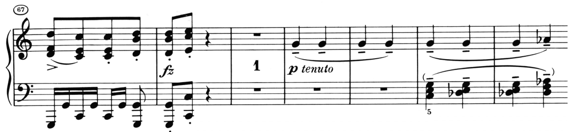
Figure 2.2: Henle edition (1976), measures 67-73

Brahms's collection and revision of Drei Clavier-Stücke was completed around 1868 or 1869, a time in which his independence as a composer was growing rapidly. His concert tours were no longer financial necessities, but were undertaken for promoting his work, for recreation, or for intellectual development. 37 Only five of Brahms's editions of