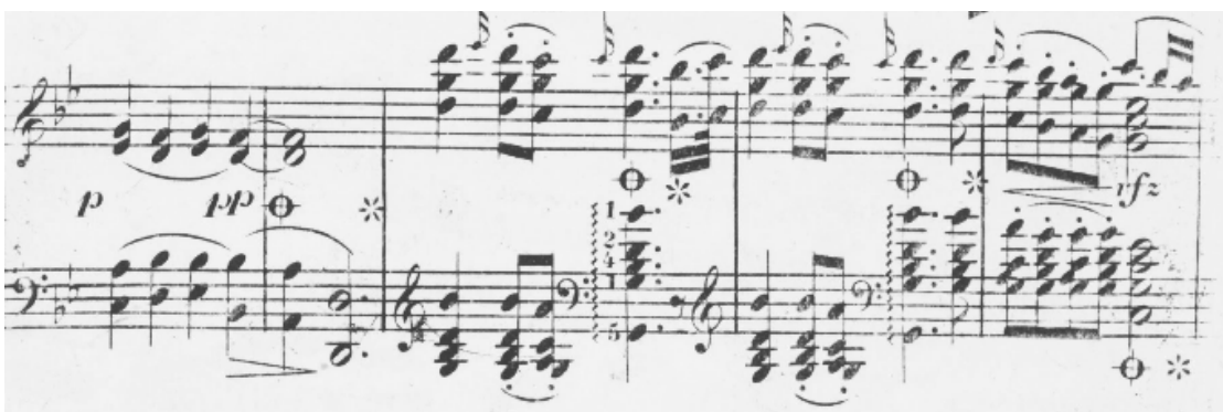
Figure 1.1: Diabelli 1840 first edition: Piece 1, measures 4-8

One set of Liszt's Schubert transcriptions that particularly exemplifies this phase of