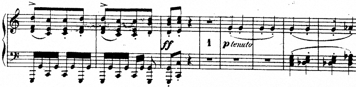
Figure 2.1: Brahms edition (1869): Measures 67-73.

encouraged him to make the trip, such as Clara Schumann, who regularly performed in Vienna. It was just a short tenure after his arrival in the city that he met many prominent artists, including Julius Epstein, Carl Tausig, and Otto Dessoff. 34 The experience of