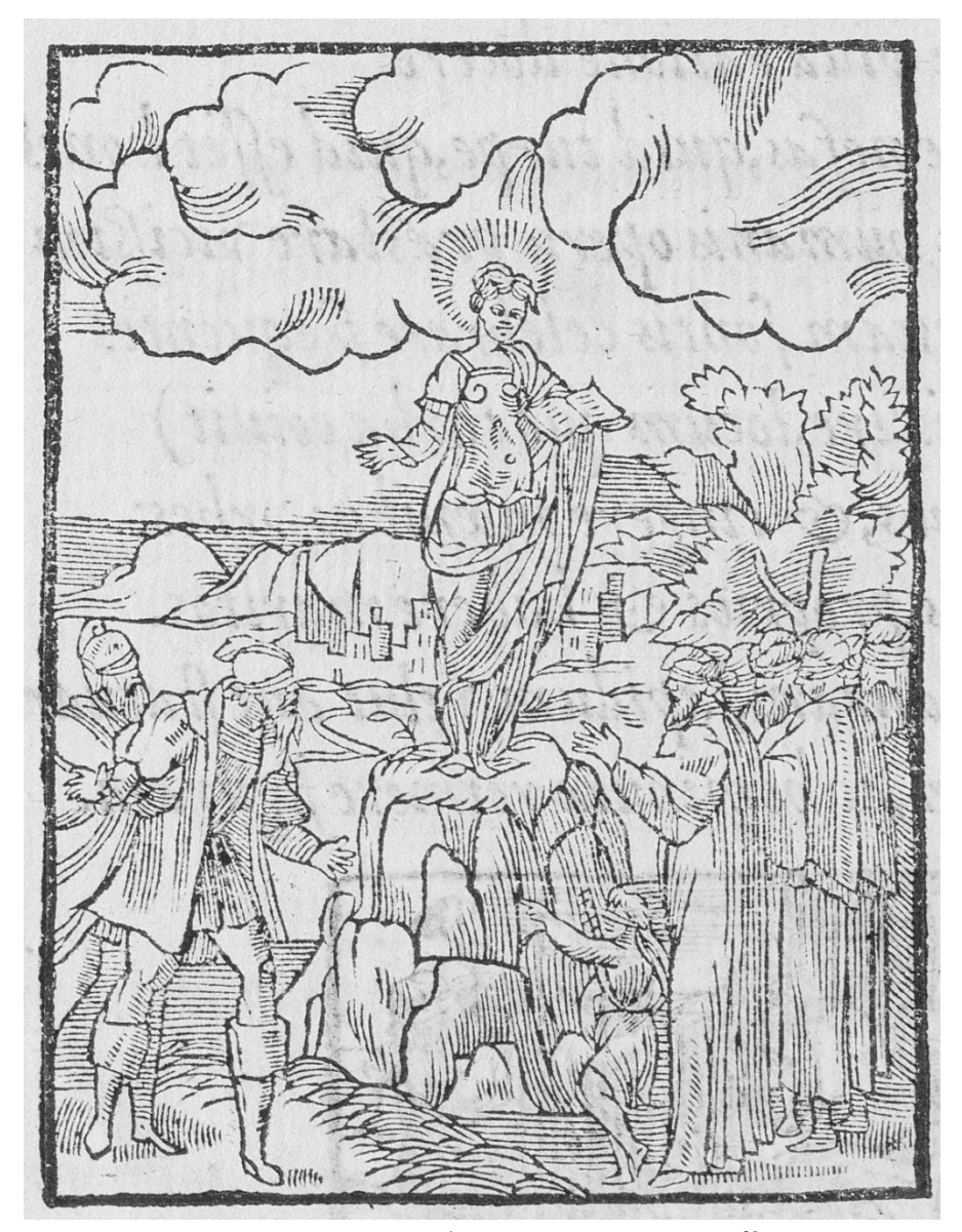
Illustration 1: Aneau's Image of Justice<sup>29</sup>