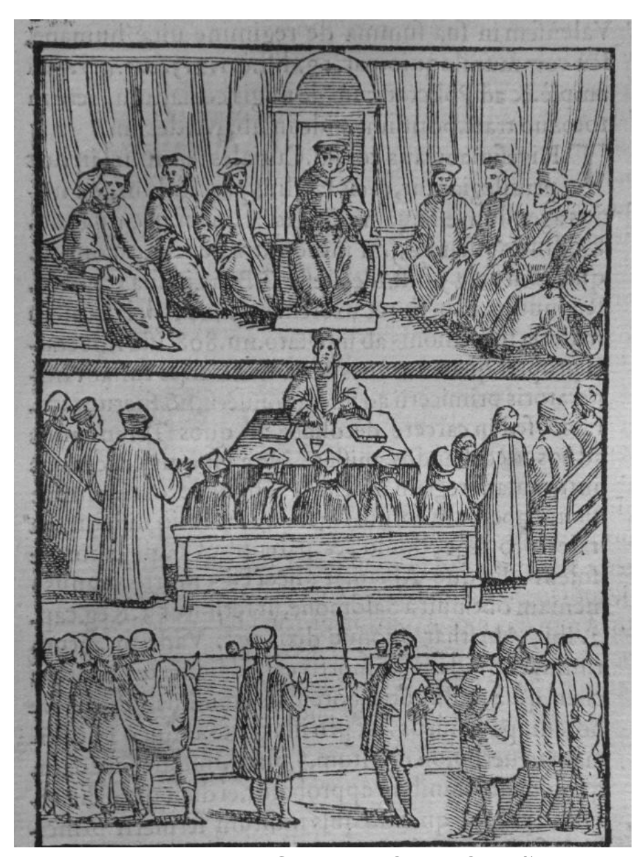
Illustration 4: Chasseneuz's Order of Offices81