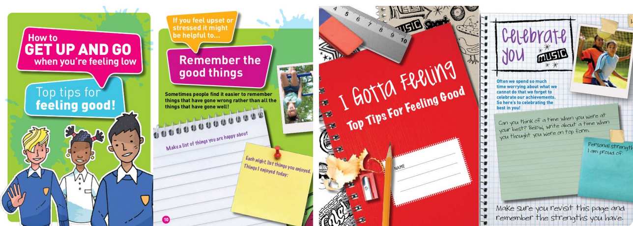
Fig. 1 Example pages from the intervention booklets, “ How to Get Up and Go When You’re Feeling Low ” (left panels) and “ I Gotta Feeling ” (right panels). Copies of the booklets are available from the authors

hindered by low mental health literacy and stigmatising attitudes towards mental health problems [8]. The provision of booklets and other forms of information have been recommended as potential low-cost routes for promoting improved recognition of mental health symptoms in young people [9]. Increased knowledge about mental health problems has also been shown to be associated with improved self-management, such as appropriate help seeking [8, 10, 11]. Given the potential for wide dissemination of information booklets, even very small effects of this type of intervention may translate into meaningful impact on mental health and well-being at the population level. However, rigorous evaluation is needed to determine whether this is indeed the case.