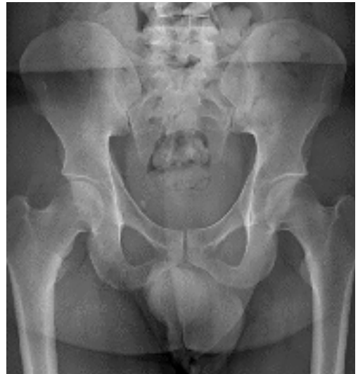
Image 1. A plain anteroposterior view of the patient's pelvis, not showing any foreign body.

AP and lateral radiographs were obtained of the pelvis, but no obvious foreign object or mass was clearly visualized (Image 1).