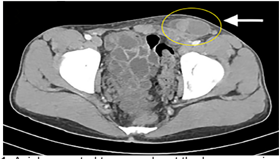
Image 1. Axial computed tomography at the lower margin of the pelvis with the cryptorchid testicle shown in the left inguinal canal (circle).