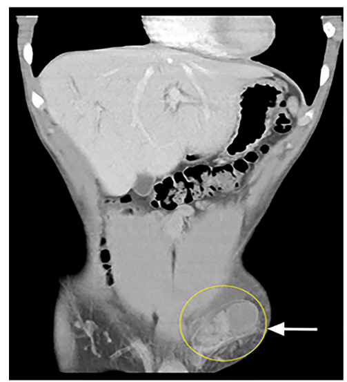
Image 2. Coronal reconstruction computed tomography demonstrating the cryptorchid testicle in the left inguinal canal (circle).