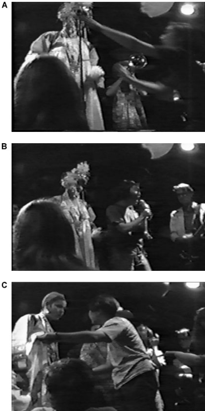
FIGURE 6. Still images from video recording of Heavenly Ten Stems protest.