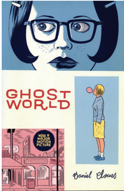
FIGURE 3. Cover of Ghost World comic (Clowes 1997).

Much of Clowes's work revolves around broad critiques of contemporary popular aesthetics and consumerism, foregrounding the alienation of everyday life in late capitalism. He parodies record collectors and other “knowledgeable” consumers as overgrown teenagers who cannot break free from their love–hate relationship with the commodity form of media. In Ghost World , Enid is first drawn to pop culture nostalgia in a distanced manner, but her ironic treatment morphs into appreciation. Her gleeful disgust for the weird trashy excess of media circulation blends into genuine admiration for some sort of truth offered by these objects of consumer overflow. 5 In Clowes's comix, those who become conscious of the absurdity of their surroundings are pushed into the margins by their own isolated recognition. In this America, everyone—at least everyone paying attention—is a fringe dweller. In creating the film for Ghost World , Clowes says,