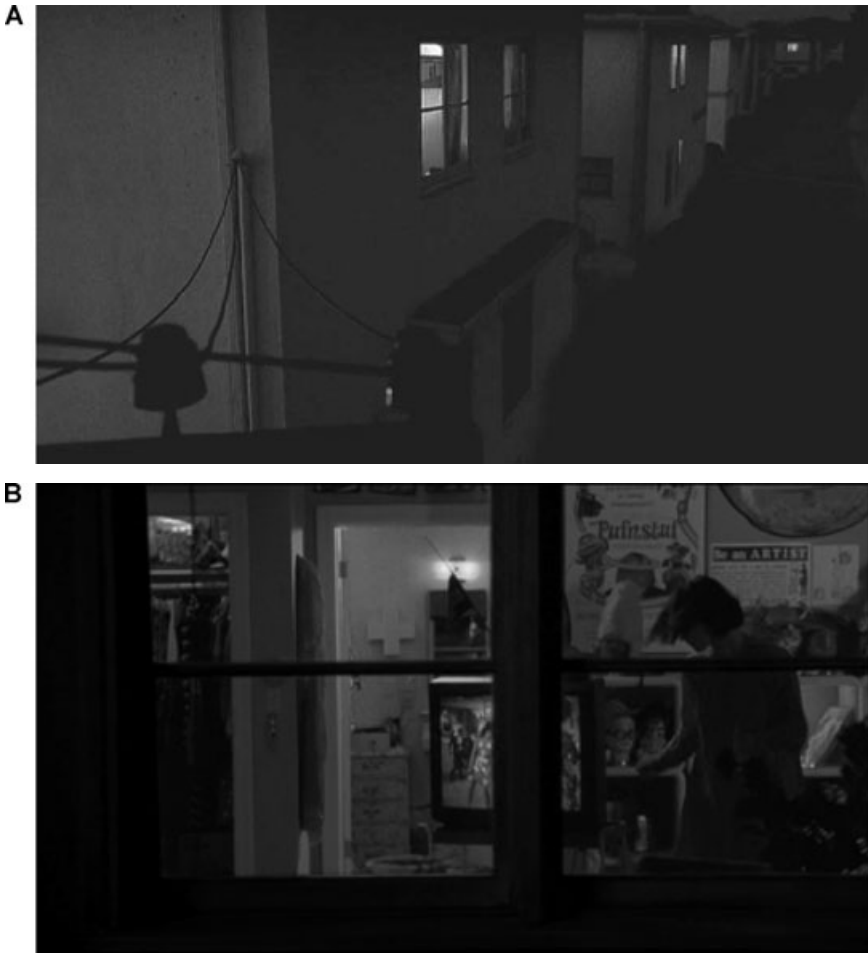
FIGURE 2. Panning along the horizon of reception in Ghost World ; Enid's room.

to something else. The tune is something Enid connects to in spite of herself—in spite of, or perhaps because, something doesn't translate. Jaan Pehechaan Ho means “if only we knew each other”; but Gumnaam , the title of the film from which the song is extracted, translates to English as “Anonymous.”