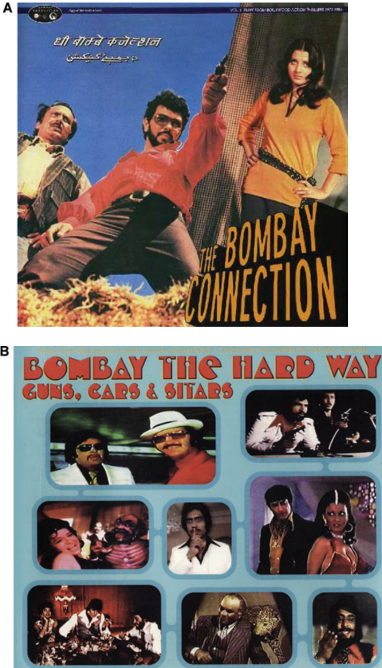
FIGURE 4. A. The Bombay Connection (2007); and B. Bombay the Hard Way (1999) CD covers.