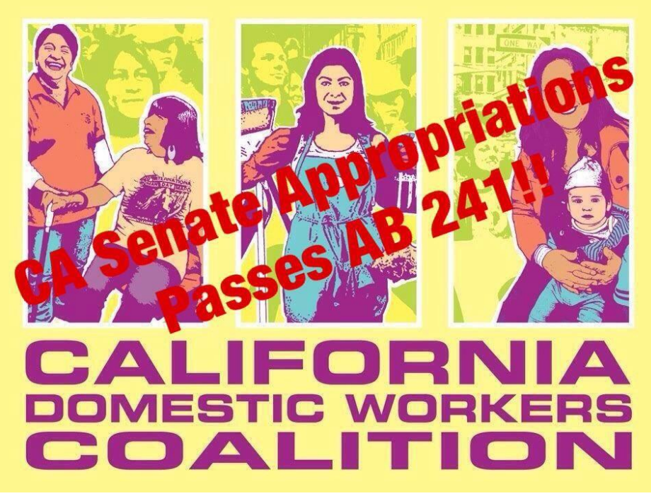
Caption: Campaign poster from California Domestic Workers Coalition, September 2013.