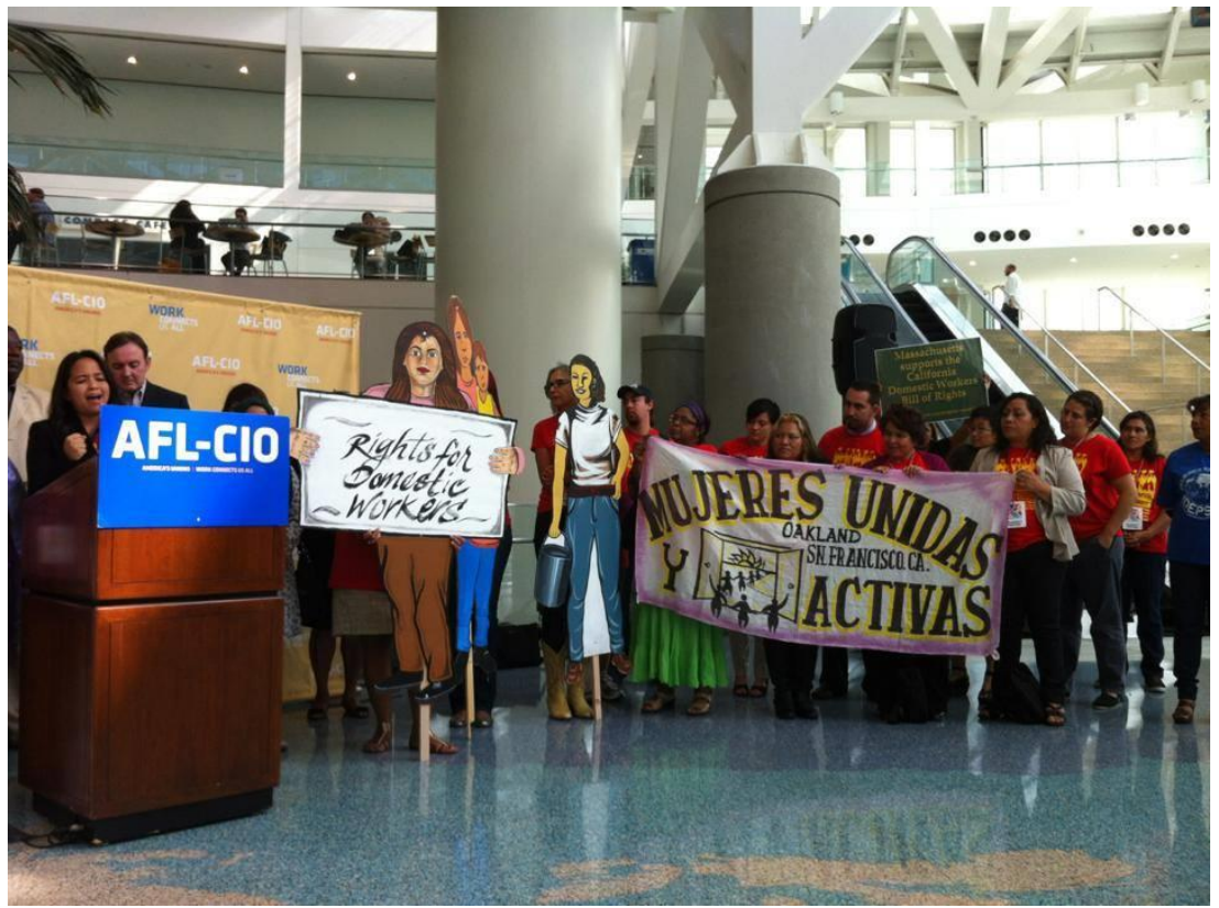
Domestic Workers and AFL-CIO hold a press conference celebrating lobbying and success of AB 241 at the California Legislature in Sacrament, CA October 12, 2013.

Court ruling, Mendiola v. CPS Security Solutions, Inc , affirmed this interpretation to include domestic workers, especially in relation to overtime. Additionally, the WTPA can be used to assert enforcement of rights. It states that all employers must comply with this legislation that went into effect in 2012 without any caveats.<sup>14</sup> Thus California labor law has legal obligations and tasks for state agencies, employers, and employees. Yet the burden of initiation lies with domestic workers.