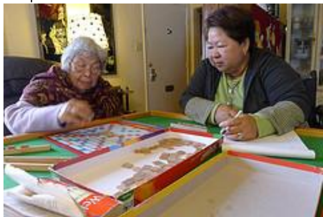
Domestic Care Worker providing crucial care work in the resident's home.

includes domestic workers and personal attendants. The burden is on the employer to provide documentation and pay schedules. The Attorney General's Office provides explicit requirements for the employer to adhere to as a preventative strategy, with enforcement options including civil penalties.<sup>74</sup>