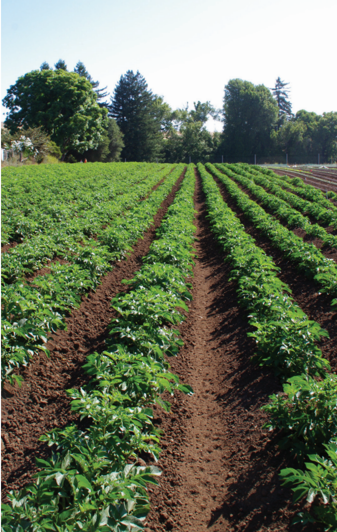
FIGURE 5. Hilled potatoes at the UC Santa Cruz Farm.