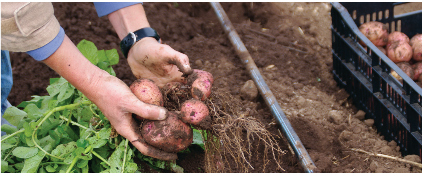
FIGURE 8. Handle new potatoes gently to avoid damaging the fragile skins.