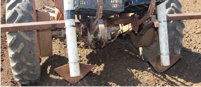
FIGURE 2. Alabama shovels with “drop tubes” for placing seed pieces.