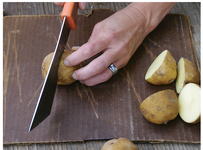
FIGURE 1. Preparing seed pieces for planting.

Seed potatoes that are large enough can be cut into smaller pieces to extend planting stock volume. Cut tubers into