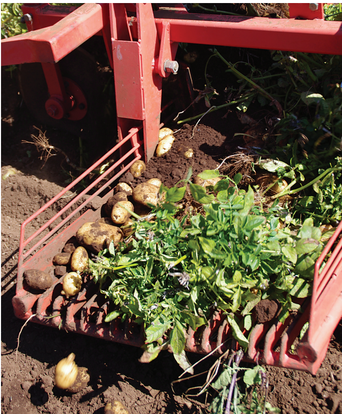
FIGURE 10. Shaker cage deposits harvested potatoes on the soil surface.