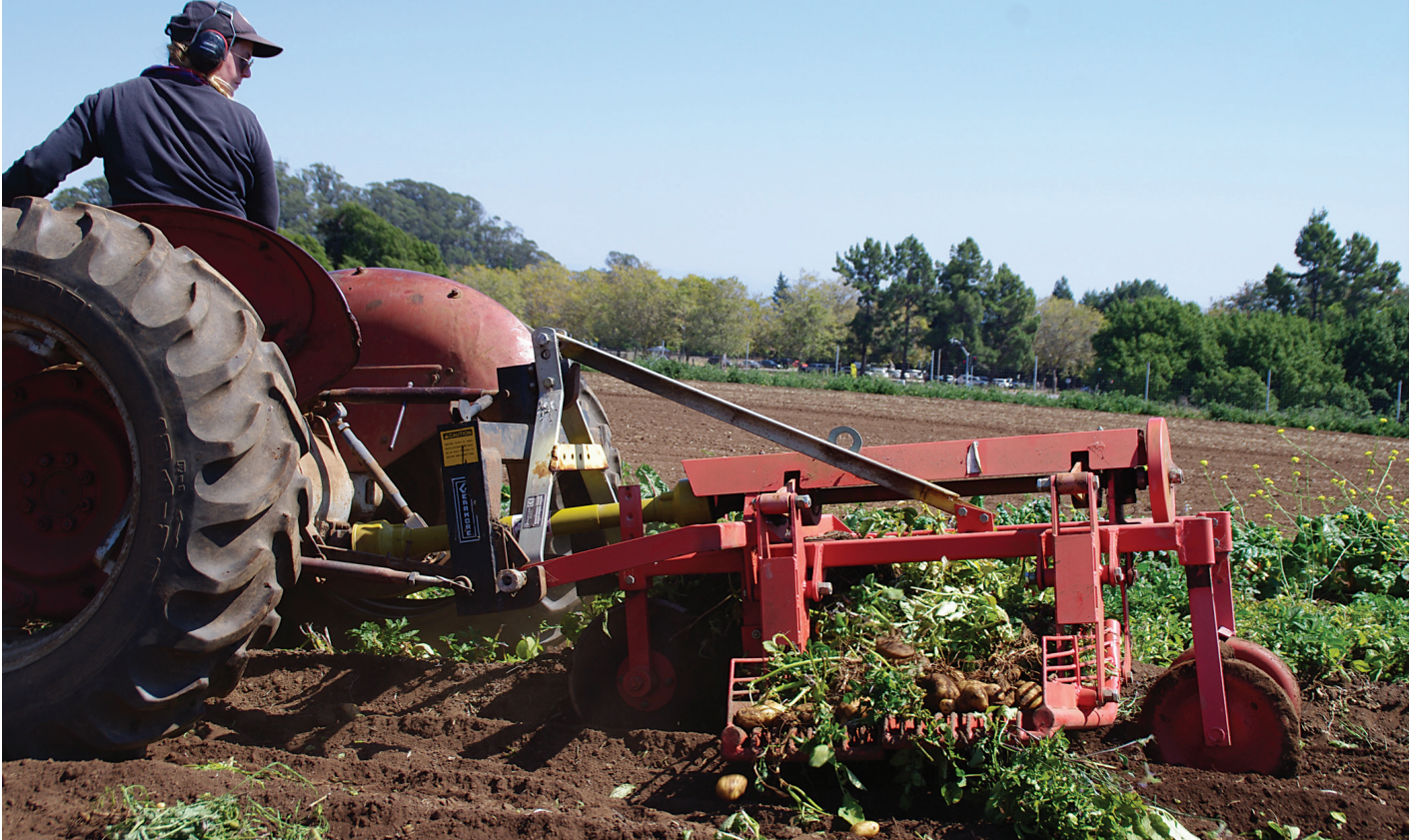
FIGURE 9. Example of a PTO-driven harvester with “shaker cage.”