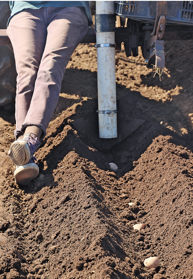
FIGURE 3. Plant potato seed into furrows created by furrowing or Alabama shovels.

1.5–3-ounce pieces (a little larger than a hen’s egg) with at least two “eyes” on each cut piece (Figure 1). Cut through the center of the potato and allow the cut to heal over for 3 days prior to planting. Seed cut immediately before planting may experience decay in the ground, especially if soil is too dry or too warm at planting.