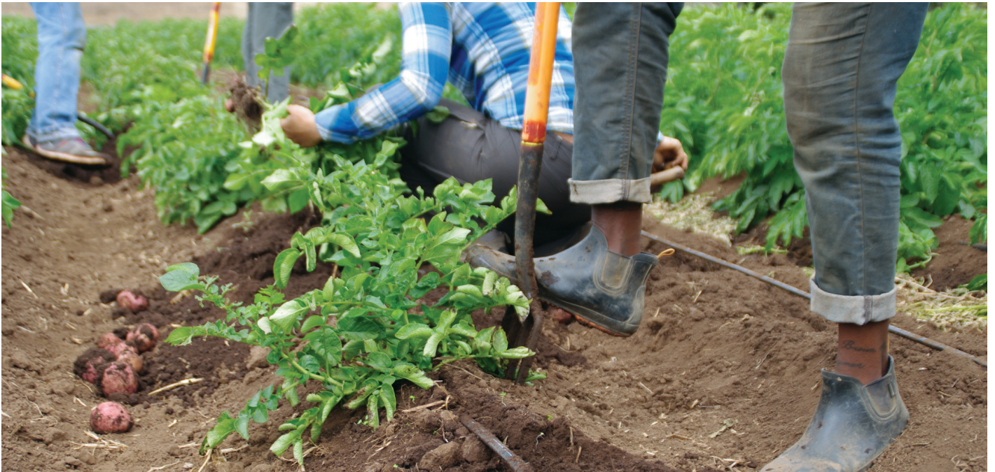
FIGURE 7. Harvest new potatoes using a garden fork.

Use a dedicated potato harvester or an under-cutter pulled behind a tractor for mechanized harvest. For potato production areas much larger than one-quarter acre, it is best to harvest mature tubers with a dedicated potato harvester, such as a single-row PTO- operated digger with an undercutter bar and shaker cage. The harvester lifts the spuds and leaves them on the soil surface to pick up (Figures 9 and 10). Break the furrow tire compaction with chisels before harvest to ensure that the under-cutter or harvester can get below the lowest tuber and work effectively.