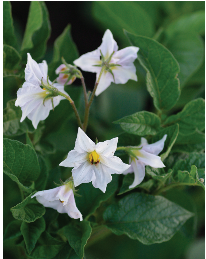
FIGURE 6. Potatoes begin to flower at approximately 40–50 days post planting.

Tubers enlarge, increase in starch content and individual varietal characteristics. Skins set and thicken, allowing for long-term storage.