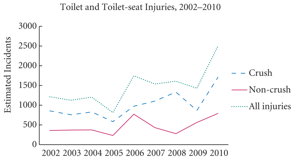
Fig. 2. Estimated incidents of crush and non-crush injuries for years 2002–2010. Error bars represent upper and lower 95% CIs. Number of actual cases is shown above bars.