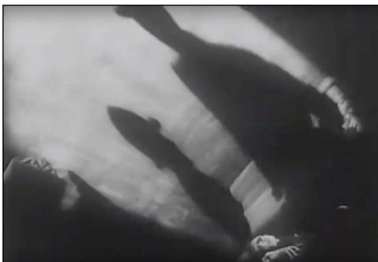
Figures 1-2: The protagonist watching shadows on the living-room ceiling (top); shadowy figures play across the wall above the protagonist (bottom). From Die Straße, dir. Karl Grune, 2:53, 2:17.

This opening scene to Karl Grune’s 1923 silent film Die Straße emphasizes the outside world’s difference from the calm, traditional interior in which the viewer first encounters the protagonist. Activity from the street enters the home unannounced and uninvited; it is invasive, and yet it is also intriguing. Carnavalesque street scenes lure the man outside to voyeurism, adventure, and