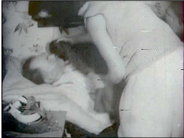
Figures 2.10-2.13. Scenes of people at home in a sequence about working-class domestic life. From Zeitprobleme. Wie der Arbeiter wohnt, 8:16-8:54.

This short sequence appears to illustrate the difficulties and claustrophobic conditions of working-class dwellings, all of which are situated such that a variety of tasks are carried out in a single room. After the woman has adjusted the old man's head in figure 2.13, an intertitle reads, "Durch die nasse Kellerwohnung taubstumm geworden." 70 This makes clear the health hazards of low-income dwelling spaces and the poor quality of life associated with those affected by joblessness and poverty. It can also be read as a metaphor for the silencing of the working public by their plight, and their blindness to the idea that something is wrong.