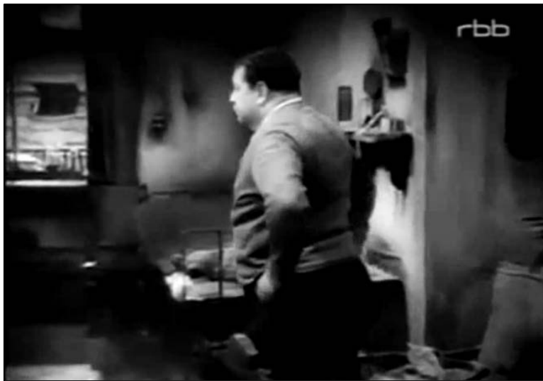
Figures 3.2 and 3.2: Cilly and Franz in Franz's rented room (top); Franz crossing his small room (bottom). From Berlin Alexanderplatz, dir. Phil Jutzi, 16:39, 17:33.

The room is shown in one scene, as the camera pans across the window, bed, table and chairs, to Franz on the sofa next to the desk, and back across the room past the window to Franz's wash basin. It is a small space, not particularly well-lit, with few personal items and a single plant. In Cilly's apartment is not shown in its entirety as Franz's room is, but her dwelling space appears to be finer—likely a unit that is rented for her by a wealthy boyfriend (see figures 3.3 through 3.5).