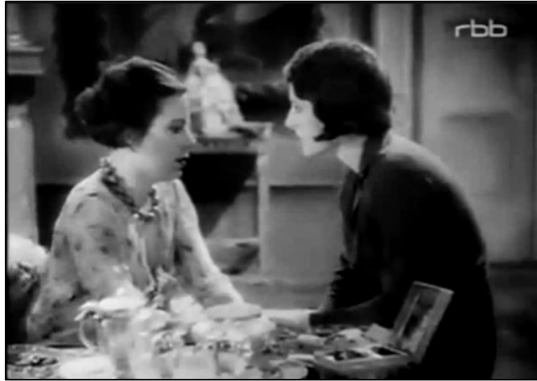
Figures 3.3-3.5. Mieke sits in Cilly's apartment (top); Cilly on the phone in her apartment (middle); Cilly and Mieke confiding in one another in Cilly's apartment (bottom). From Berlin Alexanderplatz , dir. Jutzi, 47:09; 52:30; 57:42.

Jelavich confirms the status of Cilly's living space, writing that: "...prostitution is a trade reserved for Cilly, who becomes the 'kept woman' of a rich man in the western parts of town." 128 Whereas Franz's room is plainly furnished with a few moderately embellished pieces of furniture, Cilly's apartment contains art, china, decorative furniture, and knick-knacks. While Döblin's narrator tells his readers not what style of furniture the apartments have, but rather what kinds of furniture and the feeling they provide, Jutzi's film presents decidedly un-modern decorations for its characters' dwelling spaces. In both cases, the furnishings convey the spaces' relative socio-economic classes. Nobody owns their living spaces in either the film or the novel, but the implication of ownership or privacy for living spaces is stronger in the novel than it is in the film.