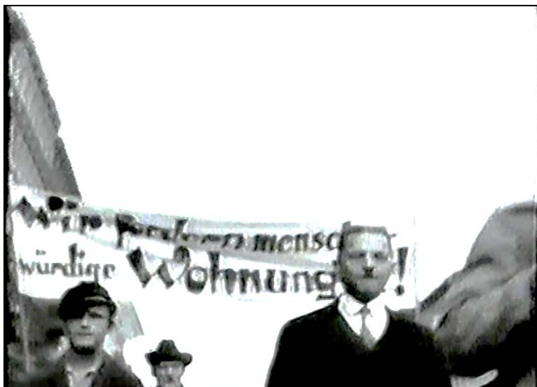
Figure 2.30. Demonstrators in favor of better housing march with a banner as Erna searches for Max. From Mutter Krausens Fahrt ins Glück, 1:14:13.

working-class families. This is made most visible when Erna searches for Max at the demonstration right after she runs away from working as a prostitute for the lodger. The lodger's admonition, "Ein feines Kind, das seine Mutter ins Gefängnis gehen läßt, wenn es helfen kann," 77 clashes with the messages written on the banners Erna sees while she searches the ranks of demonstrators for Max (see figure 2.30).