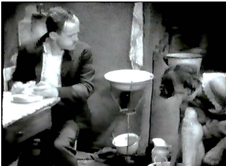
Figure 2.26. The lodger eats while Erna washes her legs at the wash basin in the kitchen. From Mutter Krausens Fahrt ins Glück, dir. Phil Jutzi, 23:40.

This is one of those kitchens in which the family “lives.” As the plot unfolds, the apartment is implicated in the family’s poor luck. Erna, however flirtatious she may seem, constantly sees the lodger making romantic advances at her—even when his girlfriend is around. At about 37 minutes into the film, the lodger convinces Mother Krause to search for Paul, who has not come home since she discovered he spent all of her money in the pub. The lodger takes this opportunity to kiss Erna while she sleeps in the kitchen. She struggles and wakes the child who is sleeping in the room with her—which sends the lodger to back away and open the curtains (see figure 2.27).