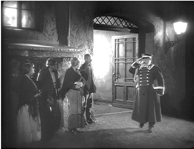
Figure 4.7: The porter salutes his neighbors as they pause their conversation to acknowledge him. From Der letzte Mann, 9:11.

bedroom and a kitchen, it is likely that none of the domestic spaces in these buildings contain dedicated living rooms. To make up for this lack of a space in which they can visit with guests and spend their leisure time, they extend the space of their living environment into the space beyond its walls. As a result of this time spent in the courtyard together, the neighbors know everything about each other. Whenever the porter walks through the courtyard, his neighbors know he is about to arrive and they turn to greet him (see figure 4.7).