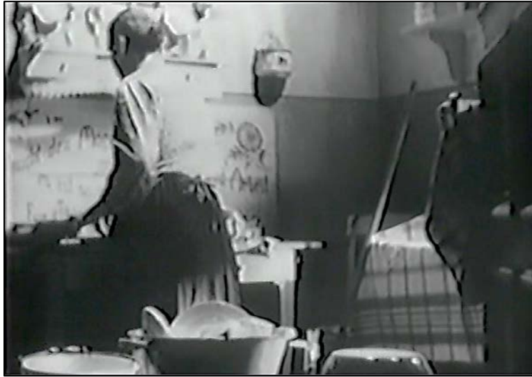
Figures 2.14-2.15. The family eating in a room that appears to be designated both as a living room and a dining room (top) and the mother cleaning up after dinner in the single-purpose kitchen (bottom). From Kuhle Wampe oder Wem gehört die Welt? dir. Dudow, 9:04, 11:32.

While this would seem to place the family within a class of urban residents more closely related with those to whom Die neue Wohnung and its ilk appear to speak, the state of the family's affairs is not as happily aligned as the separation of rooms in the film's apartment. All is not well, as the family is found to be six months behind on their rent. This is a direct result of the son being jobless for seven months. Following his suicide, the family is evicted. After finding no legal recourse, Anni calls her boyfriend, Fritz, for advice. He invites her to bring her family to Kuhle Wampe, where he lives. During the conversation, Fritz states that they are to bring all of their possessions with them. The family is then shown with their furniture piled atop a car, traveling through forested areas toward the encampment along the Müggelsee.