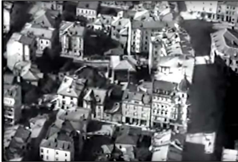
Figure 2.1. Still from an aerial shot that pans across a section of Berlin. From Die Neue Wohnung, 4:04.

Although it is no terrible mass of American-style skyscrapers, 51 the image of Berlin presented in this moment gives a literal overview of the great number of people inhabiting the city's space together. Despite Richter's choice of words, the imagination of the city as a Steingefängnis is subjective. The viewer sees both light and shadow, as well as open space, rivers, and roads in the aerial view. Directly after this shot, an intertitle guides the viewer's perception with the word Elend (misery or squalor). This title cuts to a succession of shots of narrow, dark, cobblestoned passages, decrepit courtyards with no light, a child playing in the dirt, and a drooping flower in a lone pot (see figures 2.2 through 2.7).