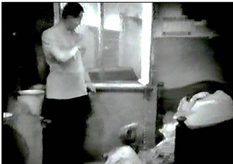
Figure 2.27. The lodger stands between the wash basin and the beds on which Erna and the child sleep. From Mutter Krausens Fahrt ins Glück, 40:32.

This is one of those kitchens in which the family “lives.” As the plot unfolds, the apartment is implicated in the family’s poor luck. Erna, however flirtatious she may seem, constantly sees the lodger making romantic advances at her—even when his girlfriend is around. At about 37 minutes into the film, the lodger convinces Mother Krause to search for Paul, who has not come home since she discovered he spent all of her money in the pub. The lodger takes this opportunity to kiss Erna while she sleeps in the kitchen. She struggles and wakes the child who is sleeping in the room with her—which sends the lodger to back away and open the curtains (see figure 2.27).