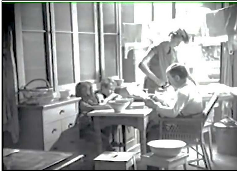
Figure 2.8. The protagonist family “living” in its kitchen by completing a variety of tasks in the same room, although not only the tasks for which that room was built. From Die neue Wohnung , 7:08.

The film answers its own question with an intertitle announcing that, “Man wohnt in der Küche!” 57 In other words, the problem is that the rooms in urban dwellings do not have separately designated functions. This is underscored by a scene in which the protagonist children eat at the table as their father reads the paper and smokes his pipe across from them, as I mentioned in the previous chapter. Meanwhile the mother irons next to the window, beneath a line of laundry strung from the ceiling above them all (see figure 2.8).