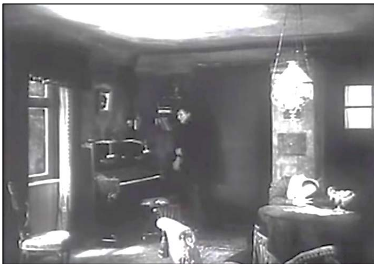
Figures 2.23-2.25. The wife preparing soup in her kitchen (top); setting the table in the living- and dining-room (middle); sleeping at the table until her husband returns home for dinner (bottom). From Die Straße, 4:02, 4:16, 1:28:08.

The young woman who is pursued by that film’s protagonist remains outside the home (and kitchen). Although she is coded as “bad” whereas Anni is coded as “good,” neither woman shows any sign that she might stick to the same roles that have been handed down the generations until her mother.