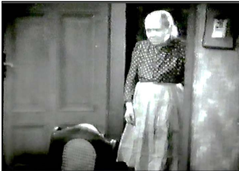
Figures 2.28-2.29. The lodger and his new wife in their rented room (top); Mother Krause entering the room she rents out of her apartment in order to ask her lodgers for a loan (bottom). From Mutter Krausens Fahrt ins Glück, 1:02:25-1:02:27.

This is a large space that the Krause family could use as a living room or bedroom. Yet they must rent out the room, rendering the space off-limits to them, so that they can afford the entire apartment. Mother Krause lays down to sleep on Erna's bed in the kitchen before her death—perhaps not just to be sure that the gas leak kills her, but perhaps also because there is no other space for beds in the apartment while the bedroom is still rented out.