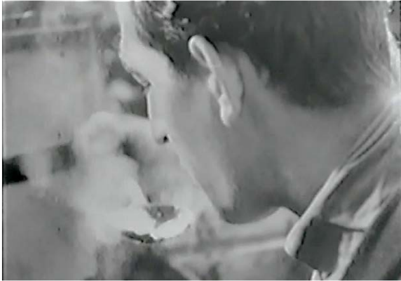
Figures 2.16-2.18. Meals being prepared on stoves by women and men throughout the Kuhle Wampe campground. From Kuhle Wampe oder wem gehört die Welt, 22:55-23:03.

The nature and leisure activities one would expect to find in the campground coexist with the “bourgeois” existence being transported there from the built environs of the city. The two mingle uneasily without being forced to reconcile with one another or with the social issues that are at stake in the film. With no money and no job, one can at least still live comfortably in the woods; no matter how one lives or passes one’s time, there is a small stove upon which dinner can be prepared. It is also worth mentioning here that women and men alike are shown fixing supper on the stoves in this montage, overturning expectations for gendered domestic labor that might accompany the transport of traditional living arrangements to an unconventional dwelling space.