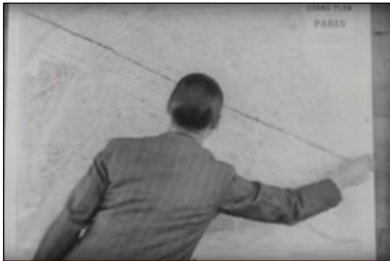
Figures 1.4-1.5: An intertitle that declares, “Le Corbusier proposes to cut through Paris from east to west and demolish the old quarters in the center of the city” (translation mine; top); Le Corbusier drawing his line through Paris (bottom). From L’Architecture d’aujourd’hui, dir. Pierre Chenal, 8:43, 8:46

Le Corbusier propose de percer Paris d'Ouest en Est et de démolir les anciens quartiers qui occupent le centre de la ville.