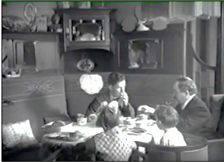
Figures 1.2-1.3: The woman removing dust cloths from the parlor furniture before the guest arrives (top); the guest, husband, and children seated in the parlor (bottom). From Die neue Wohnung , 7:53, 9:13.

The parlor is off-limits to the children until the guest's arrival. It is also locked up before and after the visitor's stay, with cloths covering the furnishings to protect them from dust. This parlor is exactly what Le Corbusier means when he writes of the styles of the past offering much to look at, but little to put to use. The room is chock-full of figurines, paintings, heavy curtains, and decorative furniture. Richter edits the family's lunchtime scene to present the images of these "useless items" at a fever-pitch pace, such that their montage results in a catastrophe. Several figurines, including a bust of Goethe, plummet to the floor and shatter, leaving the children in tears, the mother in shock, and the guest running for the door. Through the montage, this room's interior creates a feeling of claustrophobia that emphasizes the lack of free space in the room. The argument follows that the family must live in the kitchen so as to preserve the bourgeois environment the parlor represents—at the cost of their emotional well-being and freedom of movement within their own domestic space.