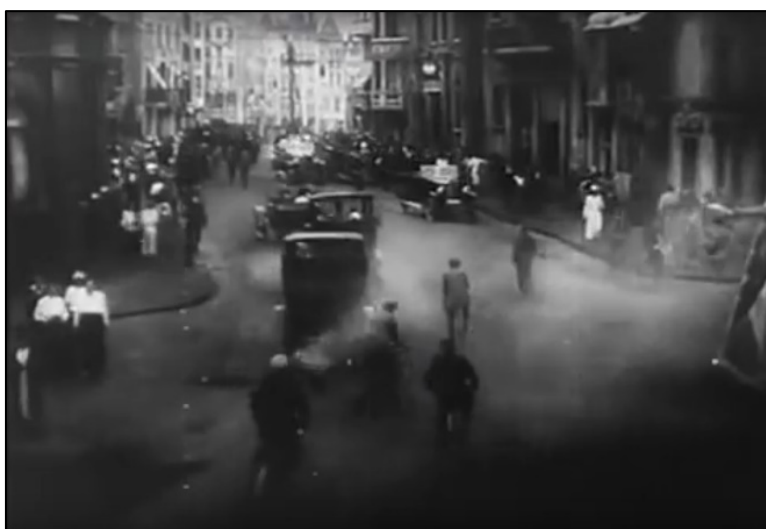
Figures 5-6: Street traffic inset on a grid of speeding train traffic and moving shadows (top); cars, horses, and pedestrians on the street and sidewalk (bottom). From Die Straße , 4:14, 5:28.

Scenes like this are common in European and American films and literature of the first third of the twentieth century—yet they are acutely representative of German modernism, especially of Expressionism and New Objectivity. These scenes are also particularly representative of descriptions of Weimar Berlin. In no work is this more evident than in Alfred Döblin’s 1929 epic novel Berlin Alexanderplatz . The novel is characterized by film-like techniques such as montage and cutaway. It employs an omniscient narrator to guide the Lumpenproletariat 1 protagonist through the busy streets of working-class Berlin. Themes of building, machinery, traffic, and alienation carry the plot along with the protagonist Franz Biberkopf’s trials and tribulations—from the moments when he leaves the Tegel prison and