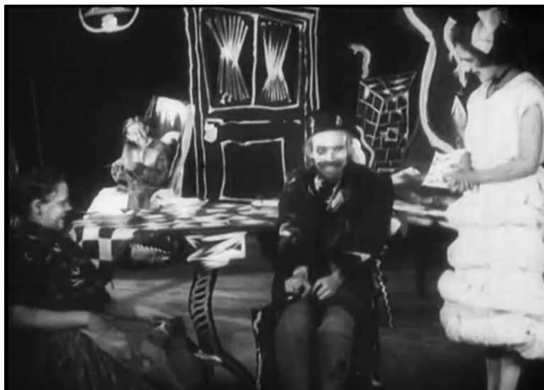
Figure 1.7: The cashier in slippers, robe, and cap amid his family in the parlor. From Von morgens bis mitternachts , 29:37.

The most modern embellishment in the room is the hanging lamp to which the cashier refers in his monologue in the play. In the scene during which the cashier is seated in his housecoat and slippers, smoking his pipe while his daughter and wife attend to him, he peers around the room smiling, nodding, and chuckling to himself (see figure 1.7).