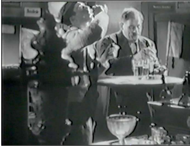
Figure 4.4: Anni's father and a friend drink in the corner bar. From Kuhle Wampe oder Wem gehört die Welt? , Dudow, 15:01.

Although this family does have a living room in their apartment, the apartment is still lacking in some necessity that drives the father outside: namely, the monetary assurance that the family will be able to continue living there. The conversation that the father and his friend share in the pub scene focuses on the situation of joblessness in Berlin, a topic about which the father and his son have just quarreled. Joblessness is directly related to the family's inability to pay rent, to the negative relationship between father and son, and to the father's need for the stability that he finds in the pub. Stability is presented here as the familiarity with other patrons and their shared understanding of how the conditions for living should or do work. As I have discussed it in Chapter 1, the living room in Weimar films is a static space that holds onto the decorative styles of the previous century. This is a visual representation of a type of stability that can be associated with the private living as well as with the corner bar. For anyone who did not have a living room in his or her home, the living room was just outside.