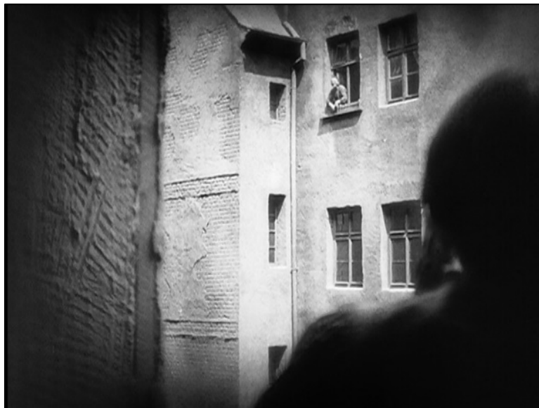
Figures 4.9-4.12: A neighbor listening through the door as the porter's in-law tells his daughter what she saw at the hotel (top); the neighbors telling one another the news in the hallway (upper middle); a neighbor shouting the news across the courtyard (bottom middle); a woman listening at her window as another neighbor shouts the news across the courtyard to her (bottom). From Der letzte Mann, 1:00:46-1:02:12.

The hallways of the tenement buildings and the courtyard among them link the inhabitants together in a network of information, just as they connect the neighbors on a grid of domestic space. The Hinterhof in Der letzte Mann is an informational intersection point in the grid of the tenement community's space. As the scenes discussed above show, it is also a space other than the kitchen or bedroom in which the people living in that community can pass their time before bed or before the start of the workday, much like the space of the Eckkneipen in Berlin Alexanderplatz and in Mutter Krausens Fahrt ins Glück . The neighbors know one another as a result of living around the edges of these densely populated buildings. Because of the open space