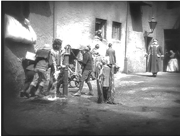
Figures 4.5-4.6: Residents in the courtyard outside the porter's tenement building; children play with a water pump in the courtyard. From Der letzte Mann, dir. F. W. Murnau, 8:05, 15:39.

In almost all instances, the courtyard contains groups of chit-chatting neighbors, with several people hanging out of windows to join in the conversation. It is a lively atmosphere that could easily be equated with the liveliness of modern urban streets. Yet the courtyard is made possible by the domestic buildings that border it, which leads to a unique social environment.