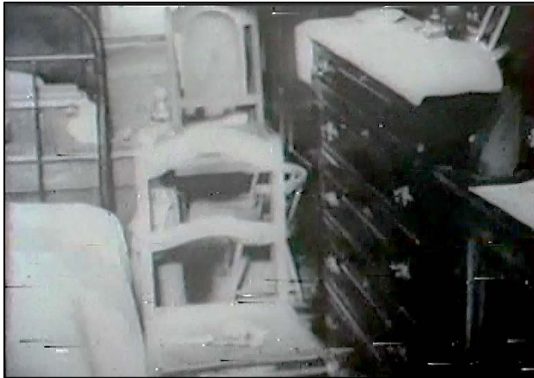
Figure 2.9. Still from a sequence panning across the furnishings of a "Schlafstelle" (a rented room or place to sleep) in Berlin. From Zeitprobleme. Wie der Arbeiter wohnt , dir. Slatan Dudow, 7:38.

National Socialist protests. 69 Of course, the fictional narratives of socialist realist movies cannot be equated with any actual reality in Berlin. These films assuredly support a specific ideological worldview. Yet they address some of the same issues that the modernist designers and architects sought to fix. In the 1930 short film Zeitprobleme. Wie der Arbeiter wohnt , director Slatan Dudow addresses a question similar to that of Richter's Die neue Wohnung , which was produced the same year. Dudow's 10-minute documentary uses a similar style of montage to that of modernist design's exhibition films. In fact, Dudow even uses some of the exact same filmed material that Richter uses in the exterior scenes of Die neue Wohnung . But Dudow presents the "proletarian" side of urban life, focuses on the workers and working class, and goes inside of communal dwellings and low-income apartments. At about seven minutes into the film, the viewer sees a Schlafstelle (literally, "sleeping space") featuring a stove, wash basin, dresser, chair, and bed all crammed into a single small room (see figure 2.9).