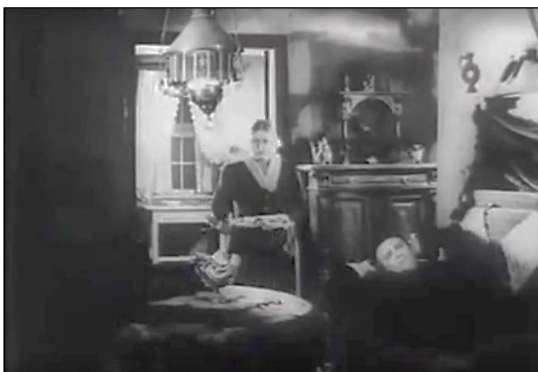
Figures 3-4: The protagonist's wife preparing soup in the kitchen (top); wife and husband in the traditionally furnished living room (bottom). From Die Straße, 0:48, 1:01.

The street scene that poached her husband from his cushy spot on the sofa is a ubiquitous representation of early twentieth-century urban life. Hordes of pedestrians mingle on the sidewalks, and cross streets are made dangerous by all manner of speeding vehicles. Lights flash, store windows beckon, and everything is in motion (see figures 5 and 6).