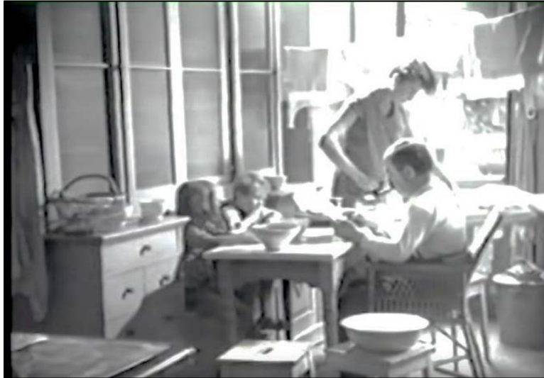
Figure 1.1: The family "living" in its kitchen. From Die neue Wohnung, dir. Richter, 7:08.

laundry, bathe, read, and complete schoolwork in their kitchen while their living room is reserved for visitors (see figure 1.1).