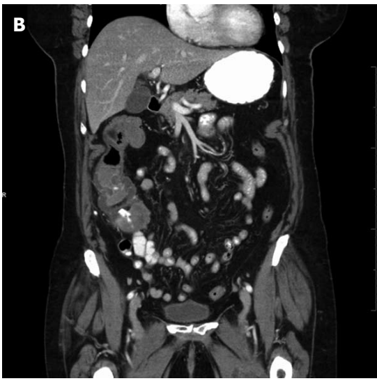
Figure 1 Computed tomographic scan images of contained colonic perforation suspected secondary to cecal retroflexion. The cecum with an associated contained fluid collection is shown in axial (A) and coronal (B) views.

second examination of the proximal colon in either forward view or retroflexed view, but neither showed a benefit of cecal retroflexion over second forward-view examination<sup>[8,11]</sup>. In contrast, prospective cohort studies suggested a significant increase in adenoma detection rate when performing retroflexion in patients underwent initial forward-view examination<sup>[5,12]</sup>.