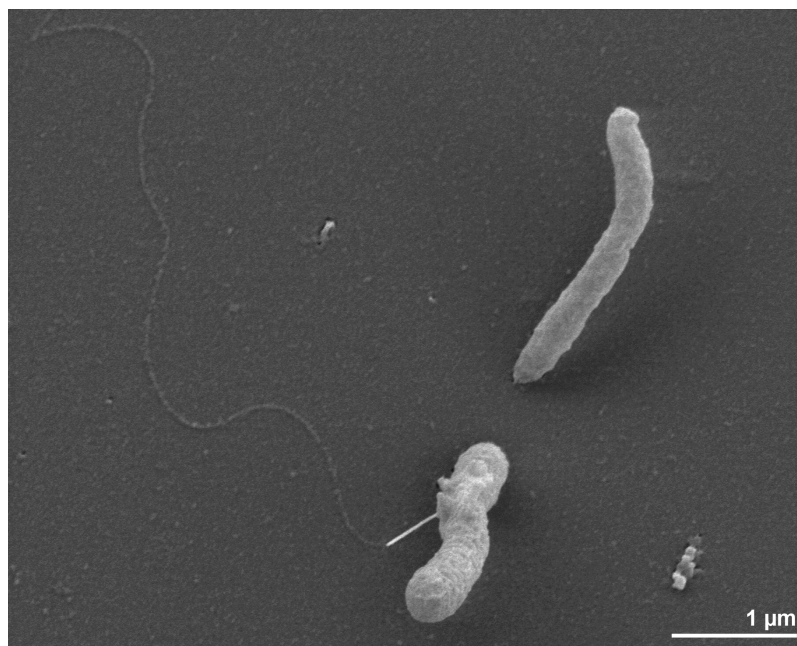
Figure 2. Scanning electron micrograph of T. lienii Cas60314 T