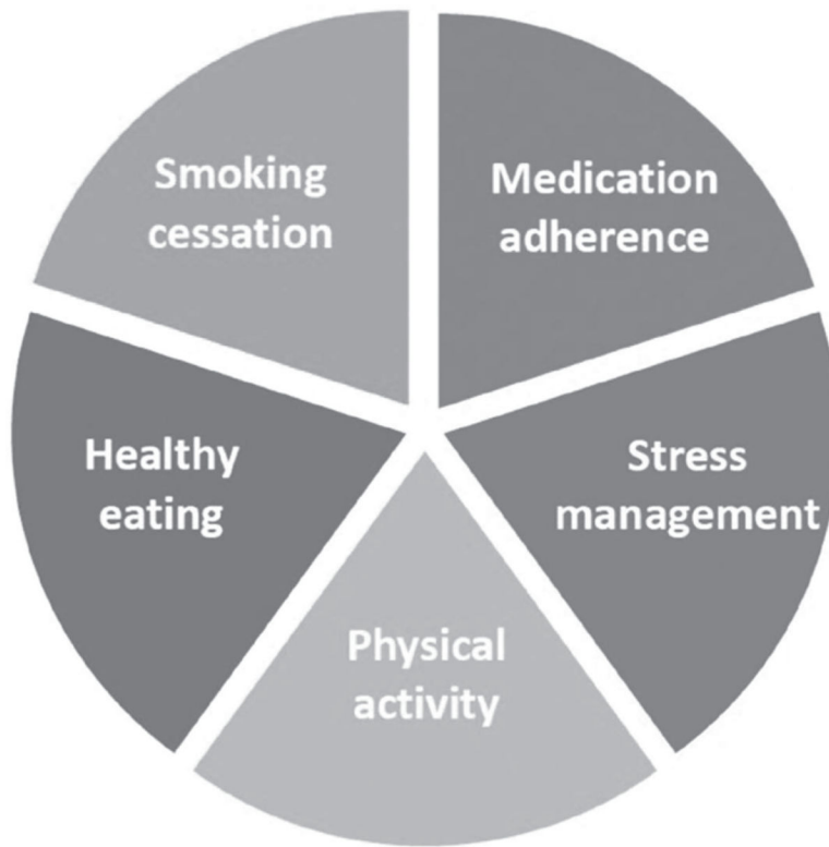
Figure 1. Target health behaviors for cardiac rehabilitation