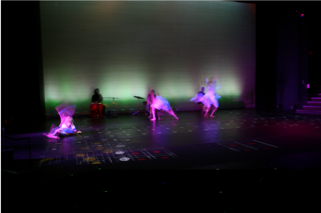
Figure 1. The Three Body Problem necessitated the use of side light and UV light to avoid washing out the floor projections.

The Three Body Problem , Ted Warburton's part of the show, is a movement and projection driven analysis of the mathematical three body problem. The dance piece creates a visualization of the interactions of three partials and the effects of their individual gravitational fields. A combination of the constant floor projection and the semi-randomized nature of the music creates a scenario that is very limiting from a practical standpoint; there are few angles of light that will provide full stage coverage while not washing out the projections (See fig. 1).