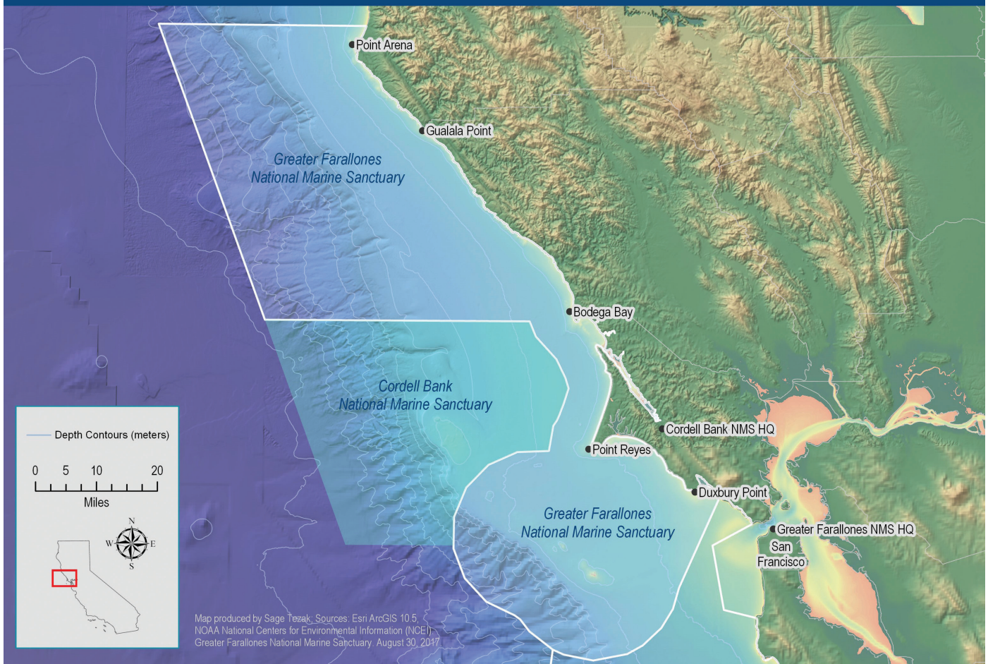
FIGURE 1. Greater Farallones National Marine Sanctuary. Map by NOAA ONMS.

California and GFNMS. Further, like trees in terrestrial forests, kelp may play a role in climate mitigation. There is some evidence that kelp are globally significant to carbon sequestration (Krause-Jensen and Duarte 2016). Kelp may even locally alleviate ocean acidification (Nielson et al. 2018). Thus, the assessment of moderate-to-low vulnerability for this important habitat was encouraging.