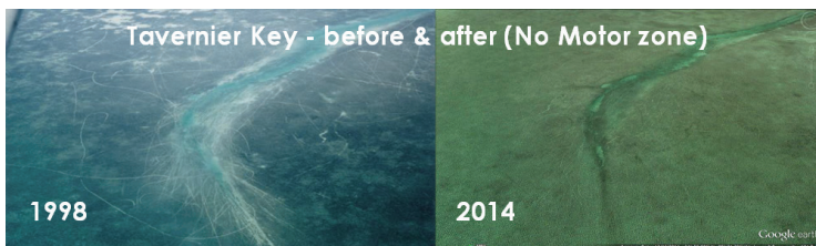
Figure 4. Aerial views near Tavernier Creek within Florida Keys National Marine Sanctuary taken in 1996 and 2014 show significant shallow-water habitat recovery due to the 1997 designation of a wildlife management area.

for successful climate adaptation. A prime example is Papahānaumokuākea Marine National Monument, the largest protected area in the US. This expansive MPA encompasses the islands and waters of the northwestern Hawaiian Islands (Figure 5). Covering 582,578 mi 2 and stretching for a distance of 1,350 mi, it encompasses an area larger than all the nation’s national parks combined. Papahānaumokuākea is comanaged by four trustees: NOAA, US Fish and Wildlife Service (USFWS), the state of Hawaii, and the Office of Hawaiian Affairs. This partnership has allowed the managers of Papahānaumokuākea to pull from a breadth of expertise and resources in order to successfully navigate the daunting task of managing one of the largest, most remote MPAs on Earth under a changing climate. For example, a 2019 research cruise in Papahānaumokuākea documented widespread coral damage at French Frigate Shoals, an atoll in the monument, from Hurricane Walaka, a Category 3 storm that passed through the area in October 2018. That year was the most intense Pacific hurricane season on record, part of a pattern of more intense storms due to warmer oceans. The ability for Papahānaumokuākea managers to leverage a range of expertise and resources allows for the flexibility needed to adapt to this and other climate stressors now and in the future.