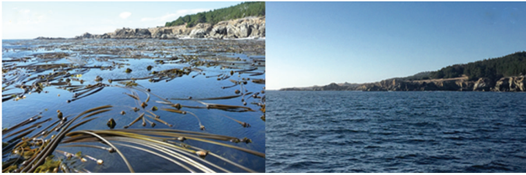
FIGURE 2. Comparison of healthy (2012; left) and degraded (2016; right) kelp canopy at Ocean Cove within Greater Farallones National Marine Sanctuary.