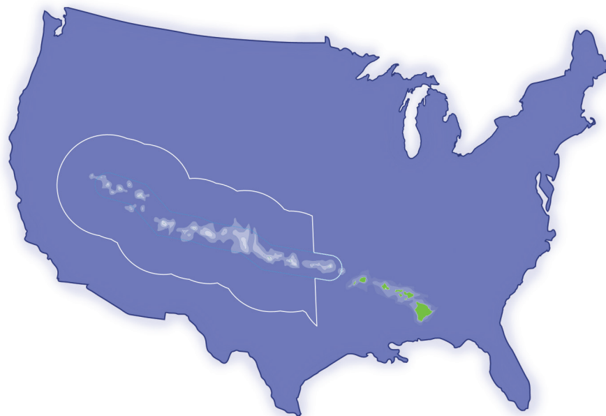
FIGURE 5. Overlay of Papahānaumokuākea Marine National Monument (outlined in white) on top of the continental United States. Graphic by Papahānaumokuākea Marine National Monument.

The National Estuarine Research Reserve (NERR) System is another example of successful management through cross-institutional partnerships. The system encompasses 29 estuarine sites jointly managed for research, education, and stewardship by NOAA and the states in which the sites are located. This unique state–federal partnership allows the NERR System to leverage federal funding and guidance while maintaining local management and considerations. Further, many NERRs partner with local universities, allowing them to participate in and