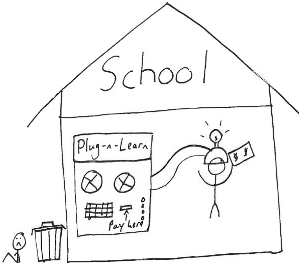
Figure 1: Example of an Image from a Causal Layered Analysis

This drawing belongs to the Systemic Causes level of one group's causal layered analysis. It displays a dystopian future scenario in which the Plug-n-Learn, a device that allows someone to connect their brain to a computer that inputs knowledge in an instant, has been invented. In this dystopian scenario, a rich person is shown as being able to afford to use the Plug-n-Learn, but a poor person is unable to afford education and forced to live on the street.