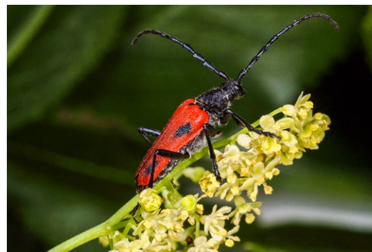
In the Central Valley, blue elderberry provides critically needed habitat for the threatened valley elderberry longhorn beetle.

Quantities and costs of material and labor inputs were tracked for 2 years by project personnel (for one-time inputs) and by the growers (for recurring inputs such as irrigation) via standardized data sheets. Costs for each site, limited only to the elderberry row, were