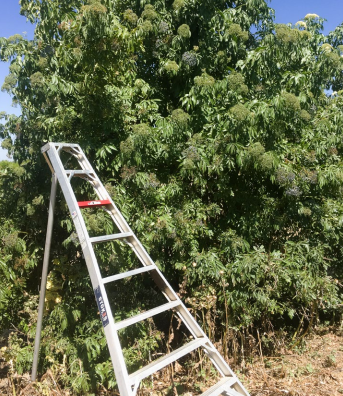
A mature blue elderberry shrub with an 8-foot orchard ladder for scale. Shrubs of this size can yield from 20 pounds to over 170 pounds of berries in a season.

hedgerows to adjacent cash crops (Morandin et al. 2016), this study goes further in exploring the capacity for native plant hedgerows themselves to provide a viable cash crop while still being managed for ecosystem services, such as pest management, pollination and carbon sequestration benefits (Chiartas et al. 2022). This study worked with farmers to try different planting designs for elderberry-containing hedgerows, assess establishment and maintenance costs, measure potential berry yields and revenue in the first few