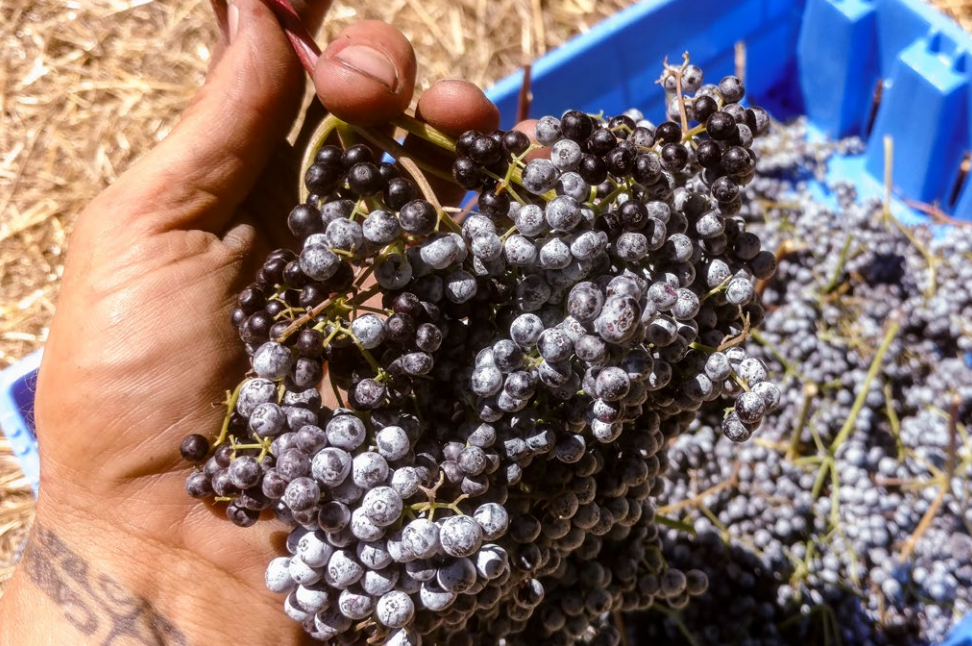
Blue elderberries appear blue due to a waxy white surface bloom that forms on the bluish-black berries just as they approach full ripeness.

standardized to a 1,000-foot (305 meter) hedgerow, and standard labor and equipment operation costs were applied to complete preliminary studies of the cost of establishment (Brodt et al. 2020a; Brodt et al. 2020b; Brodt et al. 2020c). For this article, for better comparability to other literature on hedgerow establishment costs, we added site analysis and design costs, as well as native grass and forb seed costs, as detailed in Long and Anderson (2010). Total time to accomplish hand harvest and hand destemming of frozen berries was measured repeatedly with a timer over the course of the second season by multiple different workers at one of the participating farms, to calculate average harvest and destemming labor costs on a per-pound basis.