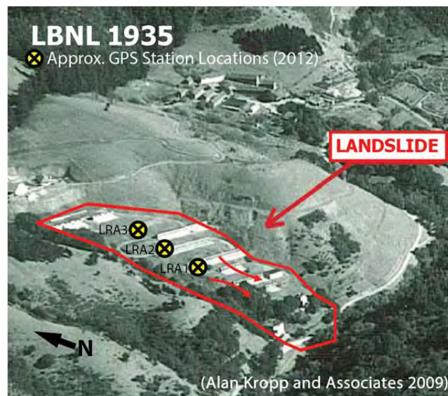
FIG. 1 1935 Oblique view of LBNL landslide with current GPS station locations.

Since January 2012, the first 6 continuously streaming GPS stations have been producing daily solutions. Highlighted here are stations “LRA 1-3” located on the same landslide at LBNL as depicted in Figure 1, a 1935 air photo (Alan Kropp and Associates 2009). While historical ground surface displacement related to this landslide has yet to be characterized and quantified, extensive field investigations have described it as an approximately 230m long, 75m wide and 24m deep translational soil and rock landslide with nested rotational failures (Alan Kropp and Associates 2009). Already, a clear signal at each of these 3 stations is apparent, showing down-slope displacements of up to 2cm and directly related to local precipitation. As an example, Figure 2 illustrates the time history of daily solutions for station LRA 2 from January through June 2012, plotted against cumulative rainfall. Daily solutions for the station’s North and East baselines are taken with respect to a fixed station (P224) several kilometers to the South and are shown to be moving down-slope to the West and South-West, accelerating during large rainfall events. Also illustrated in Figure 2 is the March 5, 2012 M_w = 4.0 Hayward fault seismic event with epicenter in El Cerrito, CA, approximately 10 km North of the site. While no clear seismically driven permanent slope displacements can be discerned, this may be due to the “dry” state of the landslide as well as the event’s size and distance.