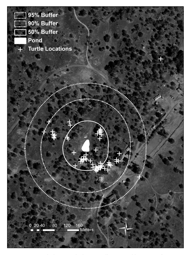
Fig. 3. Aerial photograph showing all terrestrial locations of Western Pond Turtles outfitted with radiotransmitters (N=12) and the various buffer distances that encompass percentages of those locations.