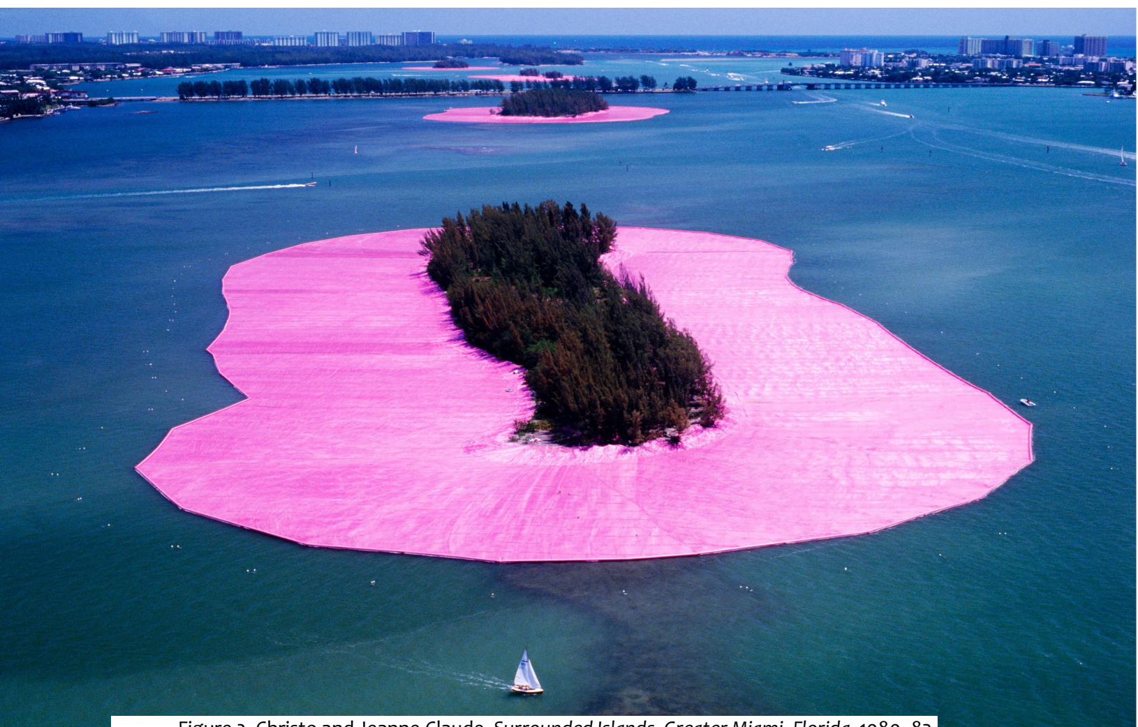
Figure 2. Christo and Jeanne-Claude, Surrounded Islands, Greater Miami, Florida, 1980–83, site-specific installation with polypropylene fabric.

couple was able to raise funds from selling sketches and drawings of the proposed plans for Surrounded Islands . Christo and Jeanne-Claude obtained permits from at least eight different agencies and collaborated with a team of marine biologists, ornithologists, mammal experts, marine engineers, consulting engineers, and building contractors. Safeguarding the integrity of the landscape and seascape was an essential priority for this project and unfolded in its own theatre of ecocritical performance. Florida, as the northern tip of the Caribbean, is part of an ecological zone drastically affected by human activity, as Elizabeth DeLoughrey notes: "There is probably no other region in the world that has been more radically altered in terms of flora and fauna than the Caribbean."<sup>1</sup> The title, Surrounded Islands , accentuates the spatial and temporal conditions of islands as spaces "surrounded" by water and sometimes other islands ( see Figure 1 ). This overemphasis is a response to the poetics of archipelagoes and their material and cultural adaptations through island movements.