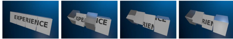
Figure 2. Neural Coordination. Example illustrating the need for coordination in a system where information is distributed across multiple (here only 4) potentially independent elements. Although each cube only reports a particular subset of information, the message “EXPERIENCE” is only encoded when the synchronous display of all four cube faces is accomplished. Here analogous to neural coordination, coordinating mechanisms are crucial for keeping the four cubes synchronous in space and time.