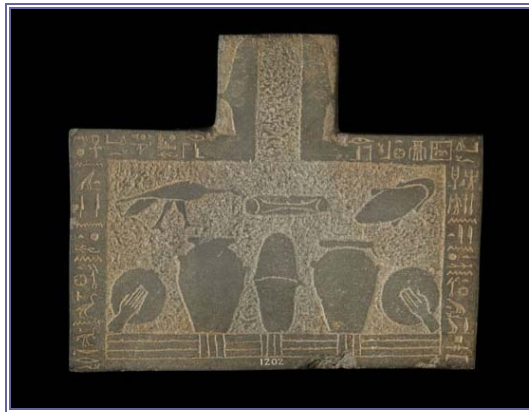
Figure 8. Schist offering table, El Kab, Late Period, British Museum EA 1202. The “spout” of the table is bifurcated but not hollowed into a channel as on some examples; the surface is carved with food offerings, including round loaves offered by disembodied hands.

setting up a punning relationship between the body and the bodily act of prayerful libations (Meskell 2002: 150; cf. Westendorf 1967: 141 - 142). This link between sexuality and