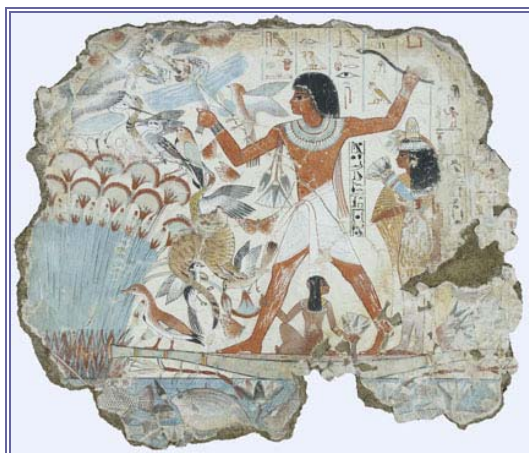
Figure 2. Fragment of painted wall from tomb of Nebamun, Thebes, Dynasty 18, British Museum EA 37977. Nebamun, his wife, and their daughter (seated on floor of boat) exemplify elite ideals of physical beauty, with strong, sensual bodies, fine clothing, and carefully dressed hair.

Sauneron 2000: 37 - 38). There is no clear evidence for female circumcision (excision) during the Pharaonic Period, though there may be some indications for the practice, in particular from the Ptolemaic and Roman Periods (Cohen 1997: 563; Huebner 2009; contra Janssen, J.J. and Janssen 1990: 90). Male circumcision was one of a number of practices related to priestly service, all of which were concerned with purity (see Grunert 2002; Quack 1997; Fischer-Elfert 2005a). Other requirements included washing, cleaning the mouth, shaving body hair, abstaining from sexual activity, and adhering to dietary restrictions (Gee 1998; Roth 1991; Sauneron 2000: 36 - 40).