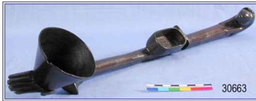
Figure 7. Bronze censer, Ptolemaic Period, Petrie Museum UC30663. The censer has a human hand at one end, holding the bowl for burning incense, and a falcon head at the other end; a cartouche-shaped box in the middle held pellets of incense.