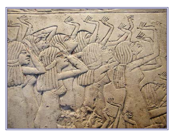
Figure 5. Limestone relief of mourning women, Saqqara, Dynasty 19, Louvre. The women's loose hair and dresses, and flailing arms and hands, fit the trope of female mourners lamenting the dead.

and dancers may bear tattoos (Fletcher 2005) and are almost nude, with distinctive hairstyles that set them apart from elite women (Robins 1999). Their bodies may likewise adopt more informal postures and gestures, sometimes incorporating rear or frontal views (Müller