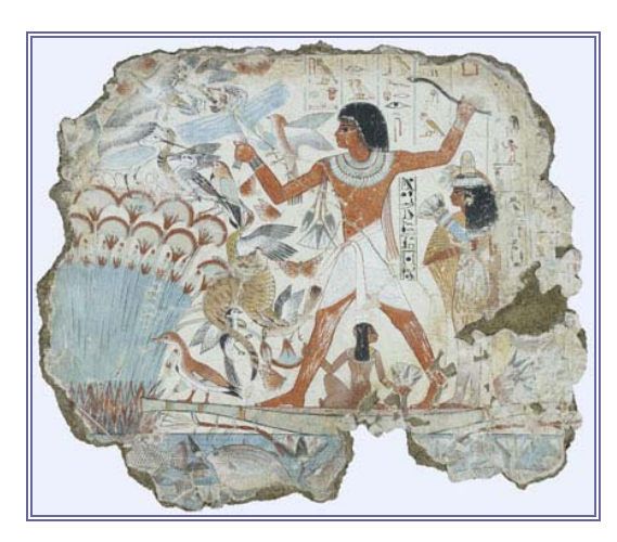
Figure 2. Fragment of painted wall from tomb of Nebamun, Thebes, Dynasty 18, British Museum EA 37977. Nebamun, his wife, and their daughter (seated on floor of boat) exemplify elite ideals of physical beauty, with strong, sensual bodies, fine clothing, and carefully dressed hair.

Sauneron 2000: 37 - 38). There is no clear evidence for female circumcision (excision) during the Pharaonic Period, though there may be some indications for the practice, in particular from the Ptolemaic and Roman Periods (Cohen 1997: 563; Huebner 2009; contra Janssen, J.J. and Janssen 1990: 90). Male circumcision was one of a number of practices related to priestly service, all of which were concerned with purity (see Grunert 2002; Quack 1997; Fischer-Elfert 2005a). Other requirements included washing, cleaning the mouth, shaving body hair, abstaining from sexual activity, and adhering to dietary restrictions (Gee 1998; Roth 1991; Sauneron 2000: 36 - 40).