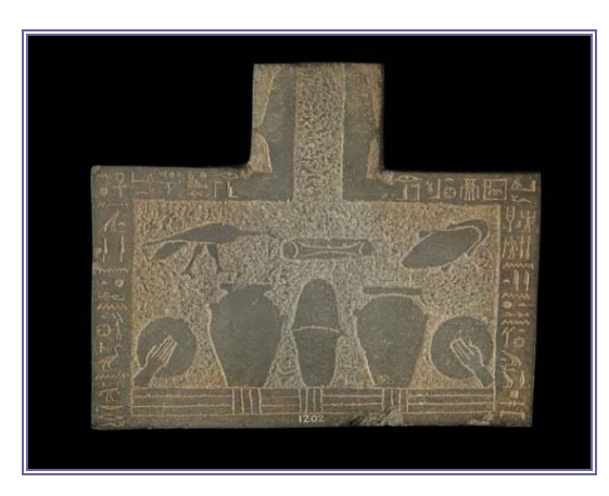
Figure 8. Schist offering table, El Kab, Late Period, British Museum EA 1202. The "spout" of the table is bifurcated but not hollowed into a channel as on some examples; the surface is carved with food offerings, including round loaves offered by disembodied hands.

setting up a punning relationship between the body and the bodily act of prayerful libations (Meskell 2002: 150; cf. Westendorf 1967: 141 - 142). This link between sexuality and