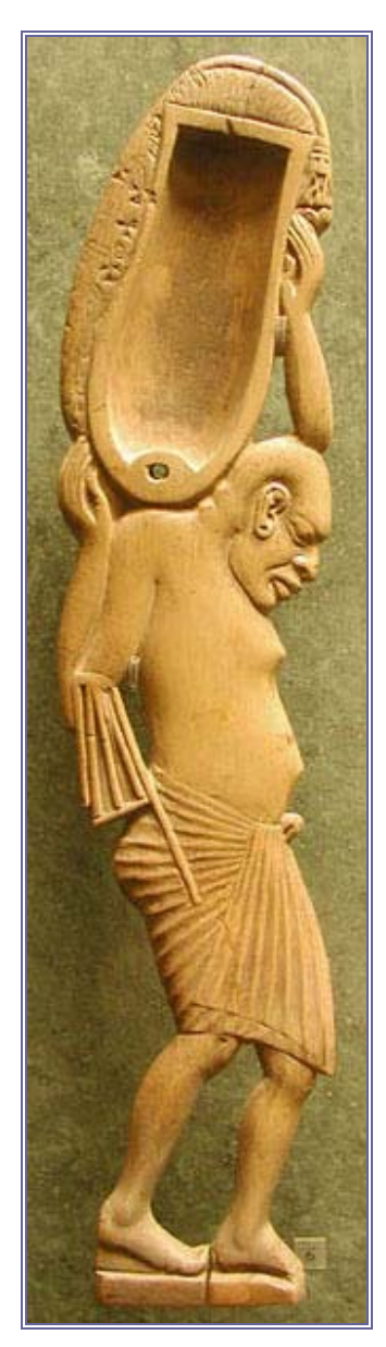
Figure 4. Wooden cosmetic spoon (lid missing), Dynasty 18, Louvre N 1738. The spoon is carved to represent a male servant, struggling with the weight of the "jar" that forms the bowl of the spoon. The servant presents a non-elite body type, with bald head, heavy facial features, and a pot belly

and dancers may bear tattoos (Fletcher 2005) and are almost nude, with distinctive hairstyles that set them apart from elite women (Robins 1999). Their bodies may likewise adopt more informal postures and gestures, sometimes incorporating rear or frontal views (Müller