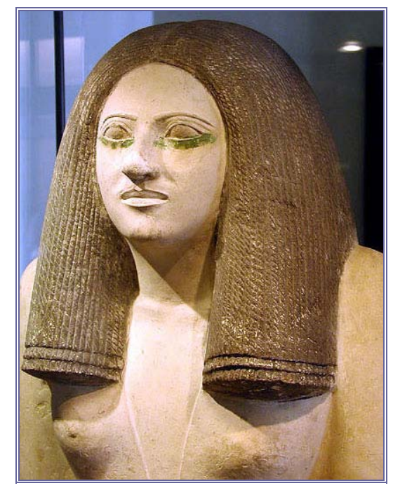
Figure 6. Limestone tomb statue of Sepa, Dynasty 3, Louvre A36. The statue has actual malachite around the eyes. The application of pigments on sculpture was not merely cosmetic: it indicated the elevated status of the person depicted, and was part of "bringing to life" a statue or image.

The importance of grooming and adorning the body is reflected in the number of cosmetic preparations and utensils buried with the dead, along with jewelry and artifacts worn on the body. This pattern of grave goods is observed already in prehistoric times, when combs, pins, tags, beads, and cosmetic dominate burial assemblages (Wengrow 2006: 69 - 71). Bodily associations also permeate the realm of objects and images used in offering rituals. Model phalli and vulvae are attested as votive offerings, as are figurines of naked women and nursing women (Pinch 1993: 197 - 245; see also Pinch and Waraksa 2009; Waraksa 2008, 2009; Pinch 1983). Censers were made in the form of a human hand (fig. 7) and offering tables could have pouring spouts in the shape of the glans penis (fig. 8; Meskell 2002: 151). The action of pouring an offering (stj; water and waterrelated determinatives) is homologous with the word used for both ejaculation and impregnation (stj; phallus determinative),