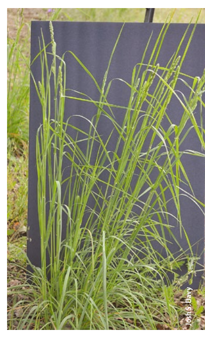
Established Berber orchardgrass (May 2013). By 2014, the Berber grass plot was almost 3 times more productive than the unseeded control plot. In addition, of the three orchardgrass varieties tested, only Berber survived the hot, dry summer.

Soil type did not contribute to significant differences in cover across varieties seeded in 2009 (p = 0.25) or for varieties seeded in 2010 (p = 0.12). However, some varieties demonstrated idiosyncratic differences in cover in response to the different soil types through time. For example, the orchardgrasses Berber and Paiute both demonstrated significantly lower cover on Tehama soil than on Arbuckle soil (a 15% difference in cover for Berber and a 28% difference in cover for Paiute). There was also no difference between the cover of annuals (mean cover = 40.73%, SE = 12.8) and perennials (mean