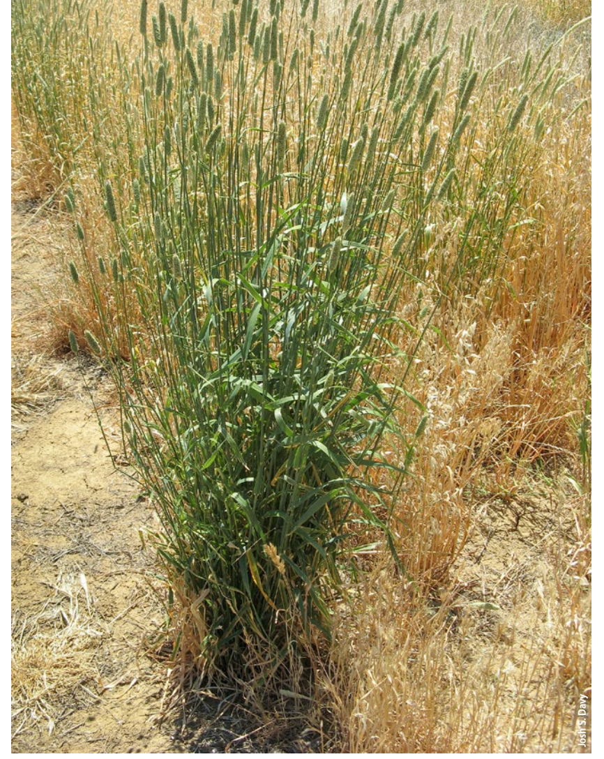
Holdfast hardinggrass, a perennial developed in Australia, proved to be a viable replacement for Perla koleagrass if Perla seeds are not available.