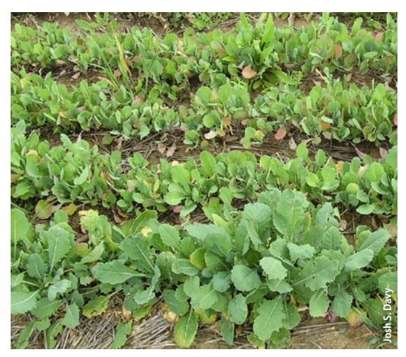
The annual herb Winfred forage brassica should be considered a single-season crop due to its lack of seed production.

al. 2008; Sanderson et al. 2003; Wiedenhoeft 1993) but not in California.