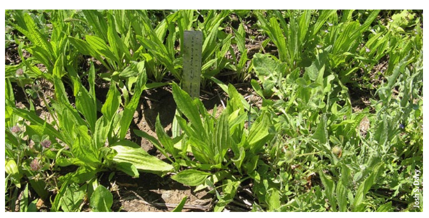
Tonic plantain, a perennial herb, at the end of the first growing season. Trial results suggest that the herb species are best utilized as short rotations before another crop or when high quality forage is needed for the short term.