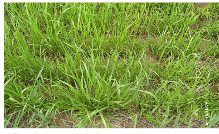
Gulf annual ryegrass established vigorously during its seeding year (April 2010).